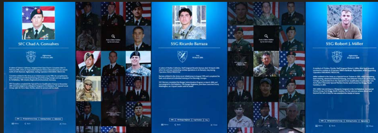
The digital memorial wall located inside the main entrance to the USASOC Headquarters serves as a living, interactive tribute to the ARSOF Fallen of the post-9/11 era.

It is for this reason that the digital memorial wall cannot be reduced to numbers. It is first