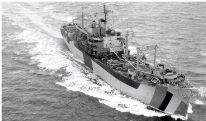
The USS Mendocino (APA-100), flagship of Transport Squadron 14, Southern Attack Force, was a 492 foot long, Bayfield Class ‘attack transport’ (APA), armed with two 5-inch dual-purpose guns, four 40 millimeter antiaircraft (AA) guns, and eighteen 20 millimeter AA guns.

Following a series of minor postwar reorganizations, the unit was inactivated in July 1952. 9 Its next chapter began on 7 January 1963, with the activation of the 389th MI Detachment in Louisville, Kentucky.