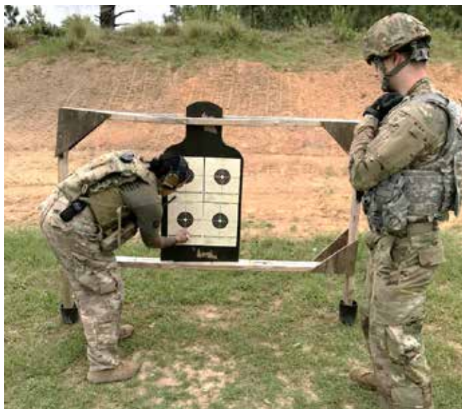
Soldiers from the Analytical Support Company, 389th Military Intelligence Battalion, hone their marksmanship during their 'TITAN FURY' Field Exercise.