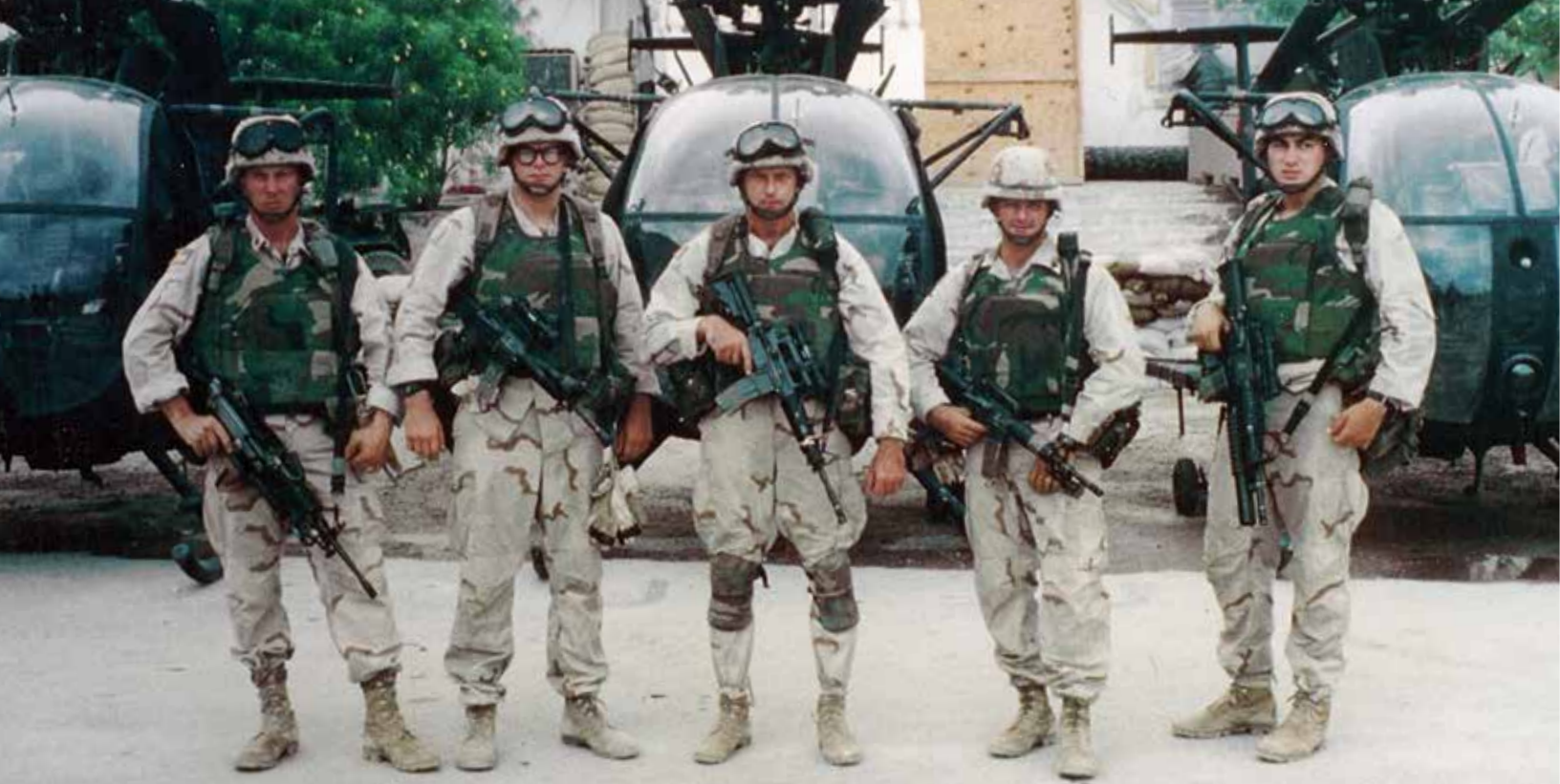
U.S. Army Rangers put their new Ranger Body Armor (RBA) to the test during the Battle of Mogadishu in October 1993.