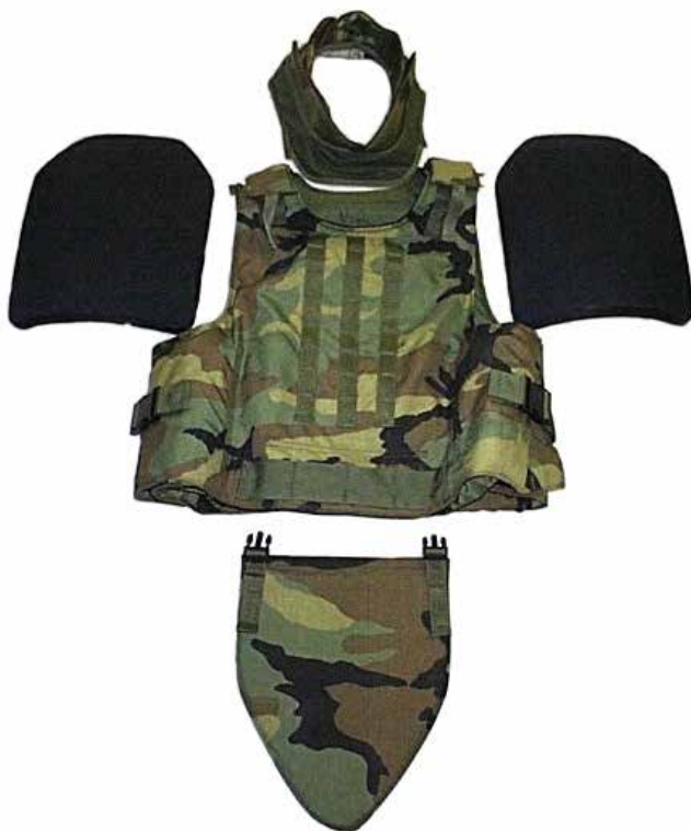
BALCS The Body Armor Load Carrying System (BALCS) vest, an early USSOCOM body armor design, was worn by Special Forces soldiers early in Operations ENDURING FREEDOM and IRAQI FREEDOM.

Within USASOC, the BALCS was issued primarily to Rangers and Special Forces soldiers. 57 Tactical