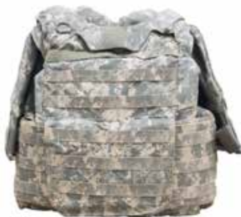
IOTV The Improved Outer Tactical Vest (IOTV), shown here with Deltoid and Axillary Protectors (DAPs), was first introduced in 2007. It provided a similar level of protection as the IBA that it replaced, but benefitted from a quick release that made it easier to remove in the case of emergency.

To address issues of weight and comfort, the U.S. Army Program Executive Office (PEO) Soldier introduced the Improved Outer Tactical Vest (IOTV) in 2007. The IOTV provided a similar level of protection as the IBA, and used many of the same ‘add-on’ components (DAPs, ESBI, and groin protector). Its primary advantage over the IBA was a quick release mechanism that allowed the wearer to remove the vest rapidly in emergency situations, such as a vehicle rollover, fire, or submersion, and provided quick access to wounds. Advertised as lightweight, a complete IOTV weighed approximately 32 pounds. 45