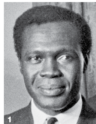
1: Ugandan President Milton Obote on 22 October 1962 at the White House, shortly after his nation's independence.