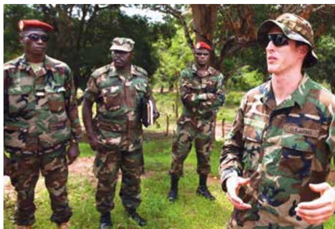
A U.S. Army SF soldier instructs Ugandan and Central African Republic soldiers assigned to the AU-RTF in 2012.