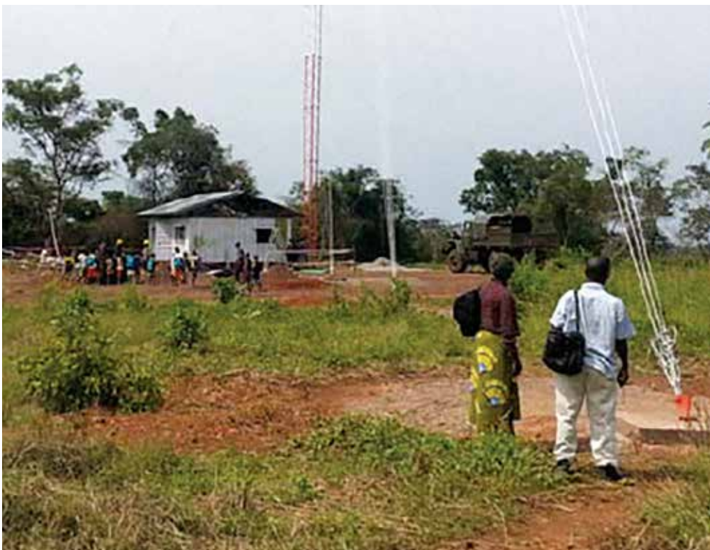
A view of the radio station and antenna in Djema months after installation.