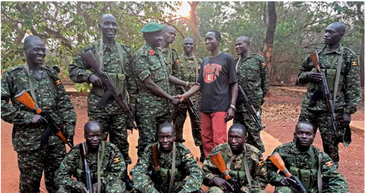
1: A 7th POB soldier conducts a low-altitude aerial loudspeaker mission during Operation OBSERVANT COMPASS, a common practice after 2013. 2: U.S. soldiers prepare to release a leaflet-laden box over a suspected LRA location. 3: Former LRA soldiers who defected and joined the UPDF were frequently highlighted on leaflets.

changed over time. Starting off as the MSE-UG in 2012, it became Regional MISO Team – Uganda (RMT-UG) by 2014, and finally, Regional MISO Detachment – Uganda (RMD-UG) by 2015.