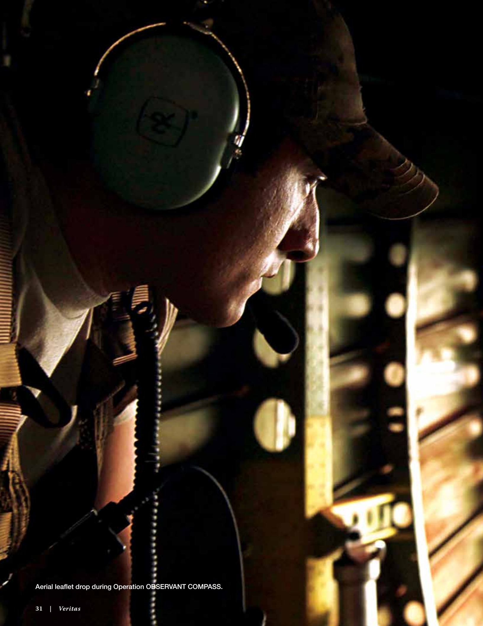
Aerial leaflet drop during Operation OBSERVANT COMPASS.