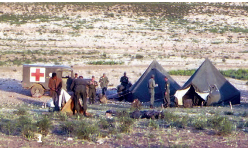
1 | The Base Camp was guarded by two SF radio operators, the ARMISH radioman, and the Iranian truck drivers.