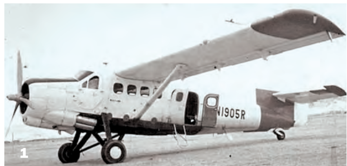
2 | AMS Otter (SN55-3317) upside down on Zagros Mountain ridge in Iran.