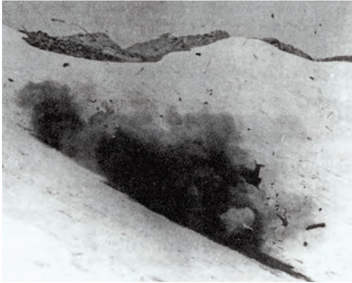
After being stripped of radios and remaining flight instruments, the U-1A Otter was blown to smithereens. It had been rigged with TNT, factored at 'P for plenty.'

"It [the plane wreckage] had been stripped by earlier rescue parties or by tribesmen. ...The front part of the aircraft was smashed almost completely and we wondered how the pilots ever got out of the cockpit."