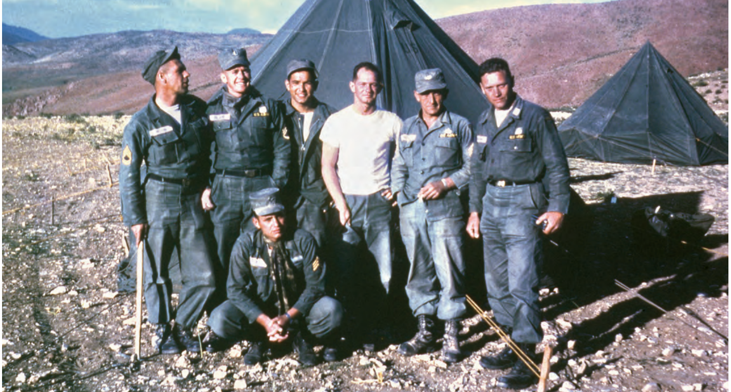
CPT Larry A. Thorne (R) with the Detachement A-2 'High Camp Mountaineers.'

handlers to carry the last body and remaining gear down from the high camp. All of Sunday, 17 June, was spent in that endeavor. Monday morning, 18 June 1962, the SF team loaded their equipment on trucks for Isfahan. Late Tuesday afternoon, 19 June, equipment was turned in to the ARMISH. 78