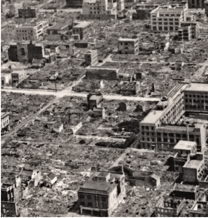
The Japanese city of Osaka suffered greatly from the U.S. bombing campaign. One of LTC Munske's duties was to help restore services to the damaged city.