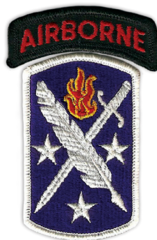
95th Civil Affairs Brigade SSI