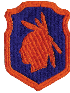
98th Infantry Division SSI