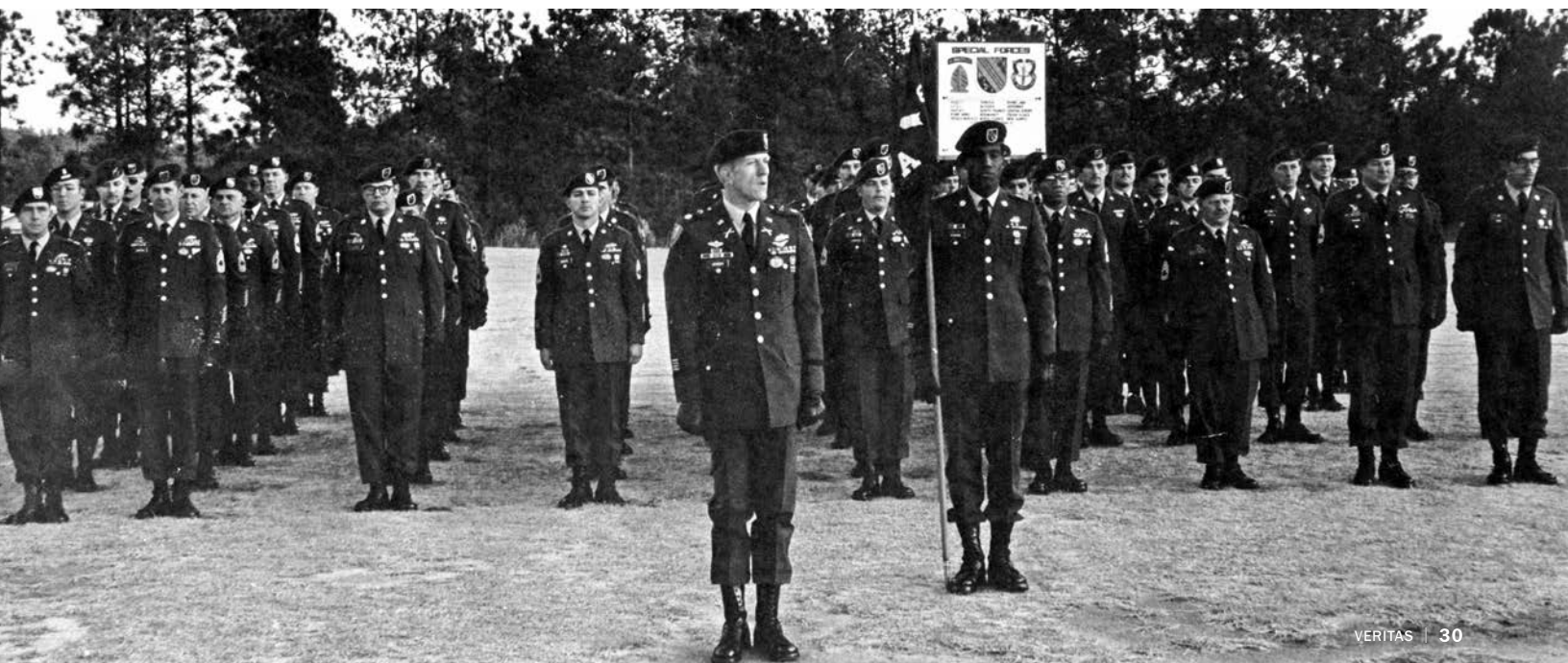
BELOW Company A mustered for the 3/5 th SFG Annual General Inspection (AGI) conducted by the U.S. Army Special Warfare Center. It was a far cry from the Vietnam ODB strength three years prior.