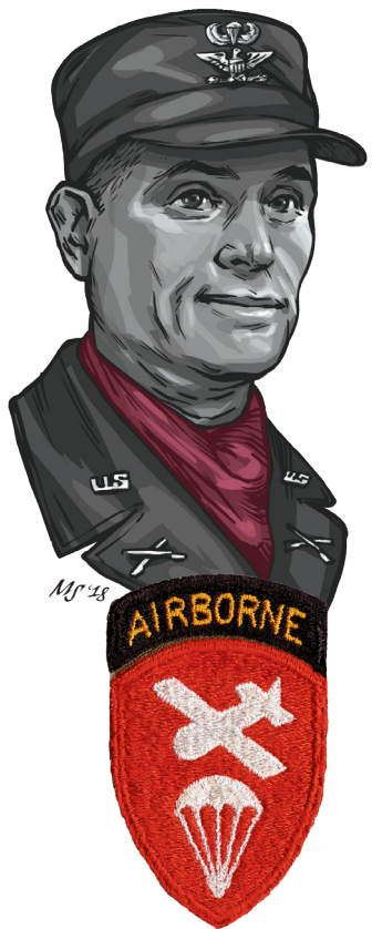
COL Aaron Bank & Airborne Command SSI