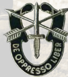
SF Distinguished Unit Insignia.