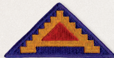
7th US Army SSI