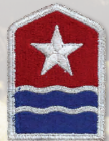
US Army Forces in the Middle East (USAFIME) SSI