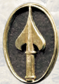
OSS collar insignia.

FA Team #10, 10th SFG; OG EMILY (France), OG BLACKBERRY (China)