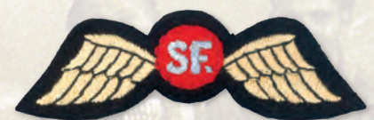
Special Force Wing.