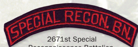
2671st Special Reconnaissance Battalion, Separate (Provisional) shoulder scroll