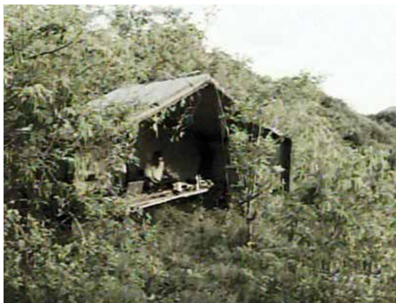
The Colombian Army signal intelligence (SIGINT) was in a remote countryside location.