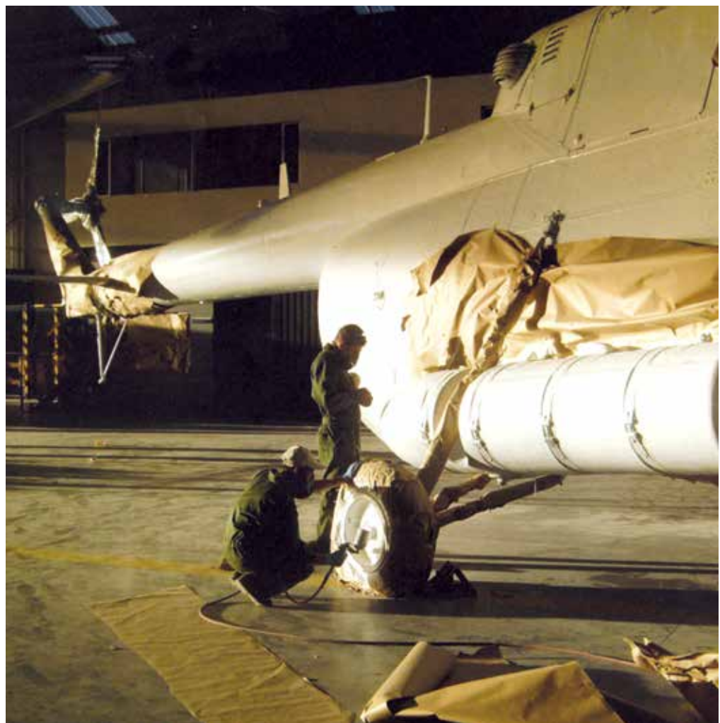
The two oldest Soviet Mi-17 Hip helicopters were repainted in international search and rescue colors: white & red.

The COLAR G-2 and COL Olano* knew full well that the only consistently reliable intelligence on the FARC was being produced by SIGINT. But, these consummate intelligence officers had strong HUMINT backgrounds. Nontraditional recommendations from deep cover operatives in the field were common. ‘Field soldiers’ operated daily based on ‘ground truth.’ This unorthodox concept from the ranks was amazingly logical and feasible if covered properly. It offered possibilities unattainable by conventional methods. The two experienced intelligence officers felt that GEN