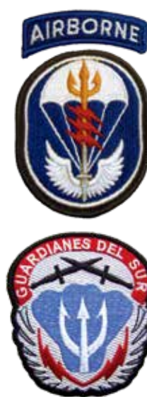
SOCSOUTH SSI and SOCSOUTH Crest with logo “Guardianes del Sur.”