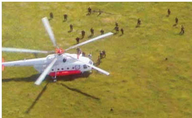
Aerial view of Operación JAQUE with FARC guerrillas approaching the helo.