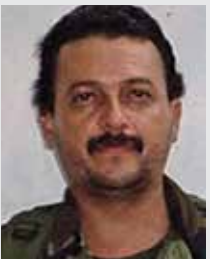
Gerardo Aguilar Ramírez aka César , FARC 1st Front commander, controlled the VIP hostages.