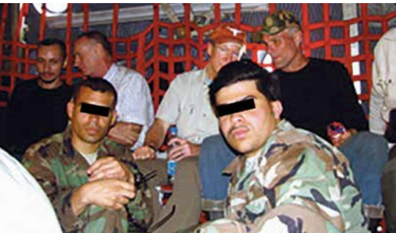
The USAF MC-130 carrying the combined PSYOP team and negotiation leaflets for Plan B was diverted to Tolemaida to carry the Americans to Bogotá.