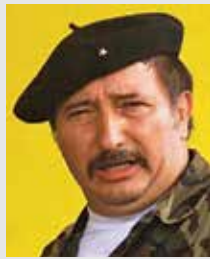
Victor Julio Suárez Rojas, alias Jorge Briceño Suárez aka Mono Jojoy , the FARC Eastern Bloc commander.