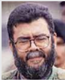
León Sáenz Vargas, alias Alfonso Cano was named as Commander of the FARC on 26 March 2008.