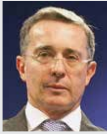
Álvaro Uribe Vélez, President of Colombia.