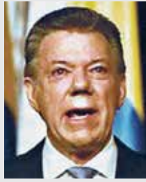
Colombian Minister of Defense, Juan Manuel Santos Calderón.