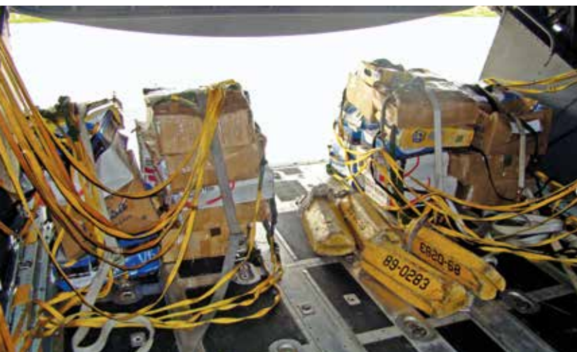
Plan B called for negotiation leaflets to be spread over the area in the event the rescue failed.

These actions confused and frightened the bound hostages. As their bonds were cut free, the former hostages were quietly told that the Colombian Army had just freed them. Then, the recovery team began to chant, "Uribe! Uribe! Uribe!" followed quickly by "Montoya! Montoya! Montoya!" That got the former captives on their feet, tears of joy running down cheeks. They got so excited that they began jumping up and down until the Mi-17 pilot, fighting to control a 'roller coasting' helicopter, ordered everyone into their seats to avoid a crash. Thirty minutes after takeoff, the Mi-17 landed at San José del Guaviare airport where fifteen former captives and their rescuers were welcomed heartily by GEN Montoya. The deception had worked perfectly. Twelve Colombian and three American VIP hostages were rescued without a shot being fired and no one was injured. 59