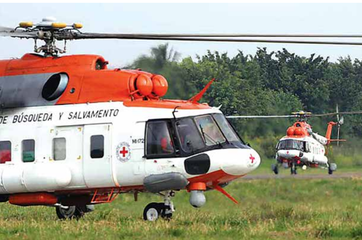
The Venezuelan Mi-17s used in their hostage exchanges had International Red Cross markings.