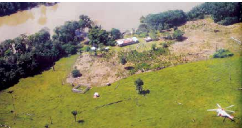
Aerial photograph of the rehearsal site for Operación JAQUE .

On 28 February and 1 March the COLMIL helicoptered additional units into the Dos Ríos area. A small point team from the FARC hostage group was encountered.