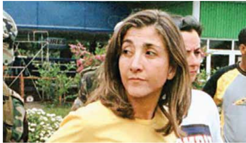
Senator Ingrid Betancourt Pulecio, a presidential candidate, was taken hostage while campaigning in FARC -landia on 23 February 2002.