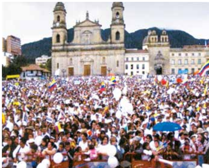
The citizens of Bogotá filled the city’s streets on 3 July 2008 to celebrate the JAQUE rescue and to condemn the FARC .

The ability of the COLMIL to unilaterally compartment, plan, and execute a complex deception ‘sting’ operation as an integral part of a greater combined deception operation was most remarkable. Operación JAQUE speed-lifted the COLMIL into the ranks of the top three Latin American militaries and into the upper tier internationally. Unique to the JAQUE deception operation was the absence of casualties—friend or enemy. That factor alone separates and raises this 21 st century success above the modern 20 th century Entebbe and Princess Gate raids, the Trojan horse employed during the Greek Wars,