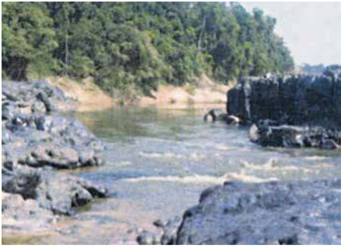
Yapurí River where the three Americans were spotted bathing during Operación ELIPSE .