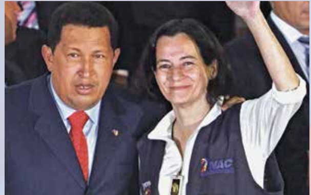
Venezuelan President Hugo Chavez arranged the humanitarian release of Clara Rojas from the FARC on 10 January 2008.