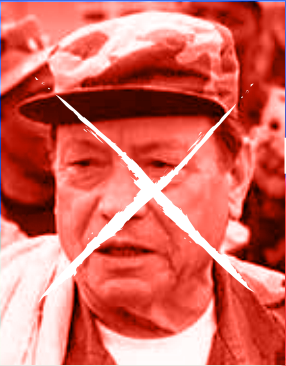
Pedro Antonio Marín Marín, alias Manuel Marulanda Vélez aka Tirofijo (Sure Shot), the founder and supreme leader of the FARC , was reported as dead on 26 March 2008.