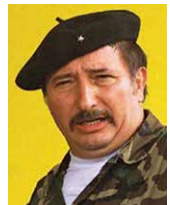
Victor Julio Suárez Rojas (Jorgé Briceño Suárez, 'Mono Jojoy') was the FARC Eastern Bloc commander.