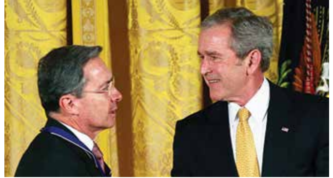
Colombian President Álvaro Uribe Vélez (2002-2010) meets U.S. President George W. Bush.

While the FARC had been taking hostages for decades (more than 500 military, police, and local government officials) for ransom and political negotiations, it was