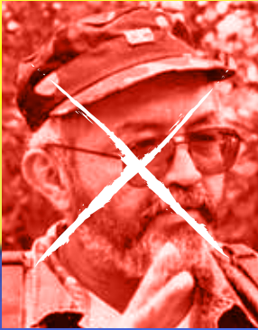
Luís Edgar David Silva, alias Raúl Reyes , the FARC Southern Bloc commander, was killed along the Ecuador border by COLSOF.