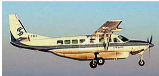
Cessna 208B Caravan flown by SOUTHCOM Reconnaissance Systems (SRS), a subsidiary of Northrop Grumman.