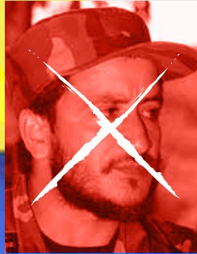
Jose Juvenal Velandia, alias Iván Ríos aka Manuel Jesús Muñoz , the FARC Central Bloc commander, was killed by his security chief for reward money.