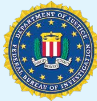
FBI Federal Bureau of Investigation