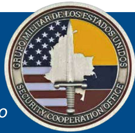
Bogotá MILGP Coin

“Speak with one voice and become fully integrated with the embassy departments and supporting agencies as well as the Colombian military at all levels—tactical to operational to strategic.”