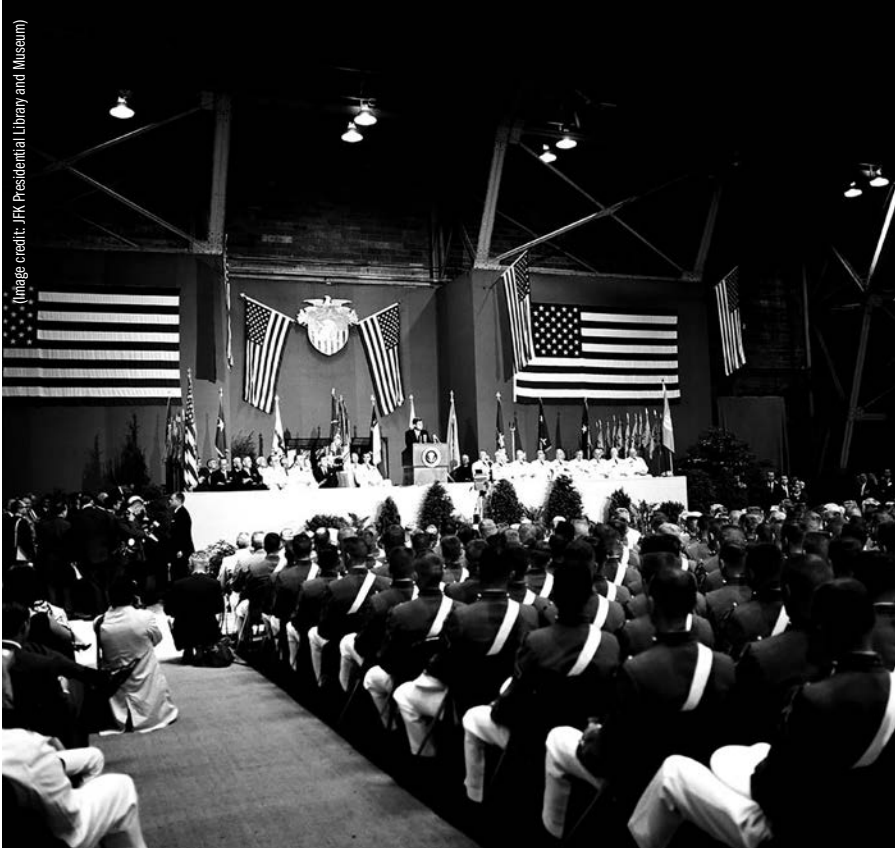
Different view of President Kennedy addressing the West Point Class of 1962

es that will be before us in the next decade if freedom is to be saved, a whole new kind of strategy, a wholly different kind of force, and therefore a new and wholly different kind of military training.