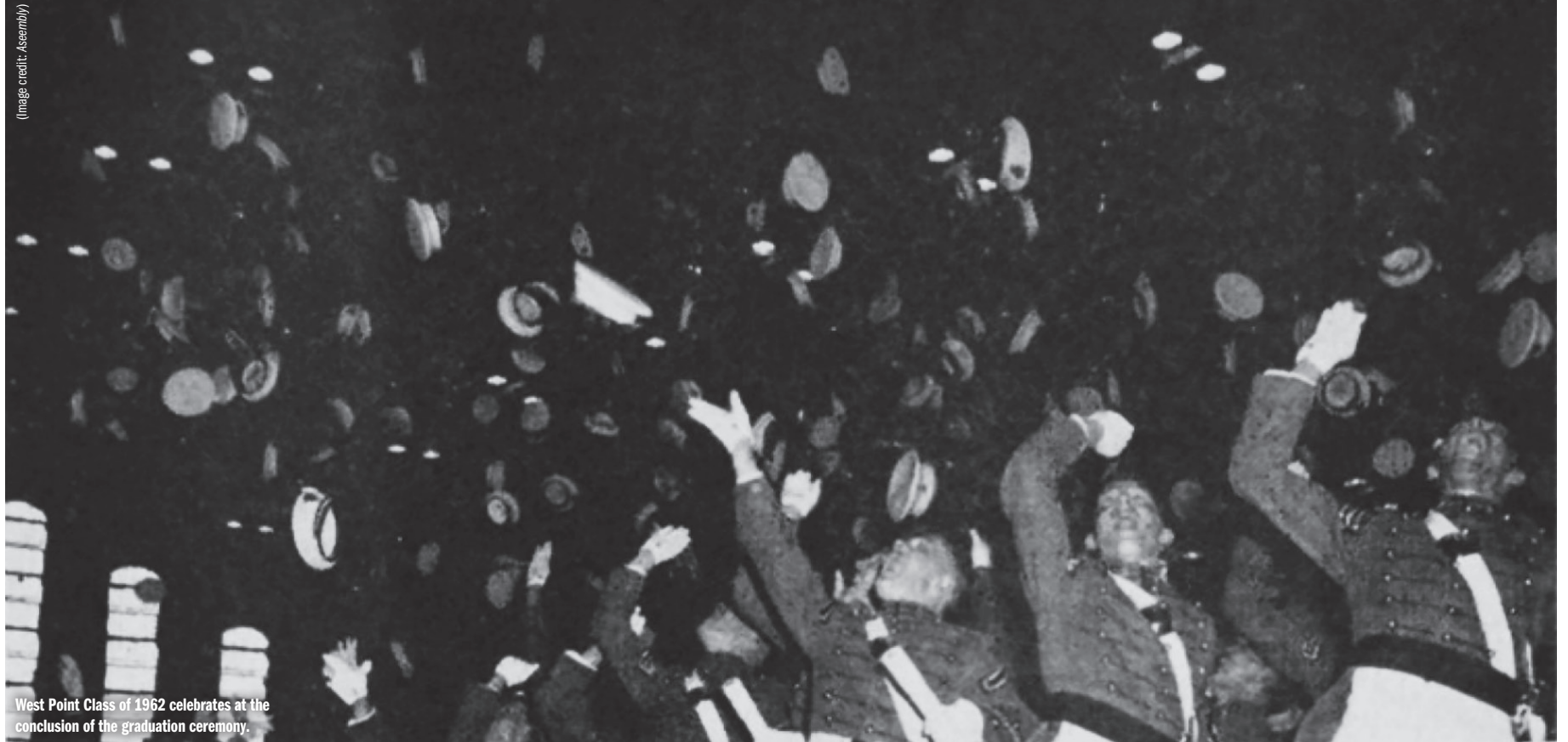
West Point Class of 1962 celebrates at the conclusion of the graduation ceremony.