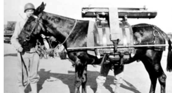
Cradle, top sleigh, one lifting bar = 228.5 lbs. Total weight = 334.6 lbs.