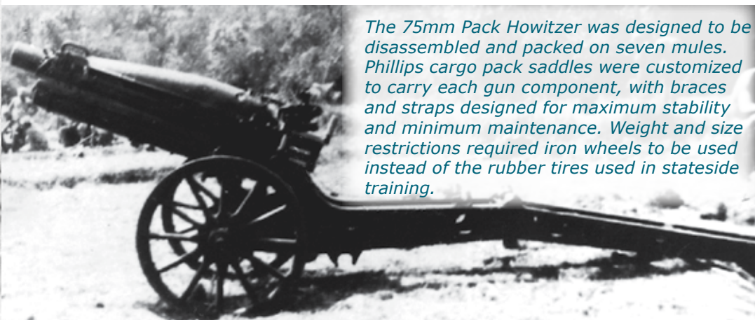
The 75mm Pack Howitzer was designed to be disassembled and packed on seven mules. Phillips cargo pack saddles were customized to carry each gun component, with braces and straps designed for maximum stability and minimum maintenance. Weight and size restrictions required iron wheels to be used instead of the rubber tires used in stateside training.