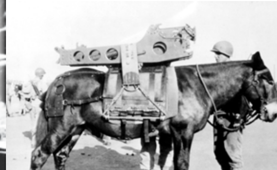
Front trail and one lifting bar = 243.0 lbs. Total weight = 341.9 lbs.

Cannoneers could assemble or disassemble the gun in five minutes, mule to firing position. "To load this small Howitzer, the mules who carried a piece of the gun were placed in a circle around the gun. There were seven mules for the job. As the mule handler received his portion of the gun he would move clear, and when the wheels were placed on the last mule, the gun was ready to be moved to its next firing position."—Ken Laabs (B/612)