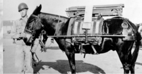
Bottom sleigh with recoil mechanism, one lifting bar, two oil cans, one oil carrier = 224.6 lbs. Total weight = 330.7 lbs.

WHEN MARS Task Force was formed in November 1944 to combat the Japanese in Burma, it comprised not only infantry and quartermaster troops, but also the 612th and 613th Field Artillery Battalions (Pack). It had been noted that the Merrill's Marauders could have used considerably more firepower during their campaign, so when the 5332nd Brigade (Provisional) formed, it took along 75mm Pack Howitzers and the men and mules needed to transport and fire them.