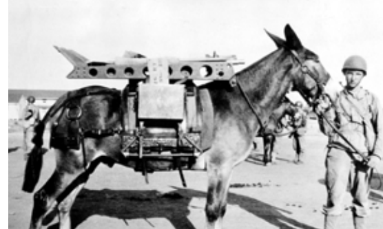
Rear trail, trail hand spike, axle, sight = 248.0 lbs. Total weight = 341.9 lbs.

By the end of the task force's trek, men and mules had walked hundreds of miles, crossing streams and rivers (one particular stream almost fifty times in one day), climbing and descending mountains, hacking through jungle undergrowth, and slogging through rice paddies. They had routed the Japanese and reopened the supply line to China. Though often forgotten in the trek's recounting, the mountain artillery boys, their 75mm Pack Howitzers, and their trusty mules were key to the entire campaign's success. Here are a few glimpses of what it was like to be in the pack artillery in Burma.