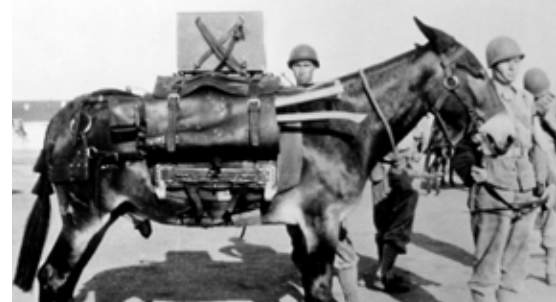
Pioneer kit: tools, picket line, ropes = 144.5 lbs. Total weight = 239.0 lbs.

Cannoneers could assemble or disassemble the gun in five minutes, mule to firing position. "To load this small Howitzer, the mules who carried a piece of the gun were placed in a circle around the gun. There were seven mules for the job. As the mule handler received his portion of the gun he would move clear, and when the wheels were placed on the last mule, the gun was ready to be moved to its next firing position."—Ken Laabs (B/612)