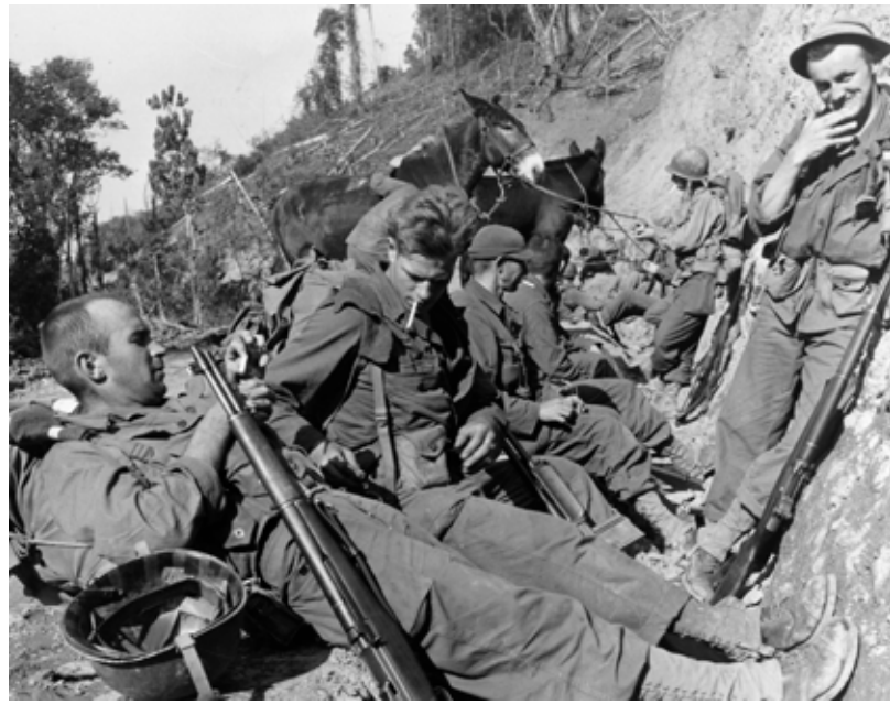
When the 5307th started out on their campaign in February of 1944, they followed the Ledo Road from Assam, India, into Burma. As shown here, the Marauders occasionally marched side-by-side with allied Chinese troops under Lieutenant General "Vinegar Joe" Stilwell's command. Conditions in Burma varied from uncomfortable to downright miserable. The soldiers waded rivers, slogged through mud, hacked bamboo, trudged through elephant grass, crawled up mountains, and stumbled down slopes. The temperature ranged from hot to hotter, inspiring many a Marauder to discard his jacket and blanket the first day on the trail. Many also swapped their hot, heavy combat helmets for the comfort of cloth hats.