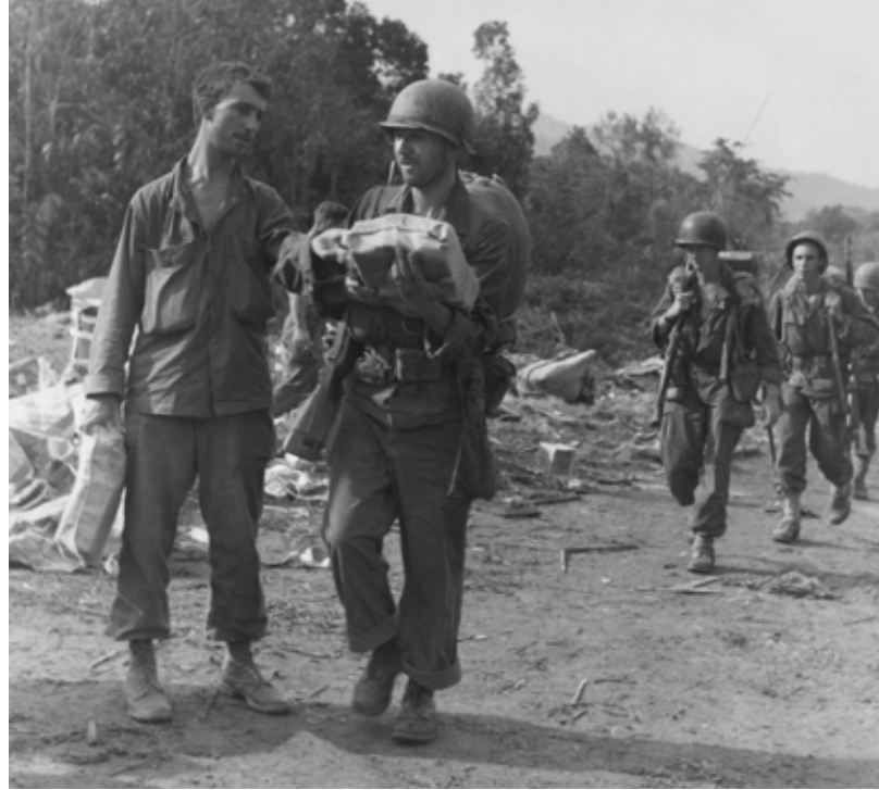
This 29 April 1944 photograph shows the Marauders of Khaki Combat Team picking up a three-day supply of 'K' rations as they set out on yet another leg of their march through Burma. The daily K ration, divided into three meals, contained three thousand calories compressed into the most compact form possible. Ration staples included the four ounce U.S. Army field ration D (a dense bar consisting of chocolate, skim milk powder, sugar, oat flour, cocoa fat, vitamins C and B, and artificial flavoring), a small can of chopped ham and egg or a can of processed cheese, a K-1 biscuit, sugar cubes, and coffee or bullion powder. Meant only for survival situations, the K ration was not an adequate diet for men marching through the jungle, but was better than what they ate when the K rations ran out—nothing.