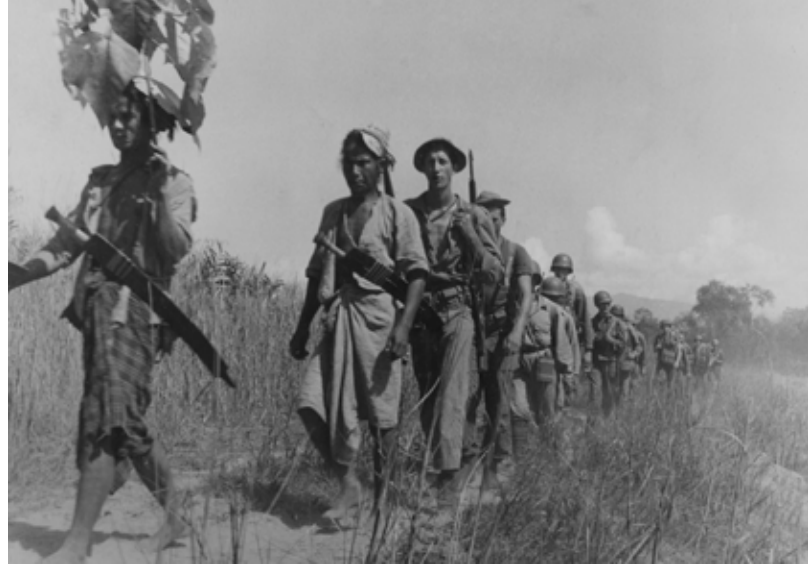
Indigenous Kachins served as guides for the Marauder combat teams through the unfamiliar and unmapped territories of Burma. These mountain tribesmen were looked down on by the lowland Burmese, but fiercely resisted the Japanese invasion.