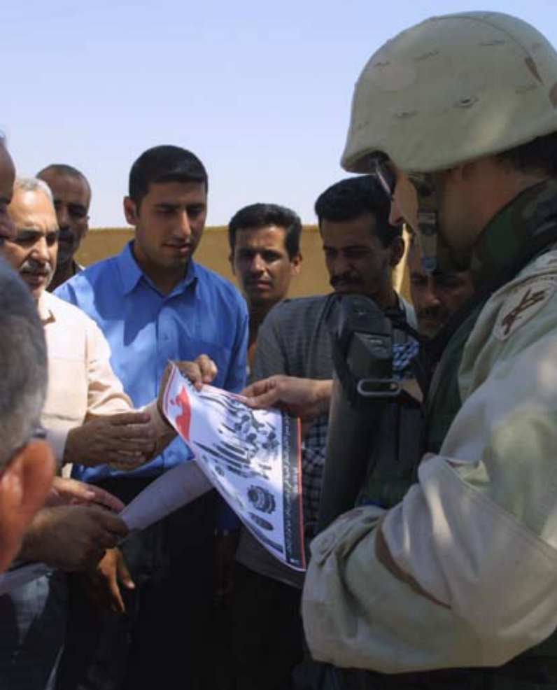
The 315th Tactical Psychological Operations Company developed and distributed handbills and posters warning of mines and unexploded ordnance scattered throughout Baghdad. As Tactical Psychological Operations Teams made their distribution rounds, they took the opportunity to interview residents regarding the effectiveness of the products.

continuously to cover the 5.6 million people who lived in Baghdad, the plastic components of the copier (in the non-air conditioned terminal) literally melted with the 100,000th copy. Nineteen three-man tactical PSYOP teams then distributed them throughout the city by hand. 3