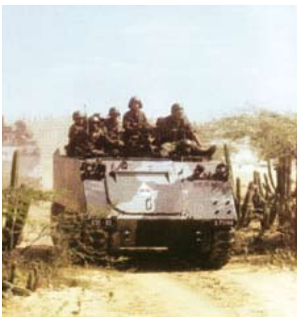
The M-113 is a U.S.-produced armored personal carrier and is in widespread use world-wide, seeing use in some forty-four militaries. It can carry eleven personnel and two crewmembers. Although it can be armed with a number of weapon systems, the most common are a heavy machine-gun or a grenade launcher.