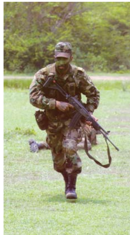
The main battle rifle of Colombian forces is the Galil, as seen here.