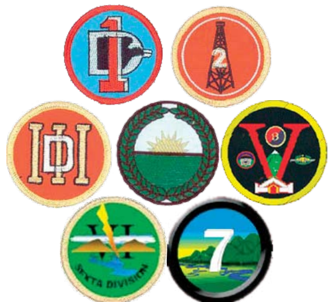
Colombian Army Division patches

The army is organized into seven numbered divisions that are geographically-based around the country in regional Areas of Responsibility (AORs). 4 A soldier