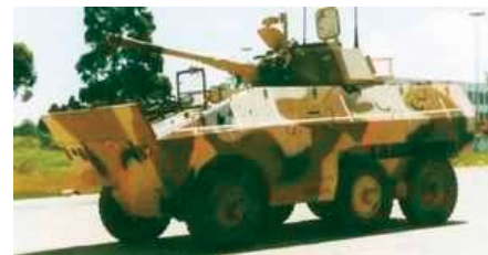
The EE-11 Urutu is a 6x6 armored personnel carrier that was designed by Engesa, a Brazilian company, in the 1970s. It can carry up to twelve personnel, in addition to the driver.