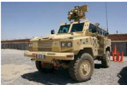
The RG-31 Nyala, made by the South African firm of Land Systems OMC, is a multi-purpose mine-protected vehicle. It features a "V"-shaped hull and has high ground clearance.