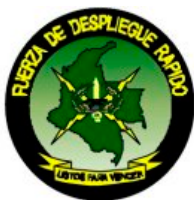
Fuerza de Despliegue Rápido (FUDRA) patch

is usually drafted into the division in his home region and it is possible for him to serve his entire career in a single geographic area. There is also an Aviation Brigade, the Brigada de Aviación del Ejército and the Brigada de Apoyo Logístico (Logistics Brigade) with a supply battalion, maintenance battalion, a Batallón de Intendencia which supplies clothing and footwear to the Army, and a separate logistics battalion supporting Joint Task Force–South. 5 Colombian divisions are not uniform in structure and can have two to five infantry brigades. Each brigade is organized with three infantry battalions, a cavalry group for reconnaissance, one direct support artillery battalion, an engineer battalion and a service battalion. The Army is improving its mountain warfare capabilities as part of the counter-insurgency campaign and has fielded special battalions designed for combat in the Alta Montaña (High Mountains) in those divisions in the mountain regions. Presently only six of twenty-one brigades within the army are fully manned with the remainder under strength. 6 The Colombian Army has no Corps headquarters. Each division is an autonomous entity within its AOR.