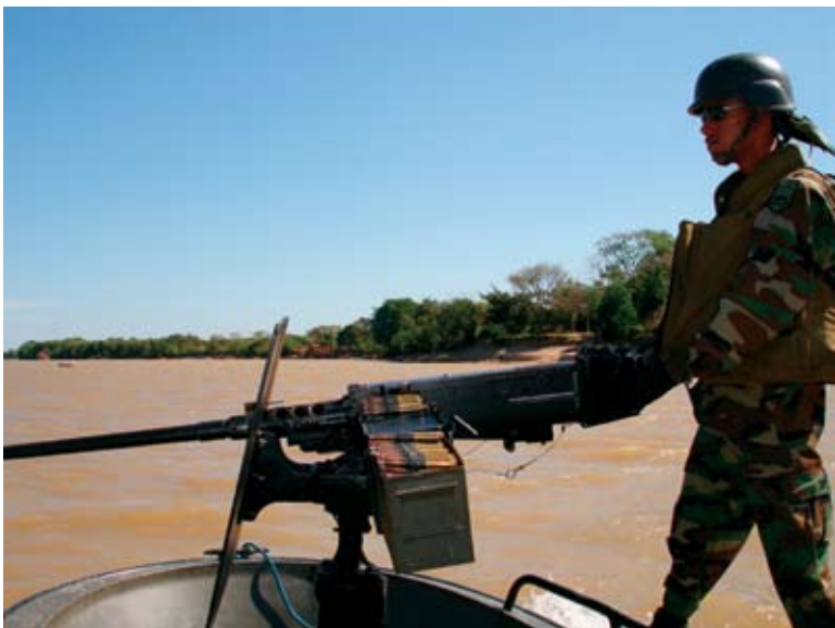
A Colombian Marine mans his M-2 .50 caliber heavy machinegun. The Marines and the Navy perform operations along Colombia's rivers that assist in the Army in its counter-insurgency mission.

recover kidnapping victims and to capture the kidnappers. There are sixteen GAULA in the Army, two in the Navy, and ten in the National Police. 7