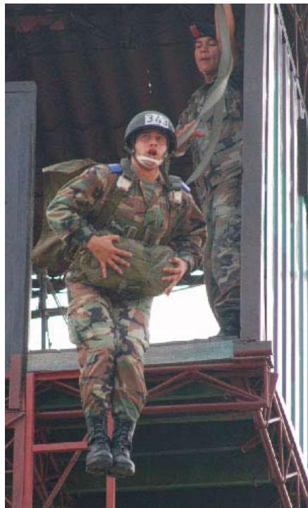
A Colombian paratrooper in training takes his turn jumping from the 34-foot tower.

the Professional Officers Corps Reserve. They are generally selected and serve with the division near their homes. 9