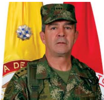
General Mario Montoya Uribe, Commanding General of the Colombian Armed Forces

The Colombian President is the Commander-in-Chief of the armed forces, while the Minister of Defense has operational and administrative control. Next in the chain of command is the military commander of the armed forces, which, given the Army's size and influence, has always been an Army three-star General. This is also the highest rank in the Colombian military. The Army is officially charged with the defense of Colombia from outside aggressors. In actuality its mission has undergone extensive restructuring since 1999, and is now almost completely focused on fighting the counterinsurgency.