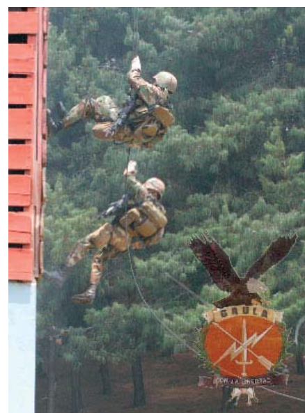
The GAULA, or Grupos Acción Unificada por la Libertad Personal (Groups of Action Unified for the Liberation of Persons), was set up in 1996 to be a force responsible for recovering kidnap victims and to battle the kidnapers.