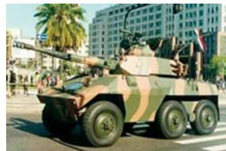
The EE-9 Cascavel armored car was developed by the Brazilian company, Engesa. It features a 90mm main gun, has a crew of three, and is extensively used by the Colombian cavalry elements.

The Colombian Army has an extensive network of schools, mostly located in Bogotá, that train soldiers. Recruits undergo training at regional centers located at Bucaramanga, Pamplona, Ocana, Barranca bermeja, Sogamoso, Chiquinquirá, Villavieco, and Guaviare. 8 The Military School of Cadets, known in Colombia as the Escuela Militar de Cadetes "General José María Córdova," is the Army's officer academy (the Colombian equivalent of West Point). Students undergo a five-year curriculum, after which they receive a commission as a Second Lieutenant. The next level of professional school for officers is the National War College, the Escuela Superior de Guerra , which is open to all the services. Persons with specialized qualifications in medicine and law are commissioned as volunteers through