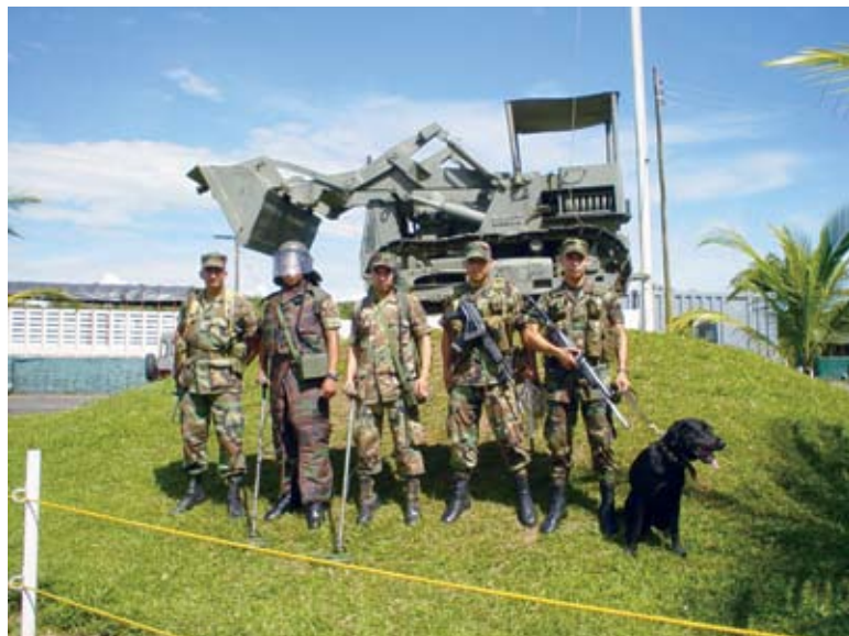
Colombian engineers stationed in Tolemaida display their equipment, including mine detectors, protective equipment, and an explosive-sniffing dog.