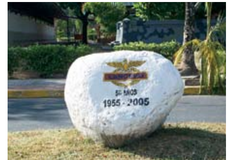
Numerous monuments on the unit history are located around the Lancero training area at Tolemaida. This stone commemorates the 50th Anniversary of the founding of the Lanceros .

The Comando de Operaciones Especiales Del Ejército (COESE pronounced CÕ-Ess-Ã) functions in a manner similar to that of the U.S. Army Special