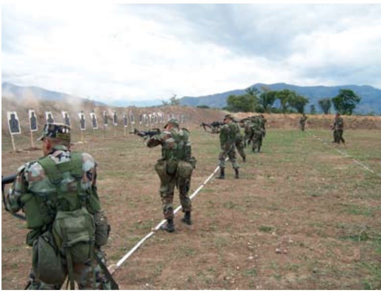
U.S. Army Special Forces soldiers training BACOA troops on the range at Tolemaida.