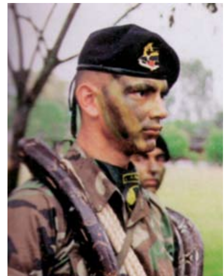
Graduates of the Lancero Course receive the coveted Lancero badge. This soldier with a large boa on his shoulders, typifies the image of the Lanceros .