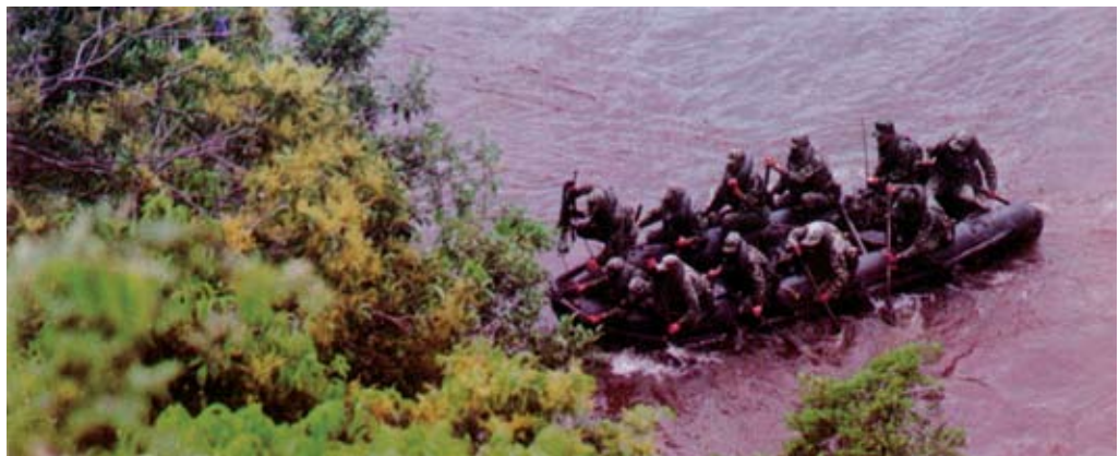
The Naval element of the CCOPE is the BAFEIM. These highly skilled troops are experts in operations in the sea and rivers of Colombia, performing insertion missions in the manner of the U.S. Navy SEALs.