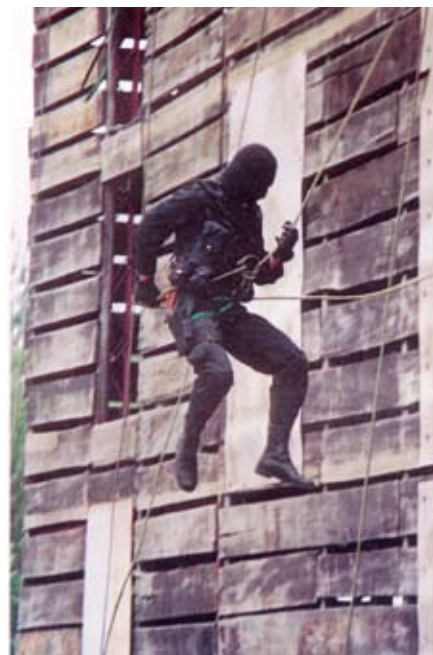
Rigorous training such as building rappelling is common in the AFEAU.

Colombia) to eliminate the narco-terrorists, the special operations units of the CCOPE have a crucial role in the accomplishment of that mission. The CCOPE units are not large in size and are deficient in some assets such as helicopters that would make their employment more effective. As the Colombian Army addresses these shortfalls, the SOF units of the CCOPE will play an increasingly prominent role in the ongoing narco-terrorist war in their country. ▲