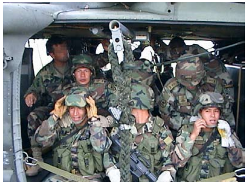
The BACOA use the fast-rope technique of insertion during missions. Here BACOA troops train at Tolemaida with their Special Forces advisors.

Operations Command. 11 It is the Army branch of the CCOPE much like USASOC is the Army Service Component within the U.S. Special Operations Command. The COESE primarily functions as a force provider for the two battalions. 12 Since the CCOPE is a joint command organization, it contains Colombian Air Force and Naval Special Operations units, the ACOEA and BAFEIM.