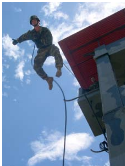
U.S. Army Special Forces practice rappelling at Tolomaida prior to training with their Colombian partners.