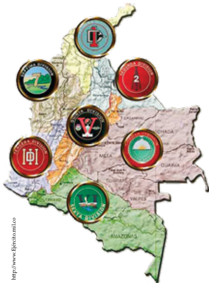
Map depicting the Areas of Responsibility of the Colombian Army divisions.