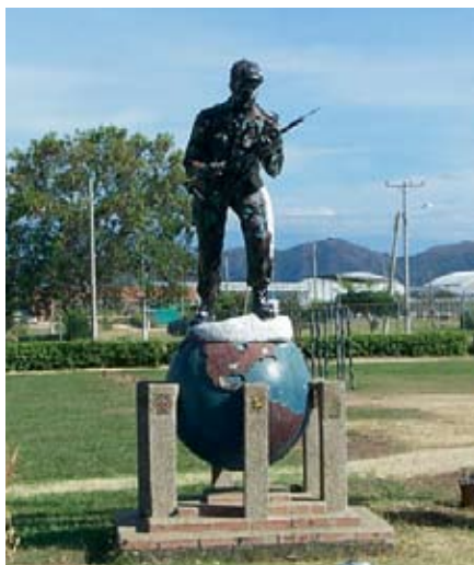
Statue of the Lancero at the unit training site at Tolemaida.