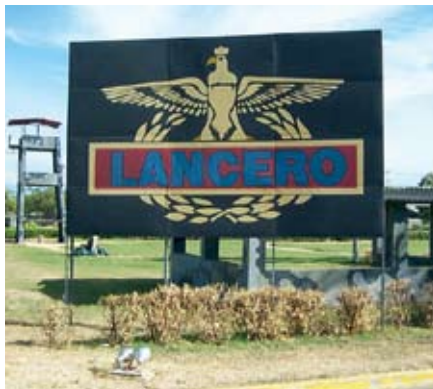
The Lancero School is the most prestigious Ranger-type school in Latin America.