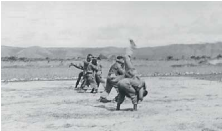
Lancero instructors demonstrate hand-to-hand combat.