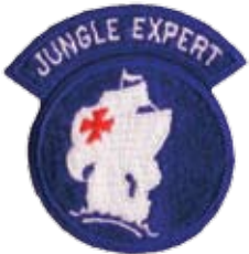
A Jungle Expert tab was added to the U.S. Army Caribbean Command shoulder patch to make the Jungle Warfare Expert pocket patch.