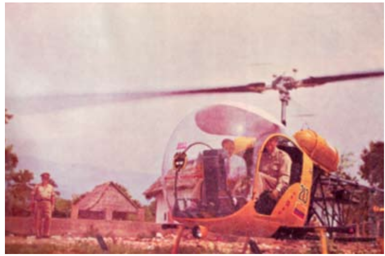
President Gustavo Rojas Pinilla, an avid helicopter pilot, established the Colombian Army helicopter school at Tolemaida.

soldiers to become NCOs and improve the skills and leadership of junior NCOs. 3