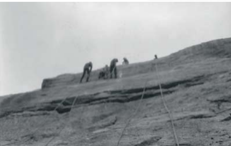
Lancero rappelling and climbing site.

Lancero motto: "Para los Lanceros no existe la palabra 'imposible'" (For Lanceros the word "impossible" does not exist).