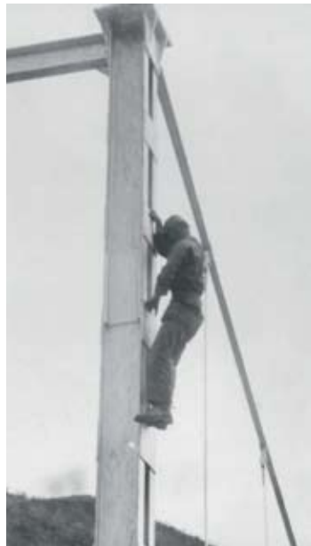
A Lancero instructor climbing a bridge girder to demonstrate the "High Jump" confidence test.