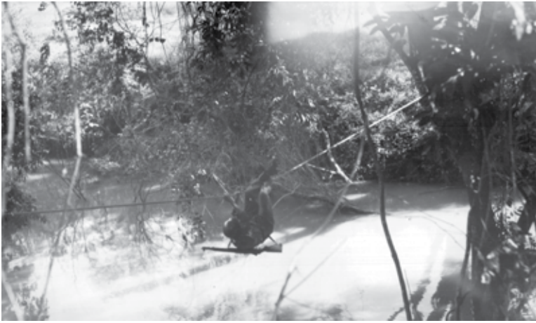
Lancero student commando-crawling across a stream on one-rope bridge.