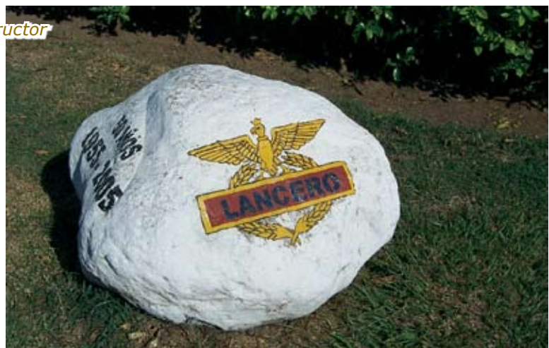
Painted rocks at Tolemaida commemorate the 50th Anniversary of the Lancero School (1955–2005).