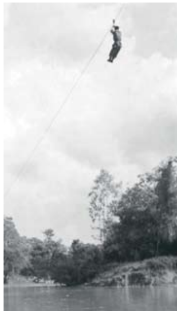
Colombian Lancero School "Slide for Life" confidence test across the Sumapaz River.