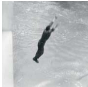
Colombian Lancero student executes the "High Jump" confidence test into the Sumapaz River.

ing (PT) started and ended every day. Students ran to instruction at a "double time" just as the Americans did in parachute training. 12