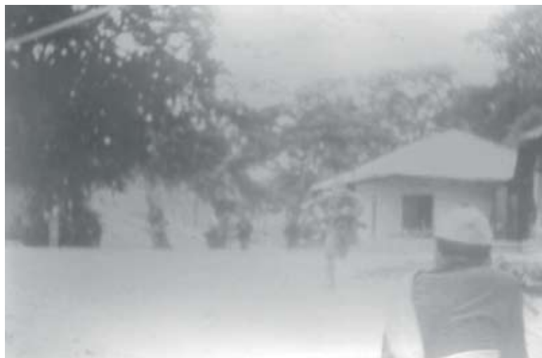
Aggressors wore a dyed-blue one-piece mechanic coverall with a skull-head shoulder patch; khaki overseas cap; and a rolled, khaki-colored poncho over their left shoulder.