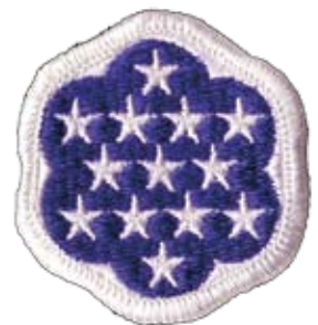
U.S. Military Advisory Assistance Group shoulder patch

"In the beginning the Colombian lieutenants often said, 'We can't do this or that because we are poor. We do not have the training facilities, sites, and aids that Fort Benning has.' Their time at Fort Benning had spoiled them. I countered the excuses by suggesting 'field expedients.' They started using their imagination and became innovative. We had no bleachers for classes. After building up a large mound of dirt, they terraced and packed it down, and then sodded it with grass to prevent erosion. We didn't have sawdust to cushion the ground in the hand-to-hand combat pit so they improvised with corn husks. They made stick figures from tree limbs, dressed them in old uniforms, and stuffed them with corn husks (like scarecrows) to serve as dummies for the bayonet assault course. I was so proud of them and their ingenious solutions. This attitudinal change just seemed to happen all of a sudden. They began to live what is today the Lancero motto , ' Para los Lanceros no existe la palabra 'imposible,' (for Lanceros the word 'impossible' does