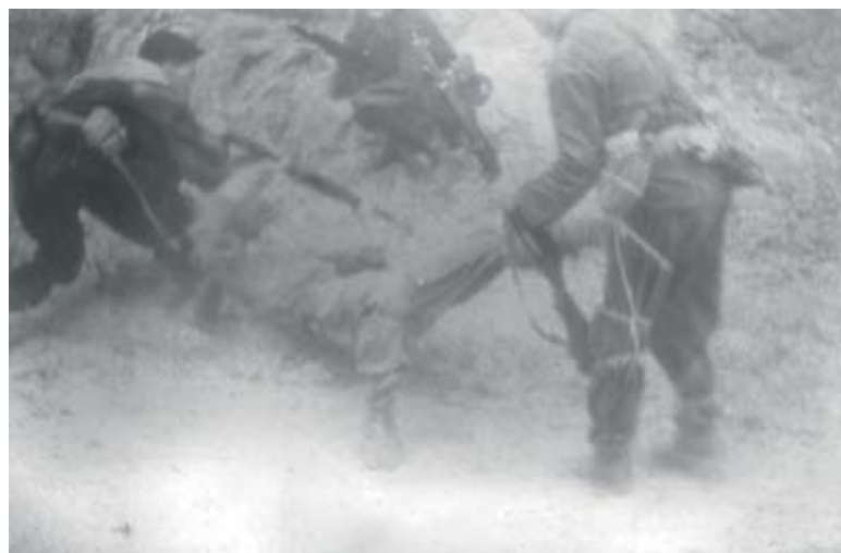
A Colombian Lancero is physically taken captive by aggressors from Batallón Colombia. Note: They adopted the Lancero tradition of tying their baggy trousers with string to reduce noise.