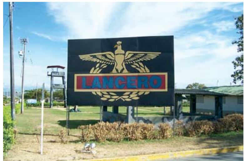
Lancero School sign at Tolemaida.