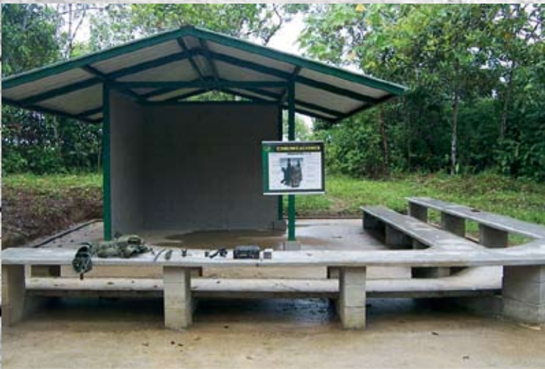
Communications station prepared for training with the PRC-710 radio. This training site would compare to many in the U.S. Army.