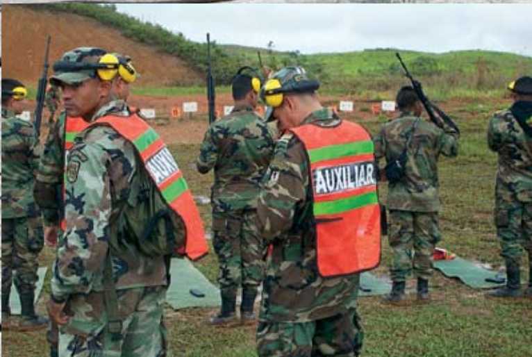
CERTE Instructors oversee a zero range at Larandia.