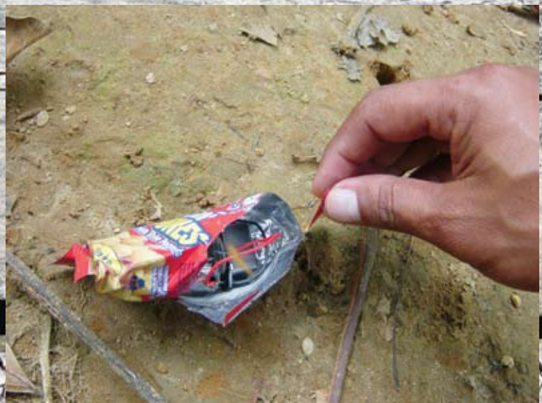
Here a trigger device is hidden inside a discarded potato chip bag, waiting for someone to step on it.