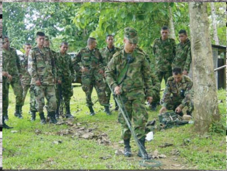
IED detection training at Larandia Here the soldiers use the mine detector to find IEDs.