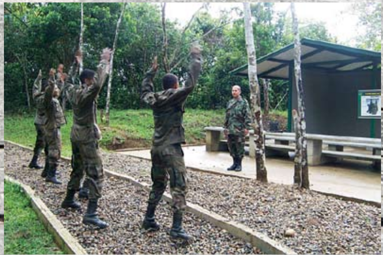
After running from a previous station, these soldiers conduct calisthenics. Then they must accurately transmit a radio message in a specified time.