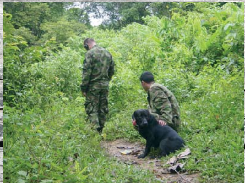
An alternate method is to use an explosive dog to find IEDs.