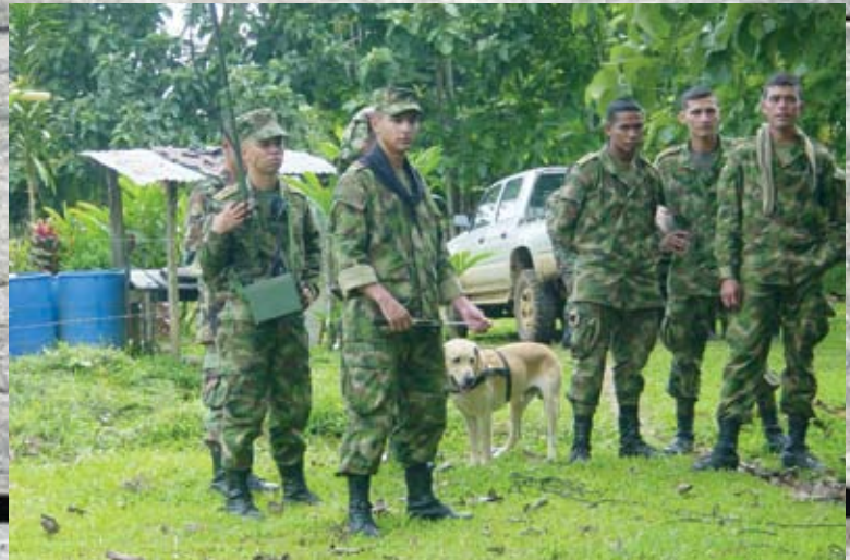
Colombian soldiers listen to a CERTE instructor prior to conducting IED detection training. This CERTE instructor has over ten years of combat engineer experience against the FARC.