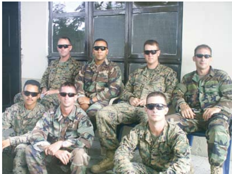
Members of ODA 753 Team 3 with FMTU-5 Marines in Larandia.