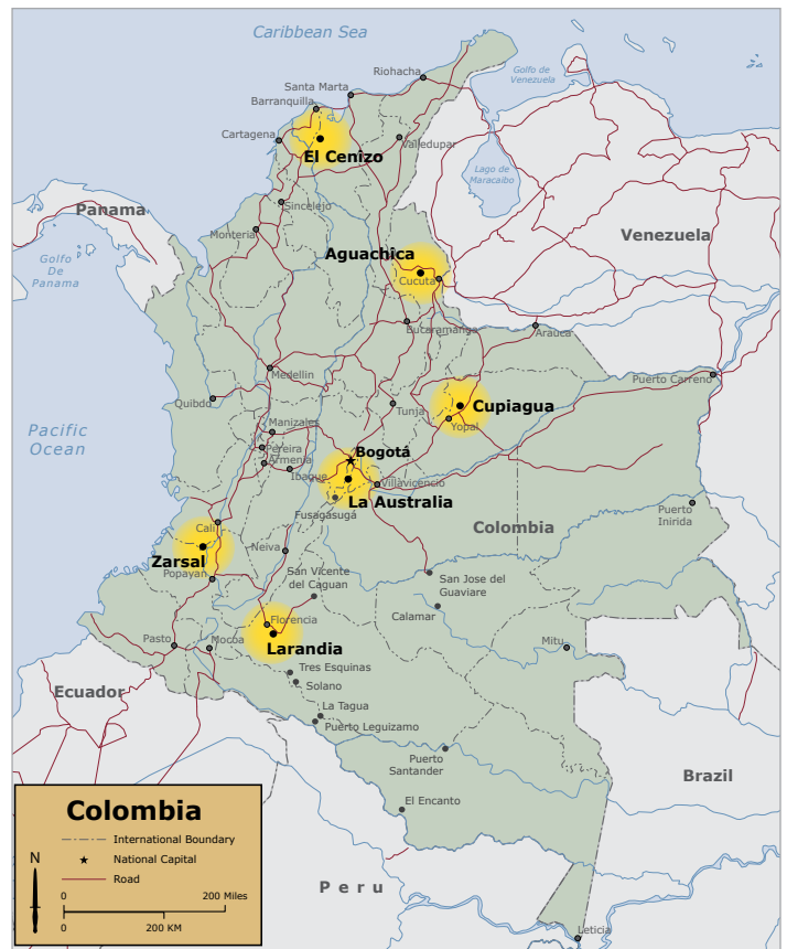
The reinforced ODA 753 would accomplish its mission at the six different sites shown above.

MSG 18Z Team SGT SSG 18D Medic SSG 18E Commo