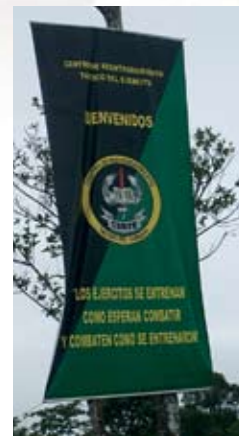
The Colombian Centro de Re-entrenamiento Táctico Del Ejército (CERTE—Army Tactical Retraining Center) is responsible for sustainment training of the Colombian Army.