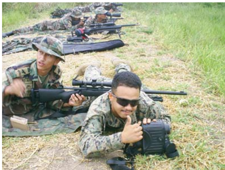
A member of FMTU-5 indicates that the Colombian Special Forces sniper is doing well.

In Larandia, the team of eighteen CERTE instructors and the Special Forces advisors prepared to retrain of one of the counter-guerrilla battalions. Each Colombian Division contains a mix of infantry and counter-guerrilla battalions. A Colombian line infantry battalion is comparable in size to a U.S. Army battalion with between 500 to 700 soldiers. These battalions are usually tied to a geographic location to provide area security.