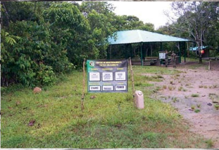
Entrance to one of the CERTE training sites. This training would compare to Common Task Training in the U.S. Army. The sign describes the task, condition, and standard for the training at that site.