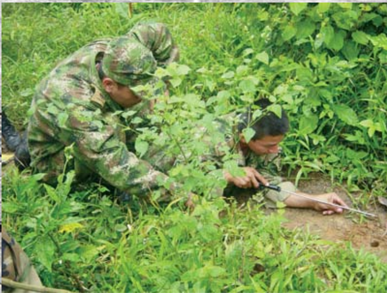
Once something suspicious has been found a soldier may use a probe to find the explosives.