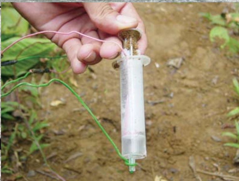
This "toe popper" IED uses a syringe to conduct the electric circuit.