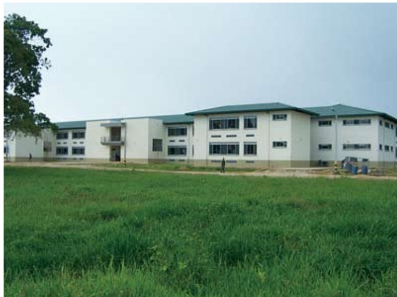
View of one of the new barracks built at Larandia using Plan Colombia funds.