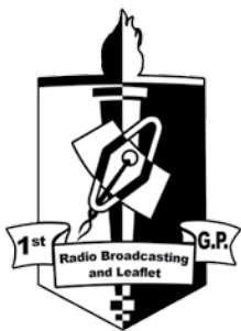
1st RB&L Group insignia

The small Psychological Warfare Branch (PWB) was energized and responded quickly with PSYWAR products. The U.S. Air Force was dropping leaflets over the battle area in Korea on 28 June 1950. These 12 million crude, hastily printed leaflets produced by Japanese printing firms, urged the Koreans to resist the Communists and said that help was on the way. Civilian radio