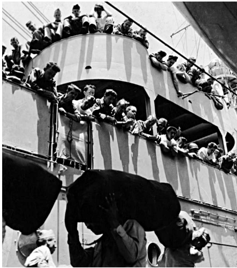
1,200 additional troops infantry replacements for Korea aboard the USS Brewster in Hawaii.

the problem. 48 The three-day train ride began on 12 July 1951.