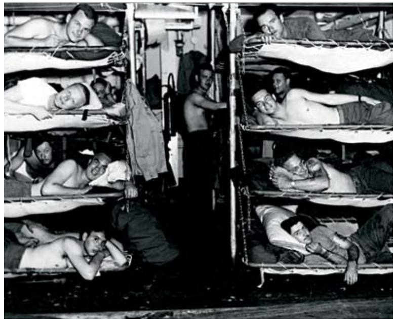
Troopship hold accommodations for the 1st RB&L soldiers during their trip to Japan.