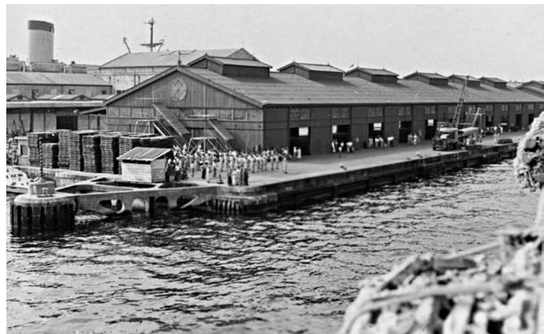
The USNS Brewster steaming into Yokohama harbor. The RB&L left the ship while the infantry replacements for Korea stayed aboard. A band on the dock greeted the newcomers to Japan.