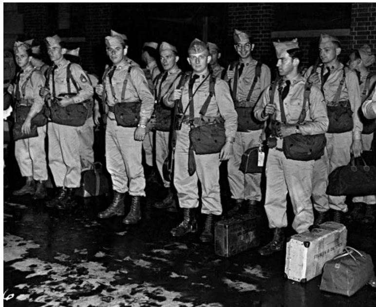
Troops line up ready for departure on 12 July 1951.

The majority of the unit was to depart Fort Riley by train for California. Kansas was hit by a five-day rainstorm on 11 July that caused massive flooding throughout the state. The Manhattan, Kansas, and the Fort Riley train stations were under two feet of flood water. A two and a half hour bus ride to Lincoln, Nebraska, solved