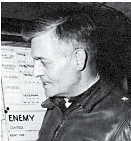
Major General Lucien K. Truscott's 3rd Infantry Division with the attached 3rd Ranger Battalion led the U.S. drive to capture Messina.