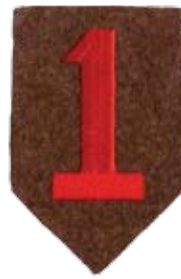
1st Infantry Division shoulder patch