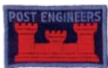
531st Engineer Shore Regiment shoulder patch