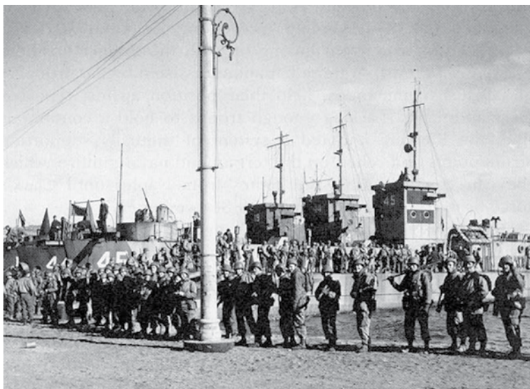
The Rangers of 3rd Battalion preparing to load landing craft for the amphibious landings in Sicily.