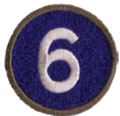
VI Corps shoulder patch