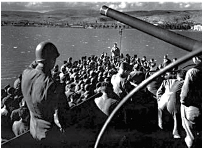
Lieutenant Colonel Darby (standing center back) addressing the Rangers at the beginning of the crossing to Sicily, 9 July 1943. The Rangers landed at Gela on 10 July 1943.

Once the men were selected, training began. The Ranger cadre began an arduous three-week training program preparing the new units for Operation HUSKY. This was a daunting task as the Rangers had less than six