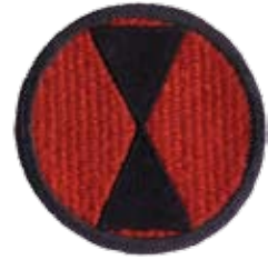
7th Infantry Division shoulder patch

weeks to prepare both the new units and soldiers for the invasion. 12 Forced marches, cliff climbing, weapons training, and amphibious operations formed the core of the Ranger training program. The plan for HUSKY called for the Rangers to land at two locations and secure key port facilities on the southwest side of the island.