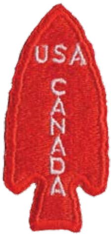
First Special Service Force shoulder patch

ers. They did not fire on the Germans and tried to radio Darby. They failed to make contact and continued to creep forward through some empty trenches until they reached a flat field on the southern edge of Cisterna.