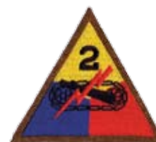
2nd Armored Division shoulder patch