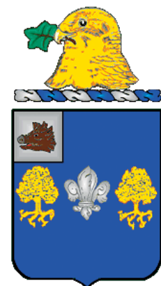
39th Infantry Regiment Distinctive Unit Insignia