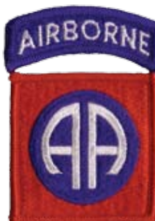
82nd Airborne Division shoulder patch