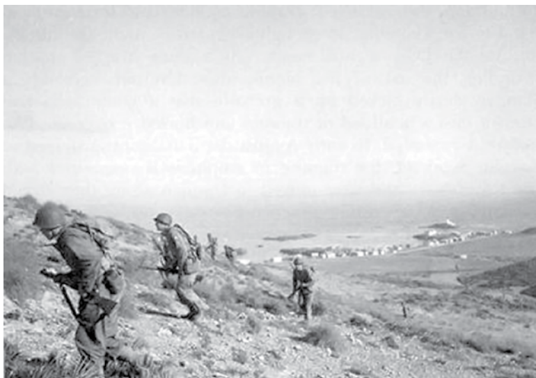
The Rangers trained near Arzew in Tunisia prior to the invasion of Sicily.

Using the veterans of the 1st Battalion as cadre, the 3rd and 4th Ranger Battalions were activated and trained by Darby at Nemours, Algeria, in April 1943. The 1st Battalion was reformed from A and B companies; the 3rd Battalion from C and D companies; and the