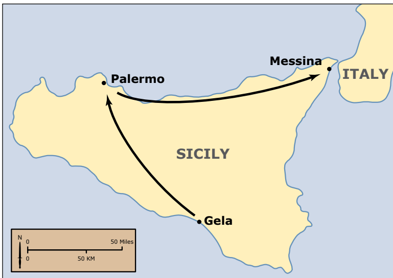
Ranger operations in Sicily followed a clockwise course around the island, from the Gela landings to Palermo and ending near Messina.

Because of the successes of the 1st Ranger Battalion in North Africa, LTC Darby was ordered to form two new Ranger battalions. 5 The Allied planners had asked Darby for a recommendation on the number of Ranger battalions he thought would be needed to support Lieutenant General (LTG) George S. Patton's Western Task Force in the assault on Palermo, Sicily. Darby's estimate of fifteen battalions was deemed too high and he was told to stand up three battalions. 6 Darby, his officers, and non-commissioned officers traveled throughout North Africa giving speeches to soldiers,