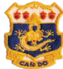
15th Infantry Regiment Dis- tinctive Unit Insignia