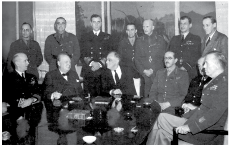
British Prime Minister Winston Churchill and U.S. President Franklin Delano Roosevelt with the Combined Chiefs of Staff at the Casablanca Conference. The meeting resulted in the decision to invade Sicily and Italy.

The success of the Allied forces in defeating the Germans and Italians in North Africa led to a decision to invade the continent of Europe through the Italian peninsula. At the Casablanca Conference in January 1943, U.S. President Franklin Roosevelt, British Prime Minister Winston Churchill, and the Allied Combined Chiefs of Staff worked out a strategic plan for the conduct of the war against Germany that included Operation HUSKY, the Allied invasion of Sicily. 3 The long-term strategy for the conduct of the war was often a contentious issue between the Allies. Operation HUSKY was developed as a compromise between the American desire for a major offensive across the English Channel into France and the British position that favored continued operations in the Mediterranean—which could be expanded to encompass Turkey and the Balkans—as well as the need to open a second front to relieve the pressure on the Soviet Union. 4 The decision to launch HUSKY initiated the build-up of Allied forces in North Africa, a build-up that included the Rangers.