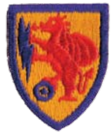
83rd Chemical Mortar Battalion shoulder patch