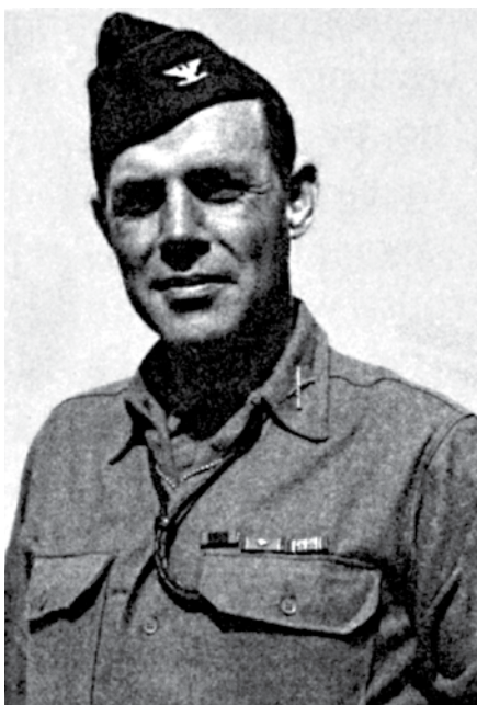
William O. Darby organized and led the Rangers in North Africa and Italy. This picture is taken following his promotion to Colonel.