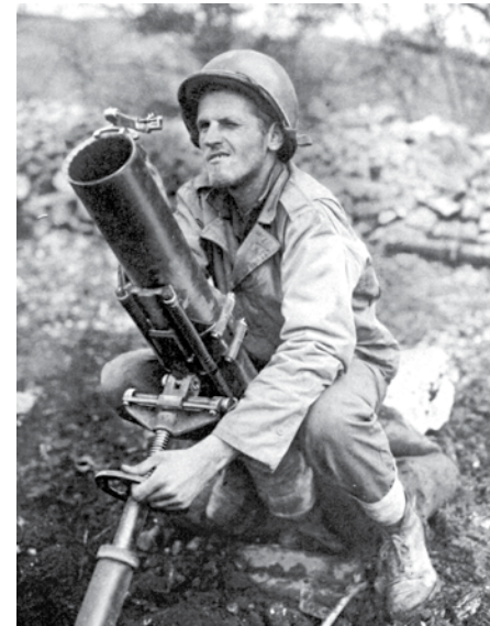
The 4.2-inch Chemical Mortar (Four-Deuce) fired high explosive and white phosphorus rounds. The 4.2-inch mortars of the 83rd Chemical Mortar Battalion provided fire support to the Rangers throughout the campaign in Italy.