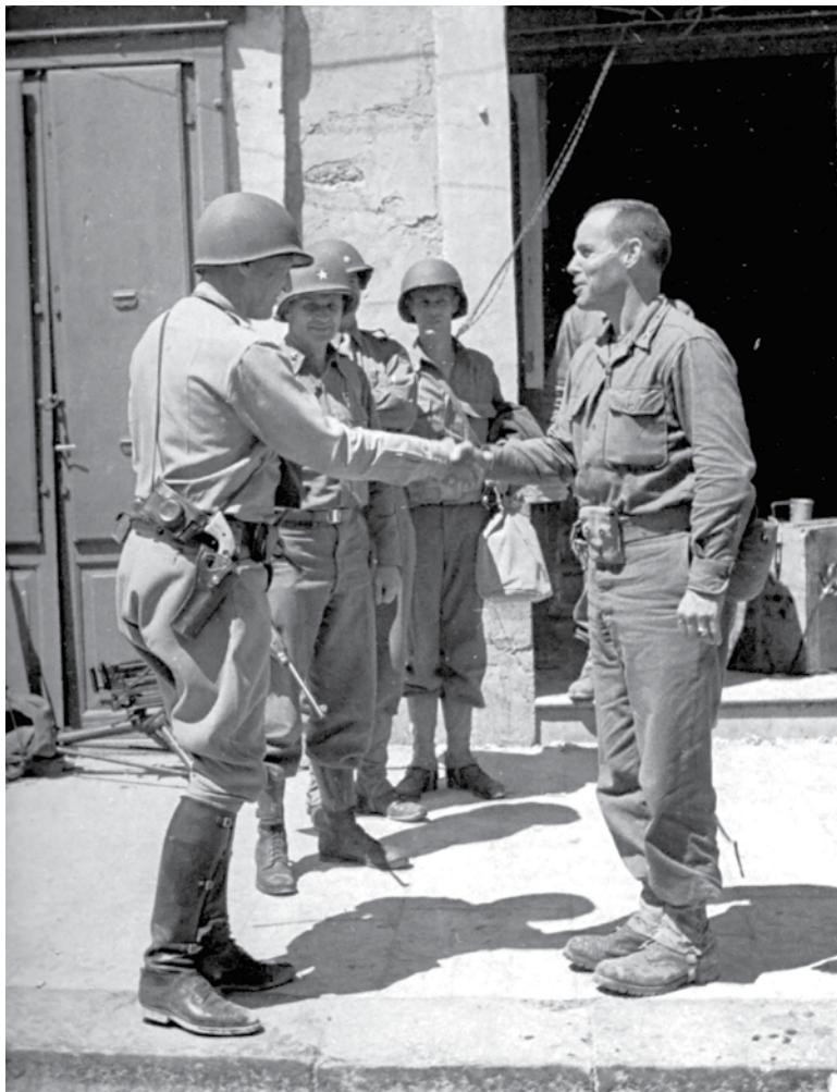
Lieutenant General George S. Patton, Commander of Seventh Army, greets Lieutenant Colonel Darby after the landing at Gela, Sicily. Darby's Rangers led the American amphibious assault.