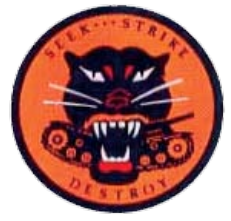
601st Tank Destroyer Battalion shoulder patch

ers to Cisterna. If the enemy interfered with the 1st Battalion, the 3rd Rangers were to engage them, thus freeing the 1st Rangers to continue their attack on Cisterna. The 3rd Battalion would assist in the capture of Cisterna and, if necessary, occupy the ground immediately northeast of town, and then prepare to repel enemy counterattacks. At daylight, it was to send a patrol to the northeast to contact the 15th Infantry Regiment whose attack took them west of the town.