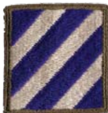
3rd Infantry Division shoulder patch