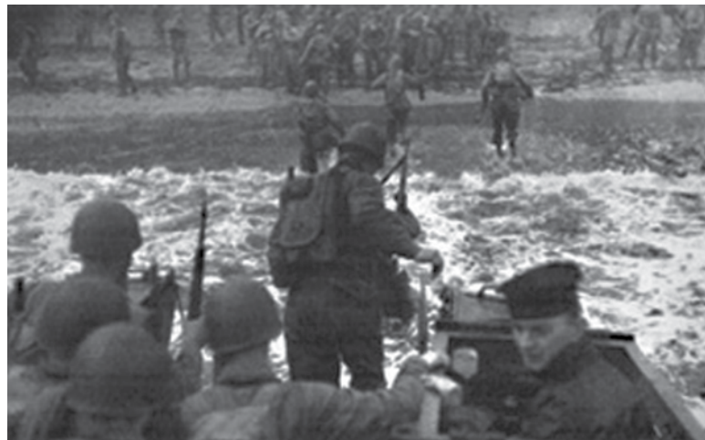
Rangers of the 3rd Battalion going ashore at Licata on 10 July 1943. The 3rd Battalion opened the way for the 7th Infantry Division landing.