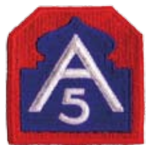
Fifth Army shoulder patch

The 1st and 3rd Ranger Battalions won the Distinguished Unit Citation for their success at Chiunzi Pass, but the recognition came at a high price. In the month of September, Darby’s Ranger Force lost twenty-eight killed, nine missing, and over sixty-six wounded—approximately 10 percent of the force. Most of the casual-