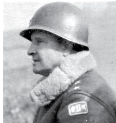
Major General Geoffrey Keyes commanded the Provisional Corps that captured the city of Palermo. The Provisional Corps was composed of the 82nd Airborne Division, the 2nd Armored Division, and the Rangers.

At the Licata beachhead, the 3rd Battalion, attached to the 7th Infantry Division, landed on schedule and quickly seized the high ground around the landing beaches located three miles west of the town. Once the infantry regiments passed through them, the Rangers reorganized and moved to capture Castel San Angelo, a prominent villa overlooking the city of Licata from the west. The Allied naval bombardment of the city prevented the Rangers from entering Licata, and they remained at Castel San Angelo until the town was secured by follow-on units. In the ensuing days, the 3rd Battalion screened ahead of the 7th Division on the drive westward and played an instrumental role in the capture of the towns of Montepuerto and Porto Empedocles as the