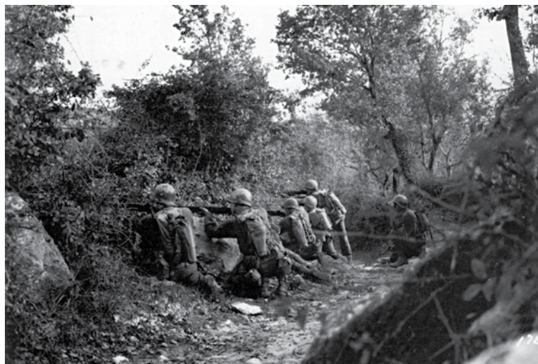
Rangers of D Company, 3rd Battalion, in combat near Santa Maria, Italy, November 1943. The bitter combat in the Italian mountains took a heavy toll on the Rangers.

The mission was a classic Ranger operation: seize the port facilities, destroy gun