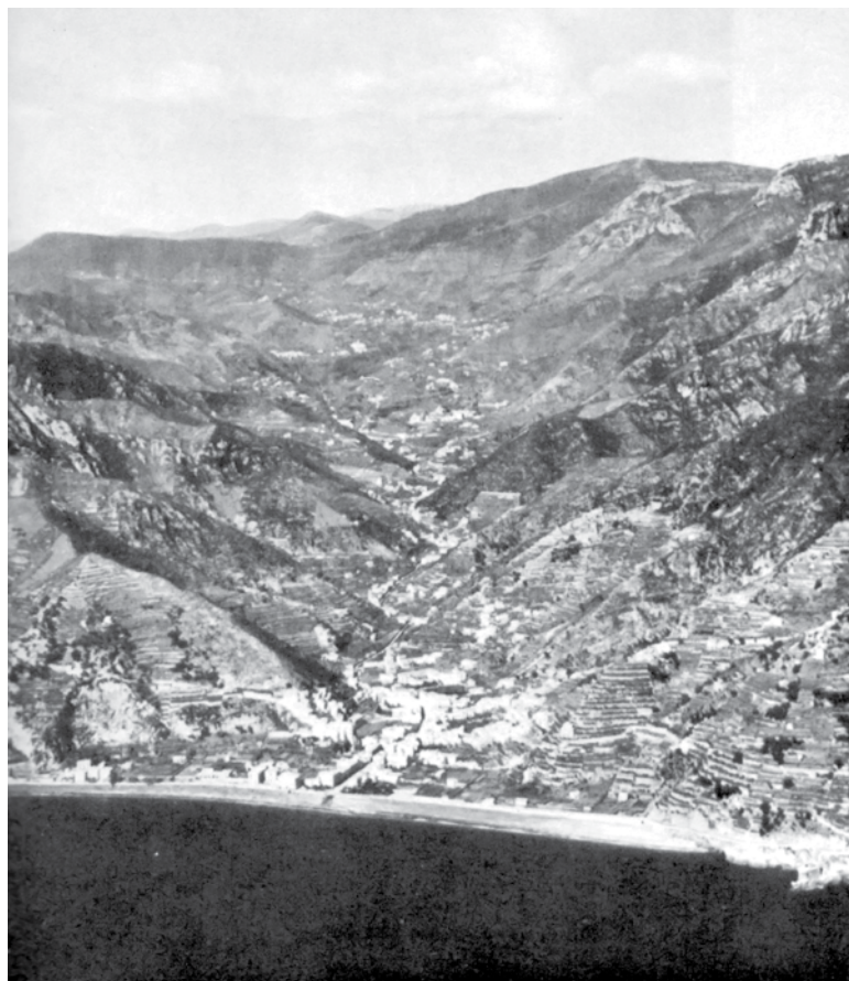
Maiori beach and the rugged terrain above the town. The Rangers landed at Maiori and quickly moved to secure the Chiunzi Pass above the town.

Operation AVALANCHE was the codename for the Allied landing near Salerno. The mission was to secure a beachhead in the vicinity of Naples, the second largest city and largest port in Italy. The capture of Naples would force the evacuation of the German forces in the south, secure the port and possibly precipitate Italy’s exit from the war. Heading into the landing, the Allies were elated to learn that Italy had surrendered on 8 September 1943. The Germans reacted quickly to disarm the Ital-