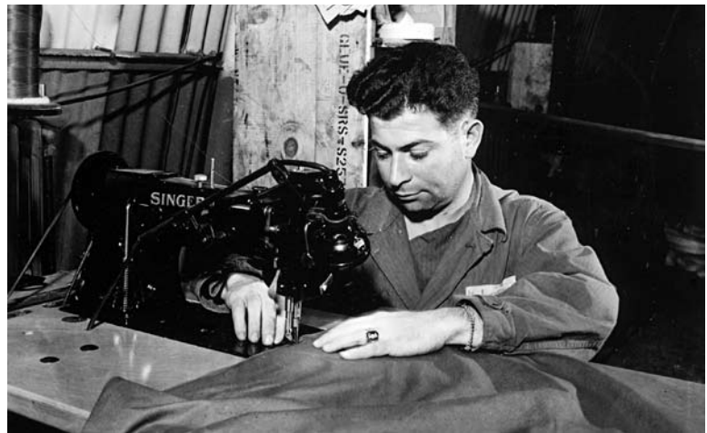
The riggers at Area H could be called upon to repair parachutes, make harnesses, or to construct diplomatic mailbags that were used to smuggle supplies to neutral Sweden for the Norwegian government in exile.

After September 1944, the pace at Area H slowed. France, the primary country for aerial resupply operations, no longer needed a specialized air resupply. The Carpetbaggers converted their B-24s to fly fuel directly to Lieutenant General George S. Patton's Third Army, which had outrun its logistic tail. The Carpetbaggers delivered 822,791 gallons of gasoline in a month. Although there was still a need for the Carpetbaggers, it was considerably reduced. By the end of the war in Europe, the 801st/492