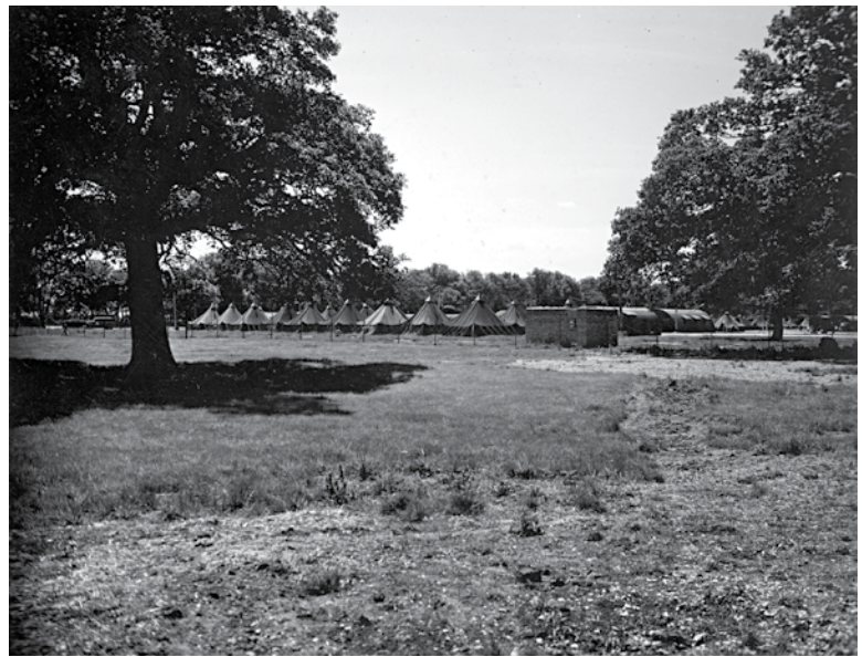
The Area H enlisted quarters which housed 323 men. The tents were erected over concrete slabs.

Isolated buildings for ammunition and explosives, such as incendiary devices, were erected away from the main camp. That area had four Nissen huts and five brick buildings. Each was revetted with brick walls to contain accidental explosions. 17 Another Nissen and four Romney huts housed the packing operations. 18 A new brick storage shed served to protect the packed containers. Area H could store 500 tons of material. The SOE base at St. Neots could handle an additional 300 tons. Security for Area H was heavy. High woven-wire fences topped