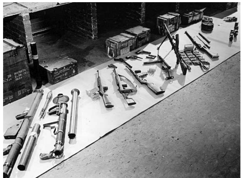
A selection of arms that were dropped into German-occupied Europe. From left to right: bazooka (assembled and disassembled), M-1 carbine, M-1 carbine with folding stock, a United Defense model 42 submachinegun, a British Sten submachinegun, a British Bren light machinegun, and a British Enfield rifle.

The Carpetbaggers pioneered low-level night flying in the USAAF. All missions were conducted only during the full moon period, when the extra light could assist the pilot’s vision. European based-USAAF bombing squadrons clung to the doctrine of daylight “precision” bombing. 26 The Carpetbaggers stayed below 2,000 feet to avoid German radar and anti-aircraft defenses as well as to make more precise airdrops. 27 Once over a target, the Carpetbagger plane communicated with the ground contacts using a device called an “S” phone, a short-range ground-to-air radio, which allowed greater accuracy in drops. If the reception committee did not have an “S” phone, they communicated using flashlights or