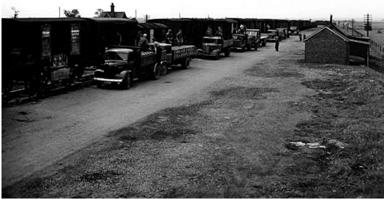
Personnel at Area H unload supplies from the local rail station. These supplies would then be packed and dropped into occupied Europe.

and through September 1944, carried seventy-six agents into occupied Europe, and exfiltrated 213. 31