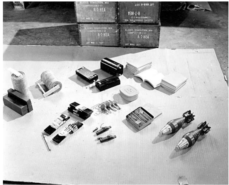
Here is a selection of OSS “gadgets” dropped into occupied Europe. Among those pictured are a “pocket incendiary,” “fog signal,” “clam,” firing devices, and timing pencils. Such items were used for demolitions.

and they were painted all black. The removal of the belly ball turret created a “joe hole” for parachuting agents. 25