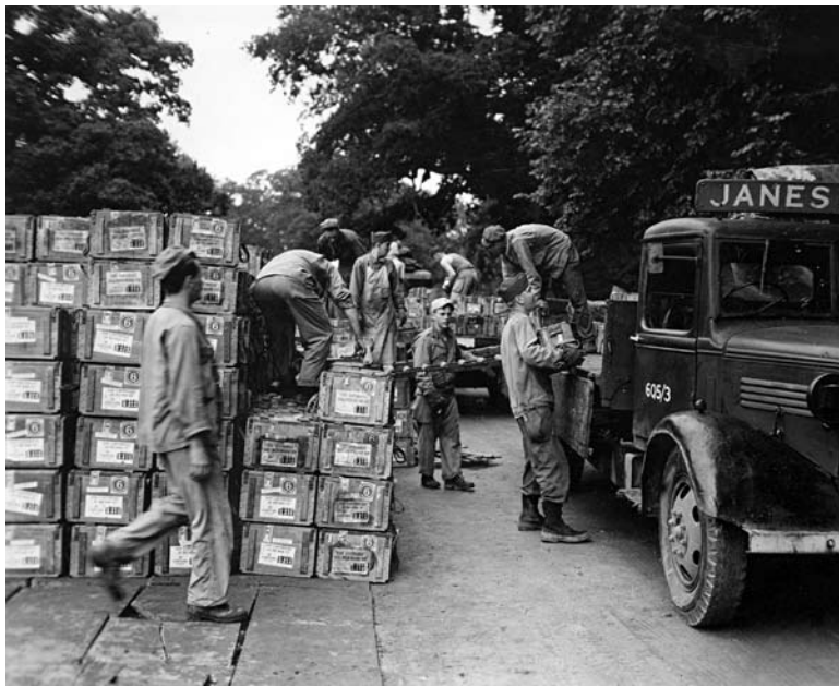
Unpacking ammunition at Area H. Notice the business sign still on the requisitioned civilian truck.