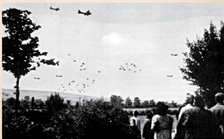
French civilians observe USAAF B-17s dropping supplies on 14 July 1944 (Bastille Day) during Operation CADILLAC.