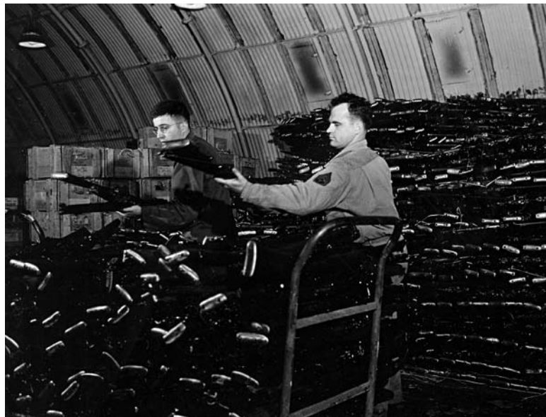
Stacks of British Enfield rifles await packing into containers.