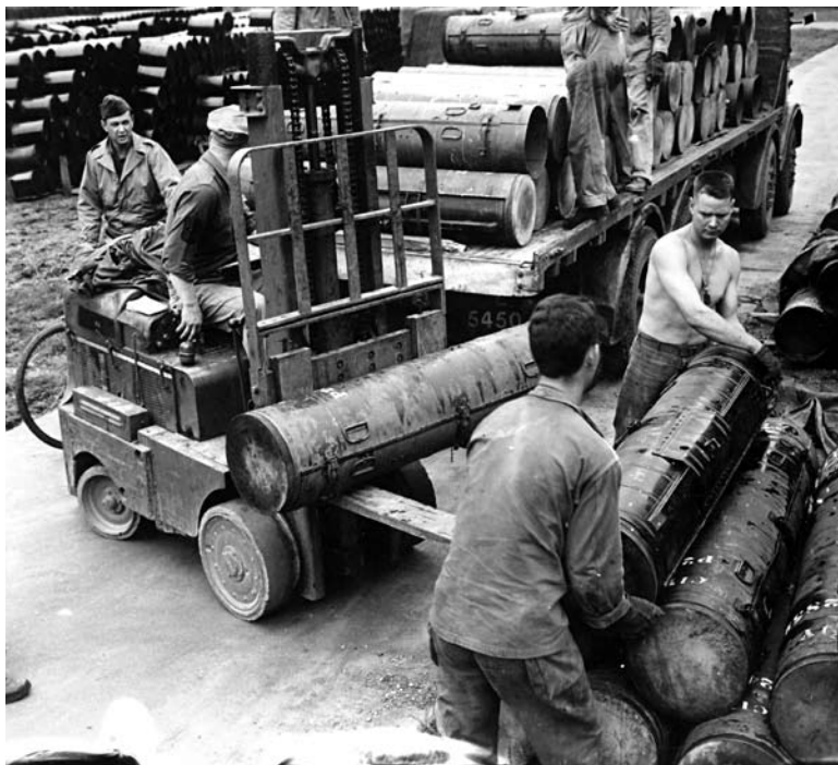
Packed containers are loaded for shipment to a local airfield. Sergeant James Gearing, on the bicycle behind the forklift, is supervising.

learning curve for the Carpetbaggers. Only twenty-eight of seventy-six operational sorties were successful. 29 “Success” was defined as containers dropped and the plane returned. The crew never knew if they dropped supplies to a German-controlled group, or if the supplies were undamaged. By March, the ratio had improved with forty-four of seventy-two sorties successful. During the first three months of 1944, 6 agents, 799 containers, and 265 packages—with more than a million rounds of small arm ammunition—were dropped, with a loss of three aircraft. 30 In July 1944, the Carpetbaggers were assigned the mission of bringing personnel back from occupied Europe. A few C-47s were attached to the Carpetbaggers,