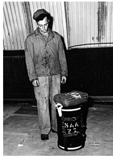
A completed "package" is ready for dropping.

Often, drops to multiple groups required similar items. This led to the development of a series of standard loads. It also provided a more accurate estimate of the total weight of a load going into a drop aircraft. For instance, one of the standard loads for an "H" container was 5 Sten guns with 15 magazines, 1500 rounds of 9mm ammunition, 5 pistols with 250 rounds of ammunition, 52 grenades, and 18 pounds of explosives. The weight of this container was 281 pounds. The contents of each container were distributed and packed into each cell to bal-