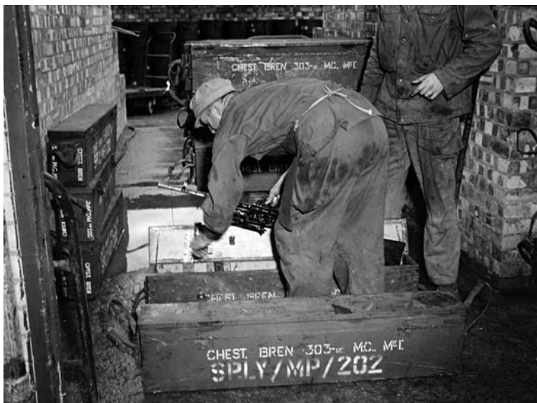
British Bren light machineguns are unpacked from their transit cases prior to being packed into drop canisters.