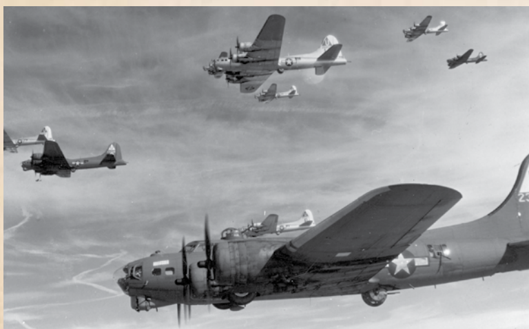
B-17s of the USAAF 8th Air Force over England in 1944.