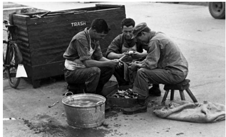
. . . or on KP!