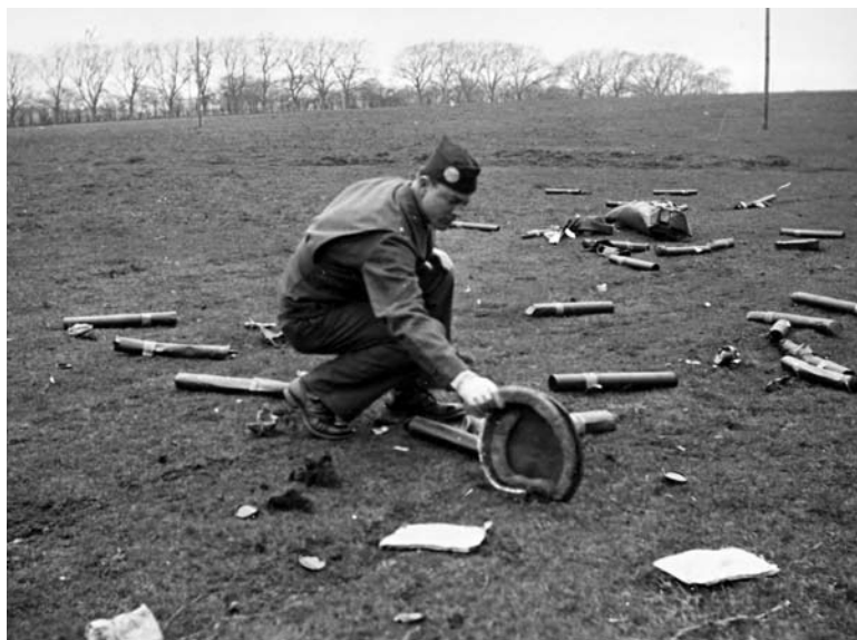
According to the original caption written on the back of this photo, not one of the Bazooka rounds exploded during this free-drop test.

Carpetbagger or RAF crews supervised the loading and dropping of supplies, as well as any agents being infiltrated into the occupied territories. The Carpetbaggers used specially modified B-24 Liberators. These planes had radar, flash suppressors mounted on their machineguns in the top and rear turrets, static-line cables, British container release equipment replaced the bomb racks,