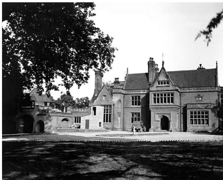
Holmewood House, Holme, UK, served as the officer's quarters and planning facility for Area H.

Construction on the OSS facilities, named Area H,