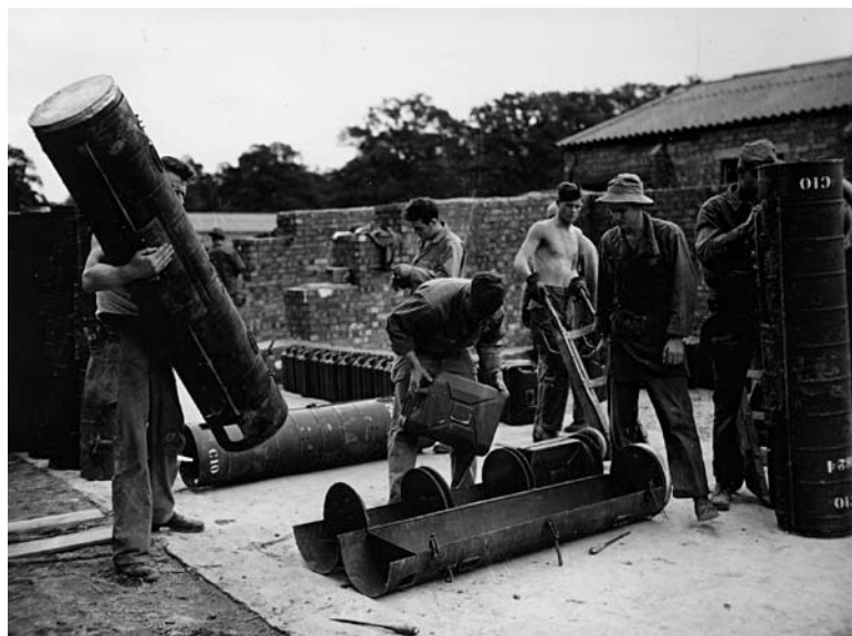
Gasoline being packed in type "C" containers. Notice the brick revetting walls.