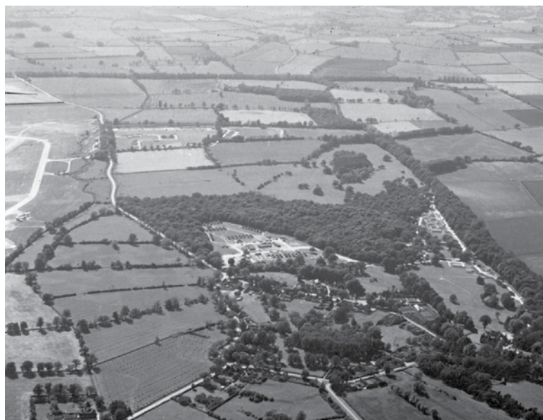
Area H at Holmewood, UK, as seen from the air.