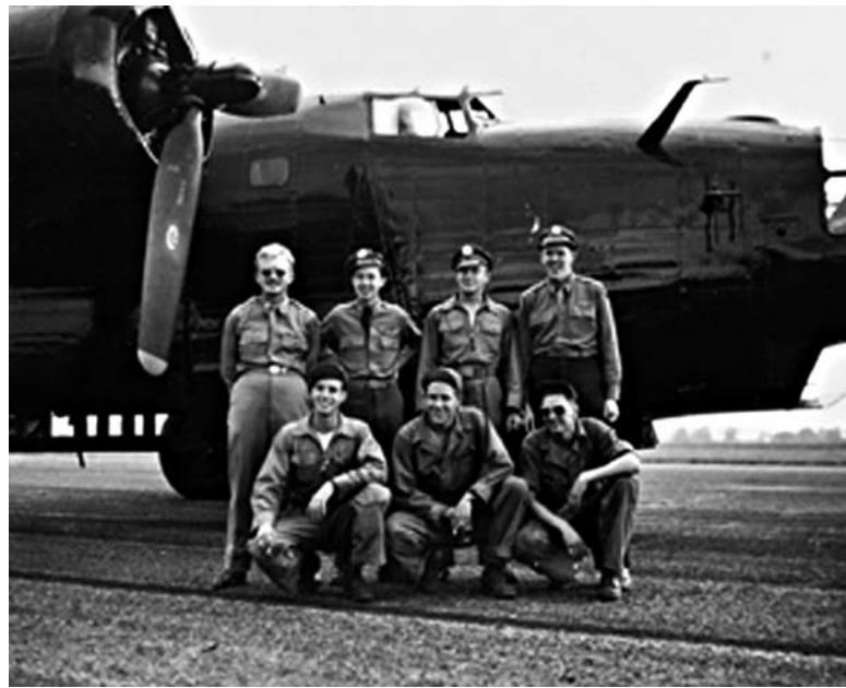
A Carpetbagger crew outside their B-24 Liberator that has been modified for night dropping operations. Notice the lack of a front turret, which was removed on Carpetbagger B-24s, and that the aircraft is painted all black.

USAAF began dropping supplies into occupied Europe in January 1944. These initial drops started an ever-increasing demand on Area H. 28 Operations conducted in January and February 1944 presented a steep