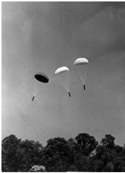
A test drop at Area H.

anced the load and improve the chances of an easy landing. 22 The same was true for a “C” container. In one standard load, a “C” could hold two British Bren light machineguns complete with 16 magazines and 2000 rounds of .303 ammunition, weighing 303 pounds. 23 To verify their packing techniques, the personnel at Area H conducted drop tests—including free drops of items—to see if their containers, packages, or even bazooka rounds, survived intact.