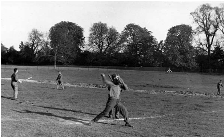
Like soldiers everywhere, the OSS personnel at Area H spent their free time relaxing . . .

The OSS logistics effort at Area H was an unqualified success. During 1944, Area H packed 50,162 containers