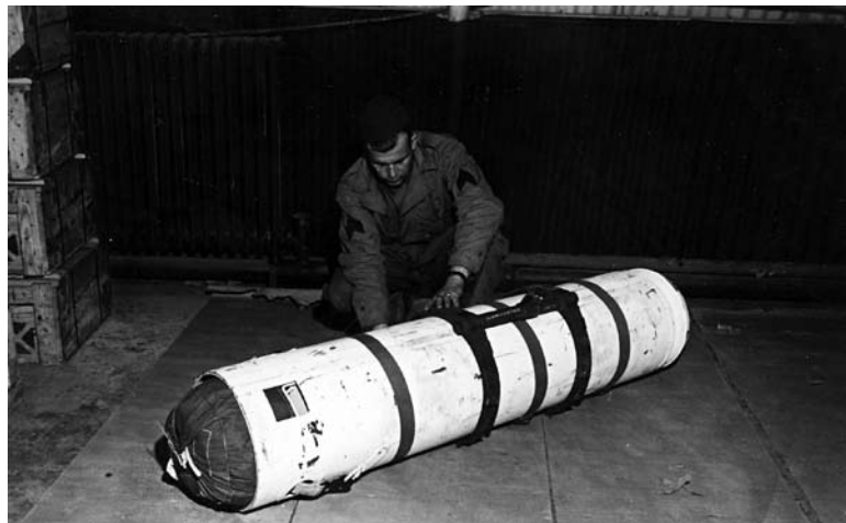
White canisters were used for air-drop operations in Scandinavia.

for air delivery by the RAF and the USAAF. 37 In the first nine-months of 1944, this included more than 75,000 small arms and 35,000 grenades. Area H provided 96 tons of supplies to Belgium, 9 to Denmark, 3,055 to France, 119 to Poland, and 56 to Norway. 38 Operations in 1945 in Denmark and Norway raised the total tonnage supplied. Supplying the resistance forces, as well as the SOE and OSS teams in occupied Europe, did not come without cost. Twenty-one Carpetbagger aircraft and most of their crews were lost in action.