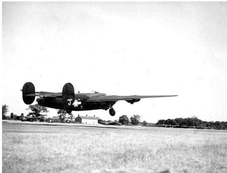
A modified B-24 Liberator of the 492/801st Bomb Group, or "Carpetbaggers" takes off from RAF Harrington in 1944.

Army Air Force (USAAF). 5 Five months later, after considerable pressure from the OSS Director, Major General William Donovan, SO received its sixteen-plane squadron with the promise of another by the end of the year. 6