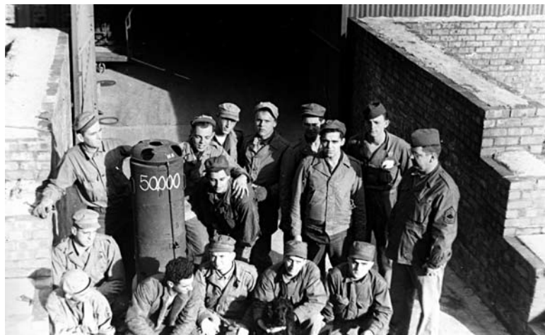
Area H personnel pose with the 50,000th canister packed.

Although the logistics division gets little credit for the success of OSS operations, the staff at Area H played a vital role in the liberation of France. Major General William J. Donovan, Director of the OSS, commended the Area H personnel, "I personally wish to commend each of you for the superior manner in which you have performed your duties. Unquestionably, the work of the packing station constitutes a vital link in the difficult job of supplying the Resistance groups and has contributed materially to the effectiveness of these Groups against the common enemy." 39 By the outstanding manner in which they performed their mission, the logistics personnel at Area H, and the aircrews that delivered the supplies and agents behind German lines, directly contributed to the success of the OSS in occupied Europe. ♣