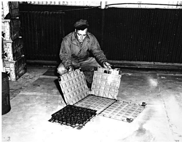
This spring "mattress" acted as a shock absorber for non-standard packages.

could withstand the opening shock of the parachute as well as the landing. These were referred to simply as "packages."