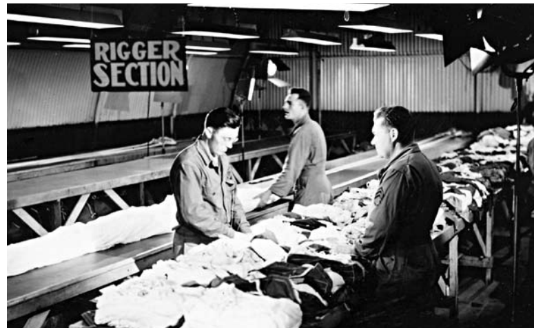
Men of the Rigger Section pack parachutes. Notice the bright lighting which helped to ensure that the parachutes were packed correctly.