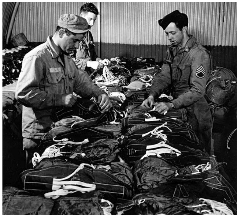
Riggers are stowing the static lines on parachutes that will be attached to canister containers.