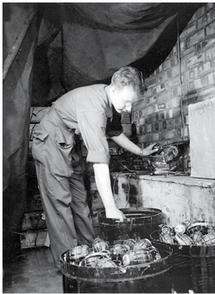
Piles of grenades being packed.

was started in January 1944 and completed two months later. Area H became the largest SO supply facility in the European Theater. 15 By then, Area H could accommodate 18 officers and 326 enlisted men. 16 Although electricity and water came from offsite, heating came from a newly constructed power house. Sheet metal buildings housed the dispensary, administrative and maintenance sections, as well as the motor pool.