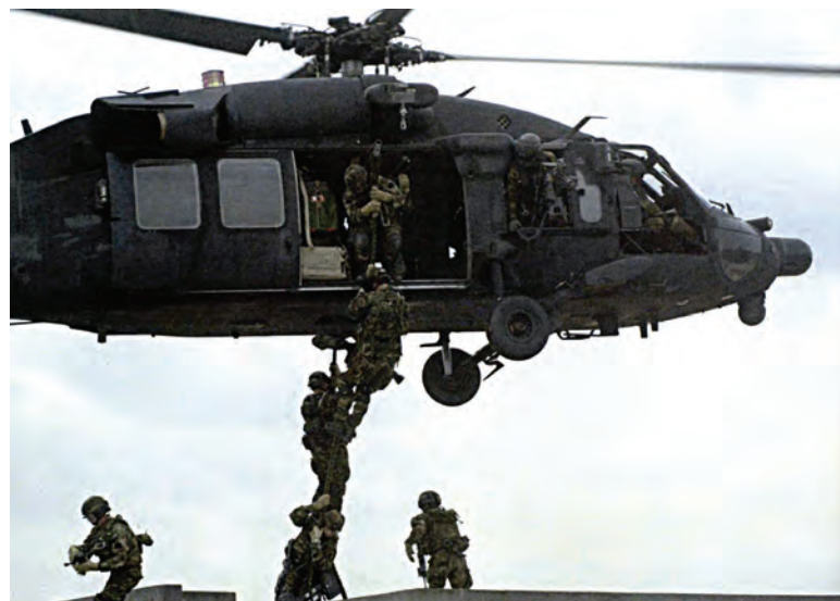
Army SOF soldiers fast-roping out of a 160th SOAR MH-60L Black Hawk helicopter.

TF Ranger was composed of 440 U.S. Special Operations Command personnel from the 3rd Battalion, 75th Ranger Regiment, Fort Benning, Georgia; the 1st Battalion, 160th Special Operations Aviation Regiment, Fort