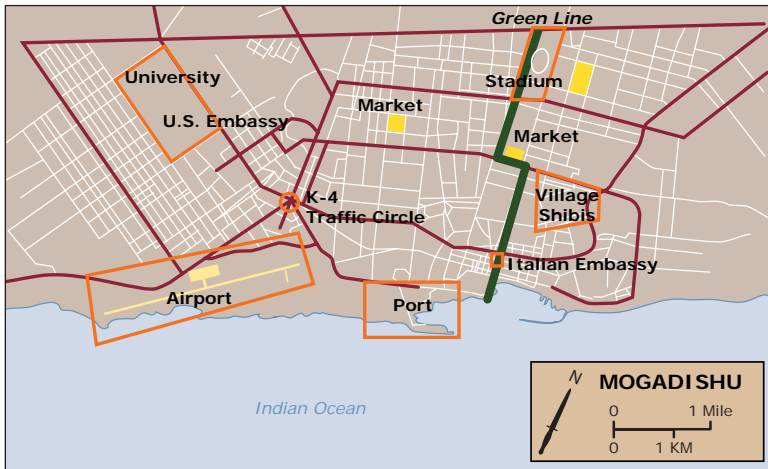
Map of Mogadishu showing the division of the city after the cease fire.

lomatic and UN personnel were evacuated by U.S. Navy helicopters (USCENTCOM Operation EASTERN EXIT).