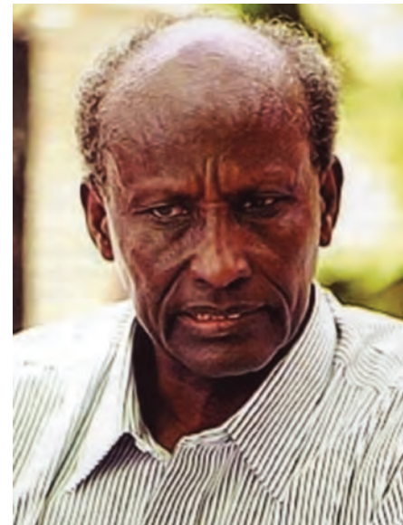
General Mohammed Farah Aideed

Fighting between Aideed's and Ali Mahdi's factions divided Mogadishu into two armed camps. By the time Mahdi controlled northern Mogadishu and Aideed controlled southern Mogadishu, 14,000 had been killed and 40,000 wounded. North and south Mogadishu was divided by the "Green Line" which followed Via Hiram north, then east on the Sinai Road, and north again along Via Mohammed Harbi. While the fight to control Mogadishu raged in 1991, the Somali National Movement established a separate government in northern Somalia, named Somaliland (the old British Somalia) and independent from Somalia. By then, internal law and order in Mogadishu had disintegrated to a point that U.S. dip-