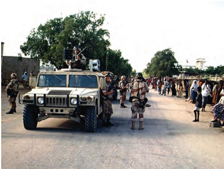
9th PSYOP Battalion HMMWV mounted with loudspeakers escorted by 10th Mountain troops broadcasting in Kismayo.

CMOC became the focal point for all Somali humanitarian relief operations and the direct liaison to the JTF headquarters. 12 To provide CA assistance to coalition and U.S. military units and NGOs in the countryside, Company C, 96th CA Battalion sent six Direct Support Teams of four men each to various locations in Somalia.