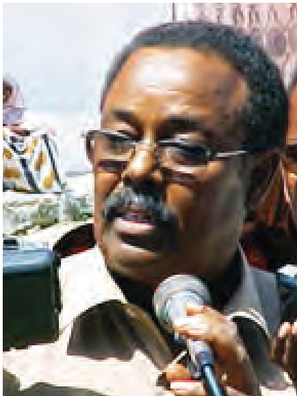
Ali Mahdi Mohammed

In May 1977, the United States offered aid on the condition that Barre terminate his relationship with the Soviets. 3 This offer was an initiative of President Jimmy Carter. 4 General Barre took advantage of the offer by sending Somali army troops to assist the Western Somali Liberation Front forces fighting the Ethiopian Army in the Ogaden Plateau region. That prompted the United States, Great Britain, and France to abandon plans to supply arms to Somalia. Saudi Arabia and Iran agreed not to transfer U.S. arms and ammunition to Somalia. 5