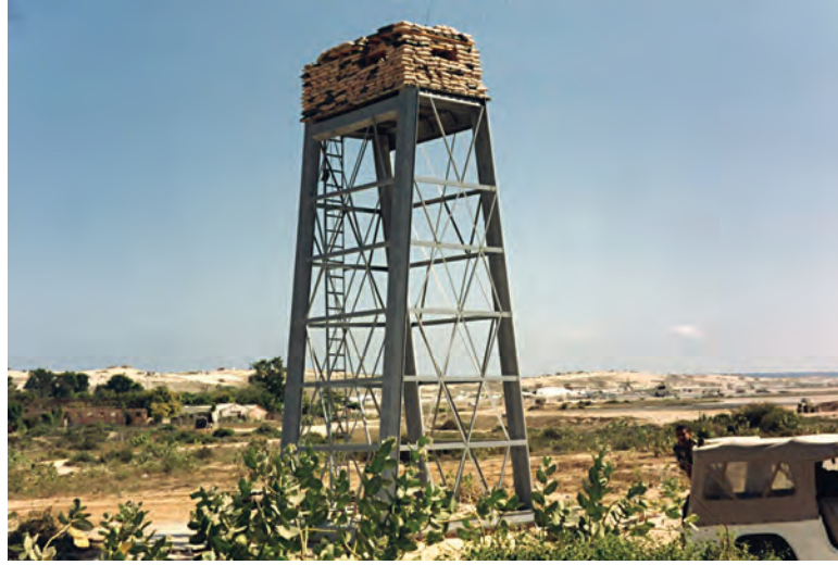
An observation position in the vicinity of Mogadishu airport.

After the TF Ranger debacle, the U.S. government’s resolve to “fix” Somalia’s problems began to waver, as did that of the other countries providing military forces to the UN. Coalition forces began planning to withdraw. The 5th SFG was the only U.S. force continuously