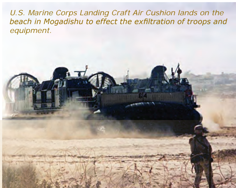
U.S. Marine Corps Landing Craft Air Cushion lands on the beach in Mogadishu to effect the exfiltration of troops and equipment.