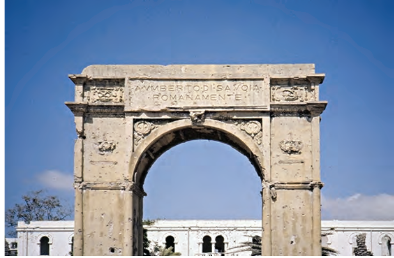
Italian arch from Somalia's colonial period.

rest of the country rely on wells for water. Indiscriminate and unregulated dumping of toxic waste, improper human waste disposal, and constant blowing dust have contaminated most ground-water sources. To survive, the Somalis have resorted to drinking this water and, consequently, are plagued with Hepatitis A, Typhoid Fever and Hepatitis E, all infectious water-borne diseases. Major countrywide droughts occur every two to five years and threaten human and animal survival. Unfortunately, regional warlords controlled the water and other scarce resources, thereby maintaining power.