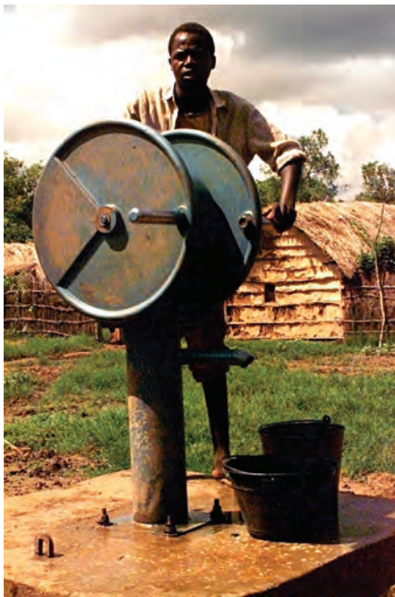
Somali village well and pump.

in 1992 was estimated at 6.5 million people. The vast majority of people have descended from the Eastern Hamitic people of the Samaal ethnic group. Somalis have a common race, religion, language, dress, and culture, and share historical traditions. Nearly all are Muslims who trace their ancestry to Abu Talib, an uncle of the prophet Mohammed who established the Sunni Sect of Shafi'i. Somali society is dominated by five clan families: Darood, Hawiye, Issaq, Dir, and Digil-Mirifleh. 1 These clans provide societal structure and family connectivity, but contribute to national fragmentation. Somalis will not voluntarily separate themselves from family, lineage, or clan affiliation, so there is little hope for a unified country. 2