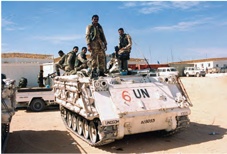
Pakistani M-113A2 armed personnel carriers at the U.S. Embassy Compound October 1993.

barrelled mini-gun. The MH-6 “Little Bird” lift helicopter had external benches to carry six combat assault personnel. The MH-60L Black Hawk was crewed by a pilot, copilot, and two crew chiefs and was capable of transporting as many as eighteen assault troops. The Black Hawk standard armament was 7.62mm mini-guns operated by the crew-chiefs. When specifically configured as a Defensive Armed Penetrator, the MH-60L could carry seven-shot 2.75-inch rocket pods and/or wing-mounted 30mm M-230 chain guns.