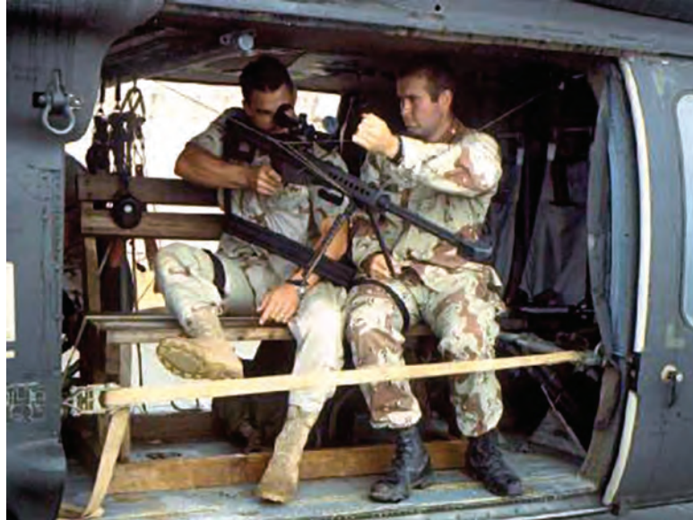
Special Forces sniper doing pre-mission preparation for "Eyes Over Mogadishu" mission.

On 4 May 1993, the UN assumed full control of mili-