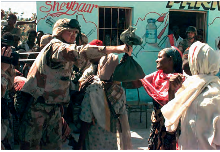
CA soldier distributing humanitarian relief supplies.