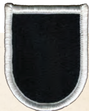
5th SFG beret flash

wanted PSYOP "up front" with the intention of preventing armed conflict. 11 A Joint PSYOP Task Force (JPOTF) of 125 personnel was formed by Lieutenant Colonel (LTC) Charles