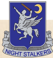
160th SOAR DUI