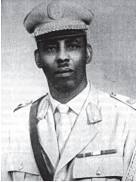
Major General Mohammed Siad Barre

ary Council (SRC) and Commander of the Somali Armed Forces, seized power by a coup d'état on 21 October 1969. Barre dissolved the National Assembly, suspended the democratic constitution, and established "scientific socialism" as the basis for government. MG Barre nationalized foreign businesses, outlawed all clan affiliations, and eliminated all political organizations except the SRC. These actions prompted the Soviets to increase their aid to Somalia. A twentyyear treaty of friendship and cooperation between Russia and Somalia was signed in 1974. Somalia became the most important Russian satellite in Sub-Saharan Africa.