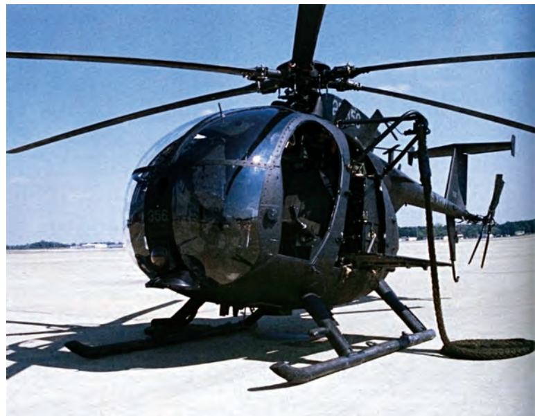
MH-6 "Little Bird" rigged for a fast-rope insertion.