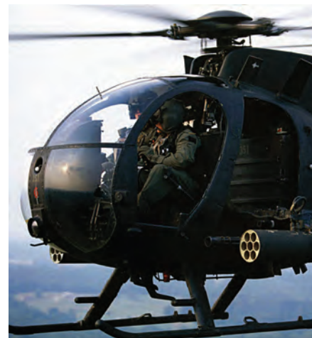
AH-6 "Little Bird" with rocket pods and miniguns.

Based on the mission, 1st Battalion, 160th SOAR, provided sixteen special operations helicopters, crews, and ground support personnel (four AH-6, four MH-6, and eight MH-60L Black Hawks). The AH-6 "Little Bird" attack helicopter was armed with a 2.75-inch, seven-shot rocket pod and a 7.62mm, six-