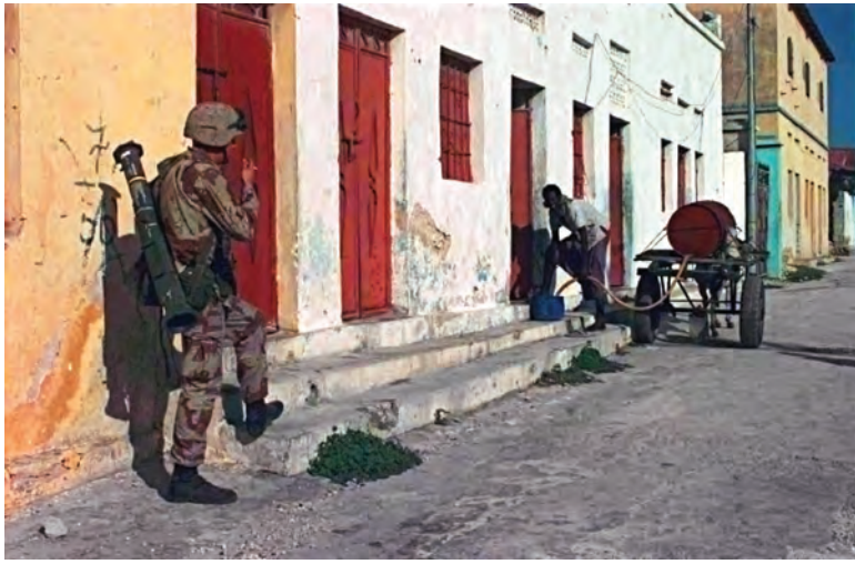
Somali city water delivery vehicle.