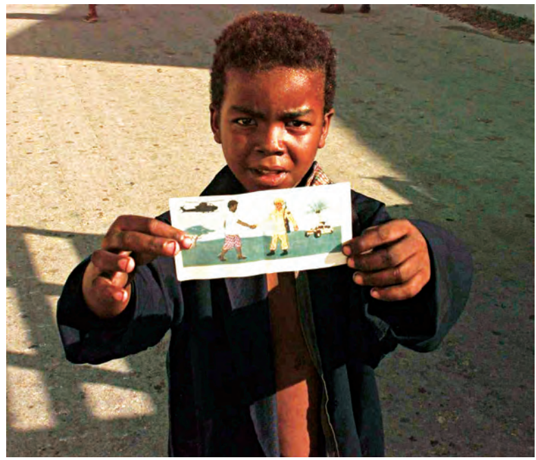
Somali boy holds leaflet from UNITAF PSYOP Campaign.