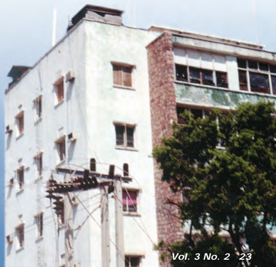
Special Forces sniper position K-7 in Mogadishu.