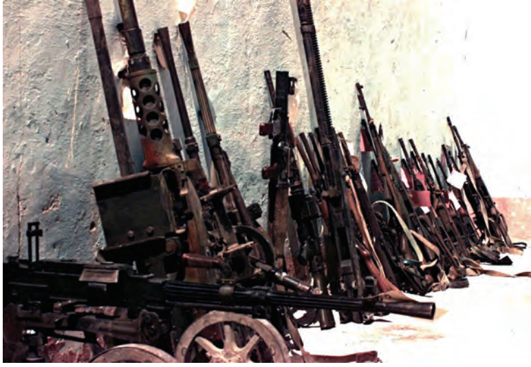
Variety of weapons taken at Checkpoint Condor south of Merca by the U.S. forces.

performed by an overly bureaucratic staff that possessed little in-country expertise and could not agree among its members. The absence of strong UN leadership fragmented the individual national relief efforts. There was no central direction. The only forces that provided any consistency during the entire Somali experience were U.S. Army Special Operations Forces. The ability of Special Forces, Civil Affairs, and Psychological Operations soldiers to operate independently and as members of a coalition force made them true force multipliers.