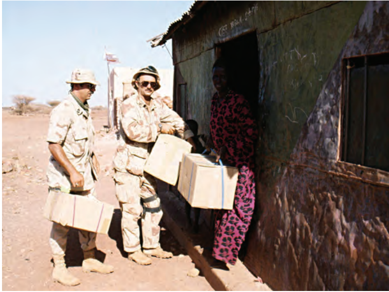
SF performing a Humanitarian Assistance delivery in Belet Weyne.