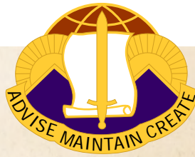
96th CAB DUI