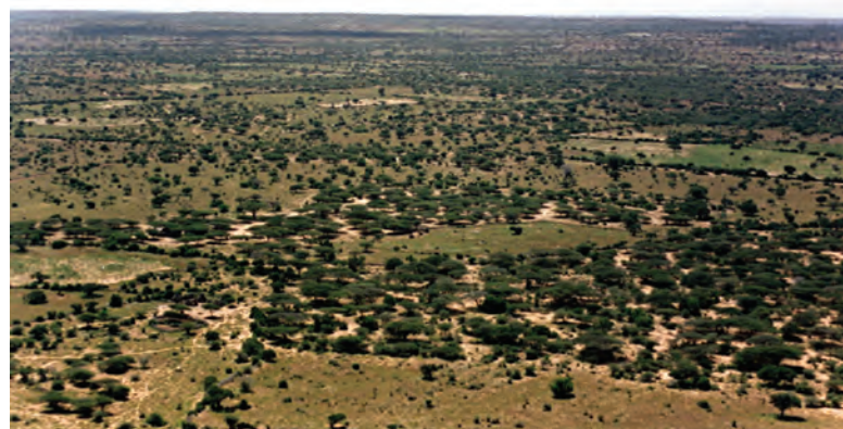
Somalia terrain west of Oddur.