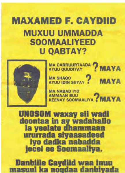
Aideed wanted poster in the Somali language.