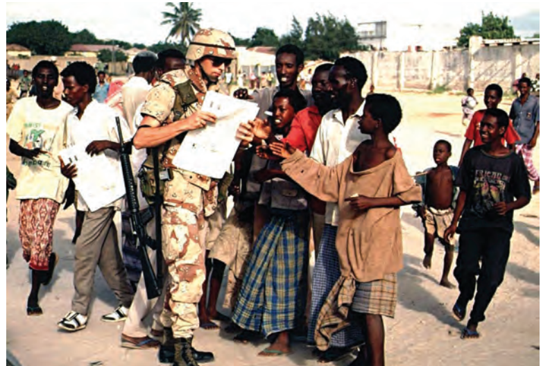
9th PSYOP Battalion soldier distributing RAJO newspaper in Kismayo.