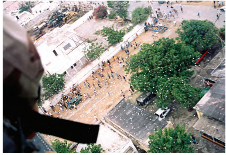
PSYOP leaflet drop.