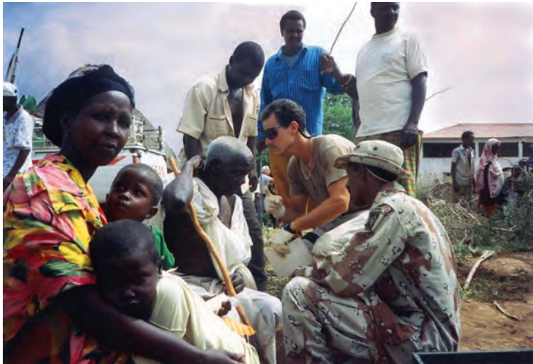
SF medic with MI interpreter during a MEDCAP.