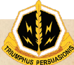
8th POB DUI