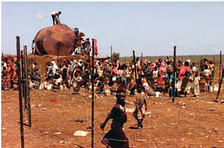
Somali village water tank.