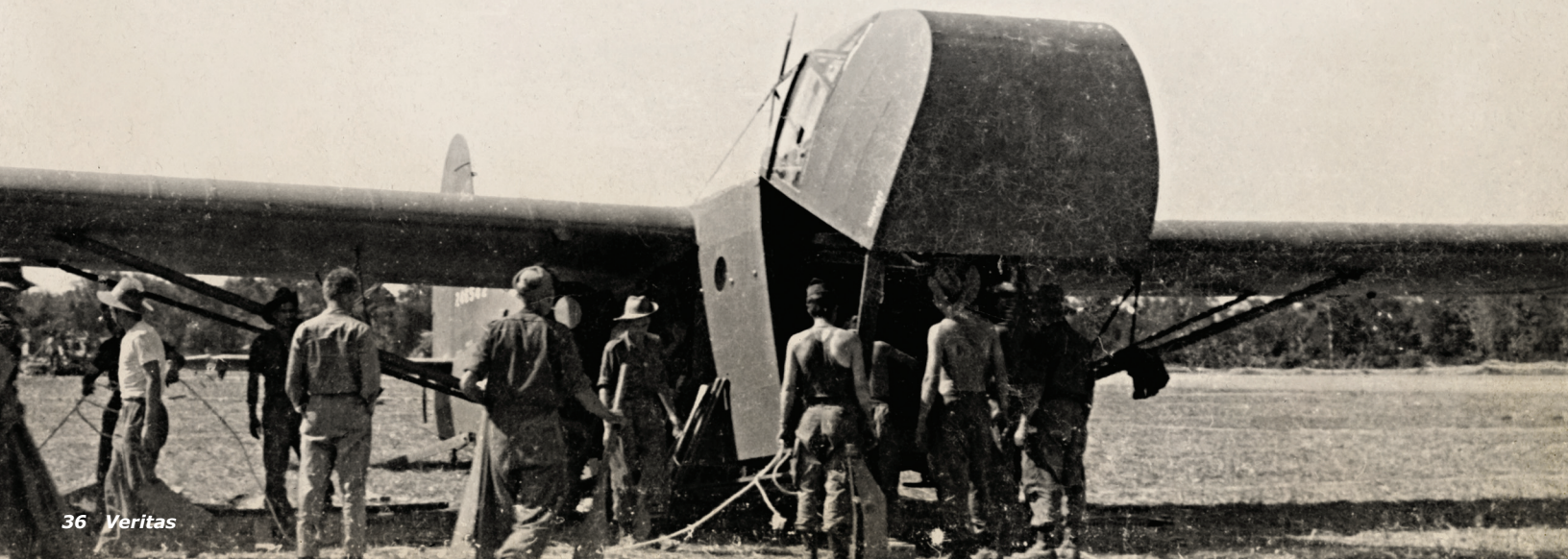
CG-4A Waco gliders were used in several operational theaters during WWII. Here, a glider flown by the 1st Air Commando, is being used by OSS Detachment 101 in Burma in 1944.

In Europe, gliders were used in airborne operations in Sicily, France, the Netherlands, and Germany, and in the Far East in Burma and the Philippines. However, once the war ended, they quickly became obsolete. By 1953, the U.S. Army no longer trained glidermen. Yet, evidence of the large U.S. Army glider program can still be found in and