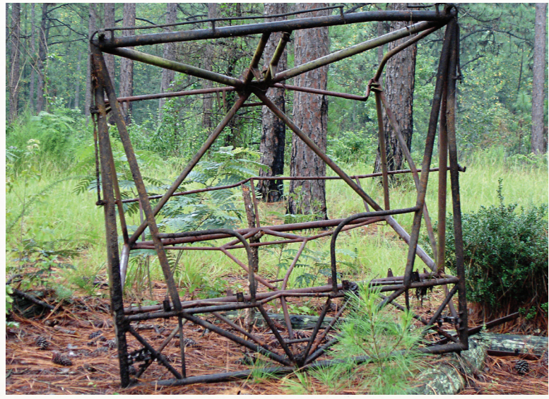
The photo on the left illustrates the pilot's compartment of the CG-4A Waco glider. On the right is the skeleton of another nose compartment which was pulled from a Camp Mackall swamp in the summer of 2006.

around Fort Bragg. The Airborne and Special Operations Museum (ASOM) in downtown Fayetteville, North Carolina, has one of the few remaining CG-4A Waco gliders on permanent display. In the summer of 2006, the nose section of a CG-4A was rescued from a Camp Mackall swamp. Plans are underway to transform this artifact into a memorial to the U.S. Army glider troops and the 551st Parachute Infantry Battalion paratroopers who jumped from it at Camp Mackall during WWII. ♣