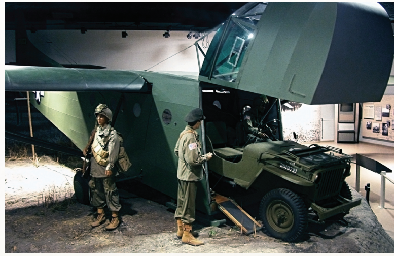
A restored CG-4A Waco Glider is on display at the Airborne and Special Operations Museum, Fayetteville, North Carolina.