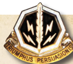
8th PSYOP Battalion DUI

President George H. W. Bush ordered U.S. European Command (EUCOM) to stand up a Joint Task Force (JTF) to