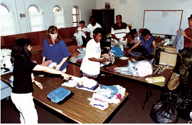
Civilian and military volunteers sort through clothing donated on Guam. The local community donated $650,000 worth of clothing, household items, toiletries, toys, and other things, as well over 40,000 volunteer hours during the six months of the operation.