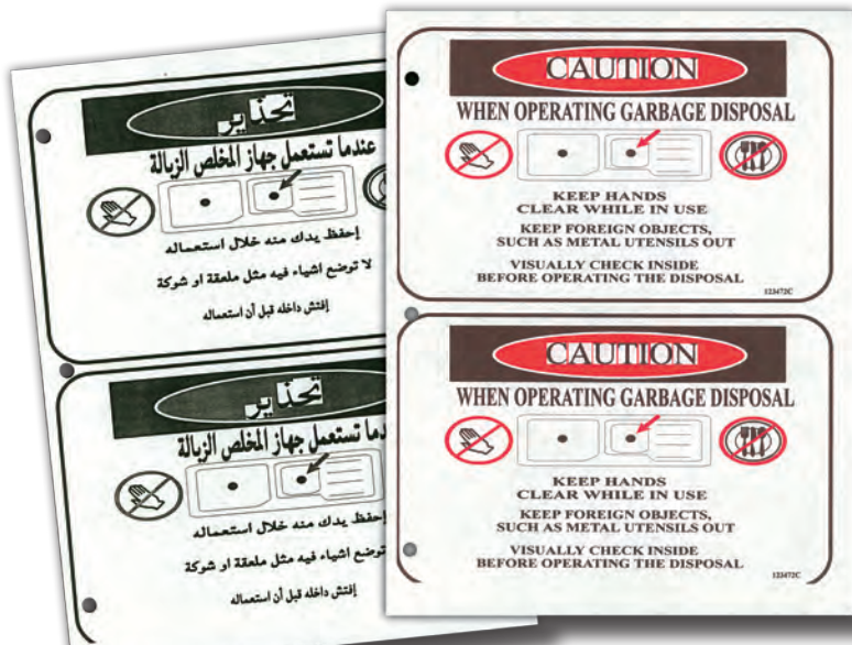
A MIST product to help the refugees. The "garbage disposal handbill" helped prevent fingers and utensils from getting chewed up.