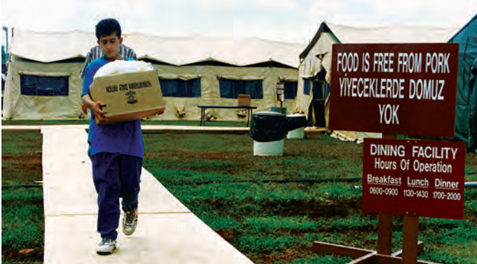
A Kurdish refugee boy carries food for his family to his temporary home at Andersen AFB, Guam from the dining facility. The sign on the right assures the Kurds that the food is "Free from Pork," meeting Muslim religious dietary customs.