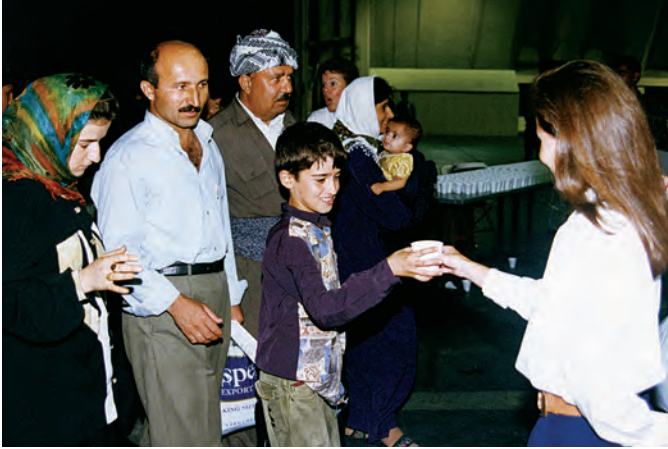
A volunteer escort meets a Kurdish refugee family upon arrival at Andersen AFB, Guam. The volunteer would help the family through customs, medical screening, and an initial INS interview.