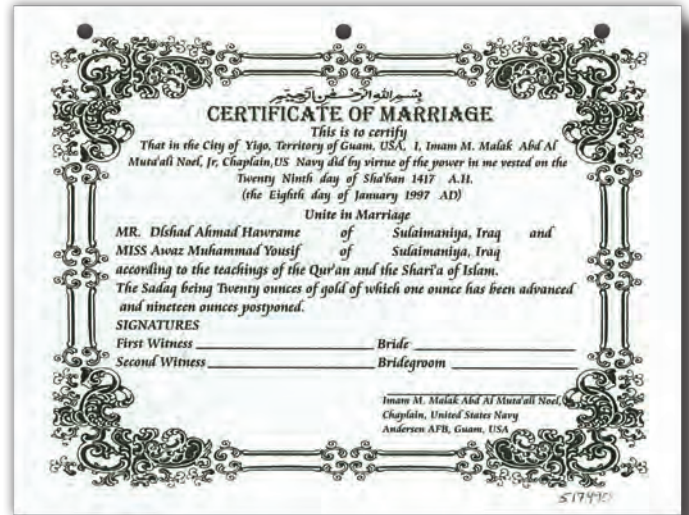
A sample marriage certificate. One of the duties of the Muslim chaplain was to "re-marry" many of the Kurdish couples to provide them proper emigration documentation.

never worked with PSYOP and did not understand the capabilities. "It became apparent early on that we would need to train the Task Force [staff] on the capabilities/limitations of what a MIST can and should do," wrote MAJ Henry. "We ... turned away requests to translate lengthy pamphlets into Arabic for distribution. Pamphlets require too much time/equipment and translator investment with too little overall return." 39 One-page handbills were used to rapidly pass information to the refugees.