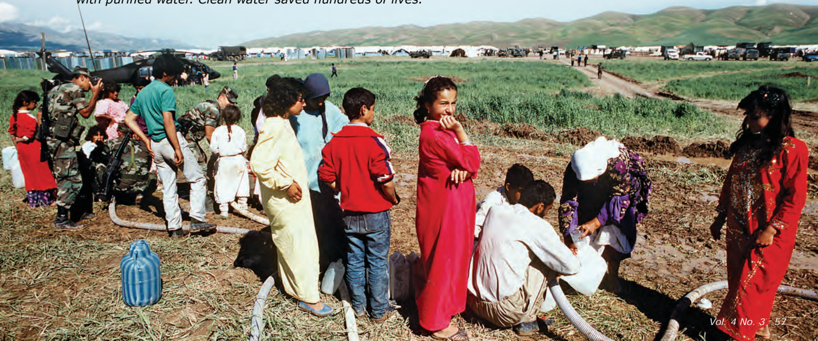
In the relative safety of a CJTF-Provide Comfort camp near Zaku, Kurdish refugees fill containers with purified water. Clean water saved hundreds of lives.

The Patriotic Union of Kurdistan (PUK) and the Kurdish Democratic Party (KDP) each had equal power in the parliament. In August 1996, political relations deteriorated into all out fighting. The intensity escalated