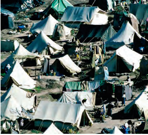
One of the many refugee "shanty towns" that sprang up along the mountainous Iraq-Turkey border. Hundreds died of exposure and sickness in the harsh and unpredictable weather.