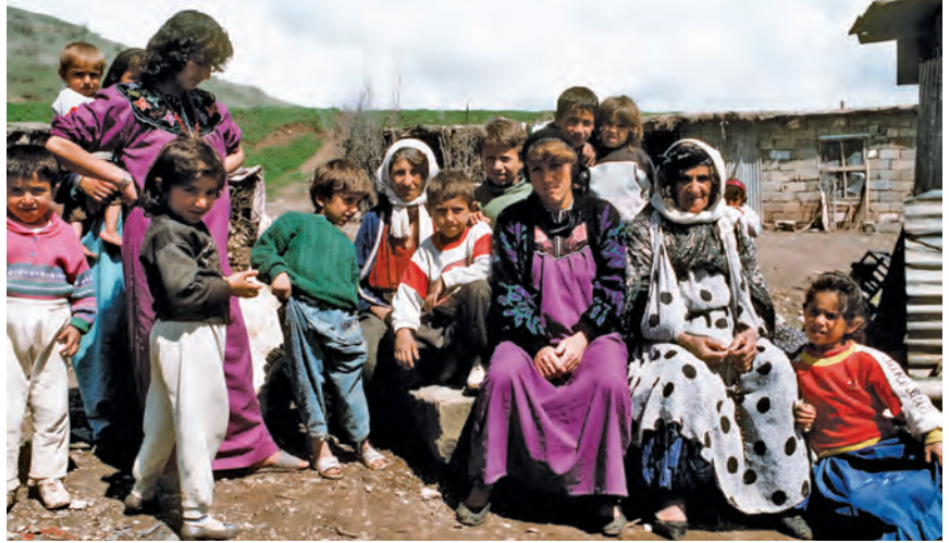
Kurdish refugees fleeing Saddam Hussein's forces with all their worldly belongings pause for a rest on a road near a refugee camp. The refugees received aid from CJTF-Provide Comfort at the camp.

begin humanitarian assistance operations on 6 April 1991 from Incirlik Air Base, Turkey. When British and French forces joined the effort, the task force became Combined Joint Task Force PROVIDE COMFORT (CJTF-PC). Its mission was to "provide relief to the refugees and enforce the security of the humanitarian efforts of the CJTF as well as the various non governmental organizations attending to the needs of the Kurds." 13 The UN created a Kurdish "safe haven" in northern Iraq. It became known either as the "Provide Comfort" zone or the "Autonomous Kurdish Region." The zone assumed a de facto quasi-independent country status supported by the Coalition. 14 The zone was protected with a Coalition-enforced "No-Fly Zone" to prevent the Iraqis from conducting offensive flights.