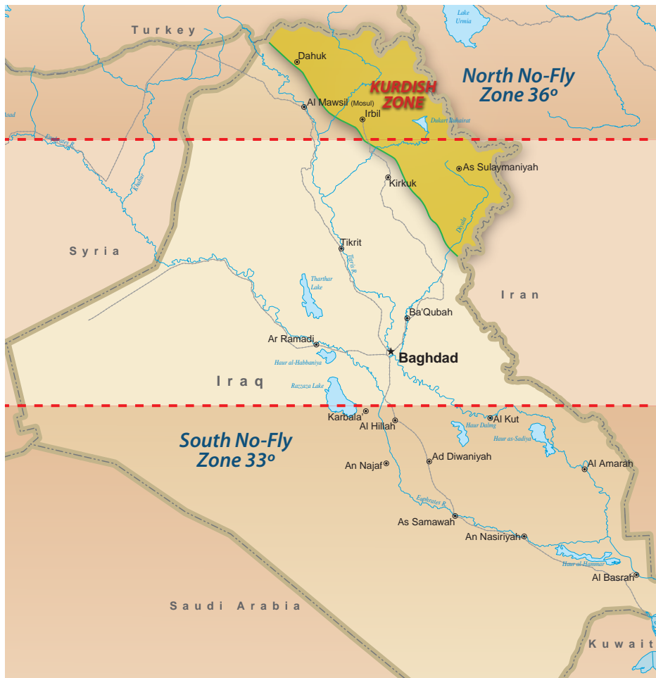
Map of Iraq showing the two No-Fly zones and the Kurdish area that became the Operation PROVIDE COMFORT zone.

between 17 and 22 August, when, in a surprise move, the KDP allied with the Iraqi Army to seize the PUK controlled city of Erbil. The city was significant for several reasons: it was the site of the Kurdish Parliament; and the headquarters of the Iraqi National Congress that opposed the Iraqi government. With his new allies, Saddam Hussein launched a 40,000-man force into the OPC area. 17