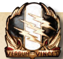
4th POG DUI