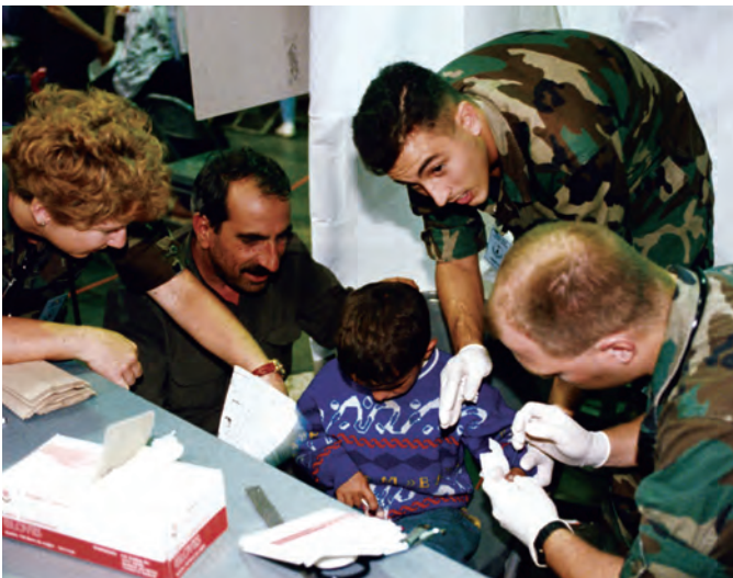
Medical personnel take a blood sample from a newly-arrived Kurdish boy who is being comforted by his father. The medical screening procedures were critical for getting approval to emigrate.

Andersen South was a furnished housing area for the refugees. The Base Housing Office provided all furniture and household items, from pots and pans to linens. A centralized dining facility was set up in the center of the community to provide three hot meals a day. But, after the first few weeks, Kurdish leaders asked that the families be allowed to cook at home. Food, with special attention to Muslim dietary restrictions, was provided from a central issue site.