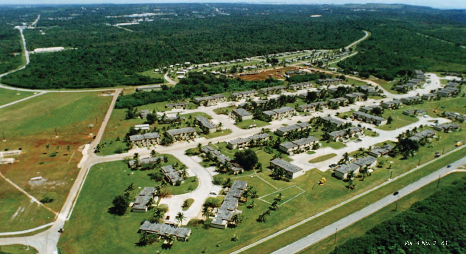
Aerial view of the temporary lodging for Kurdish refugees, the Andersen South Housing Area, Guam. The housing area initially held over 2,400 Kurds.

HAVEN, the 4 th POG worked with Haitian refugees (classified as "economic migrants" by DOS and INS) and Cubans seeking political asylum quarantined at Guantanamo Bay, Cuba, and later on the Empire Range area in Panama. 40 PACIFIC HAVEN was not a "typical" PSYOP mission; the Kurds were refugees ("evacuees" or "guests" in the JTF parlance). The MIST had to plan a campaign to integrate the Kurds into Western society. "We are not conducting PSYOP on the Kurds. They are guests and we are simply providing information to make their relocation less stressful, which in turn will assist