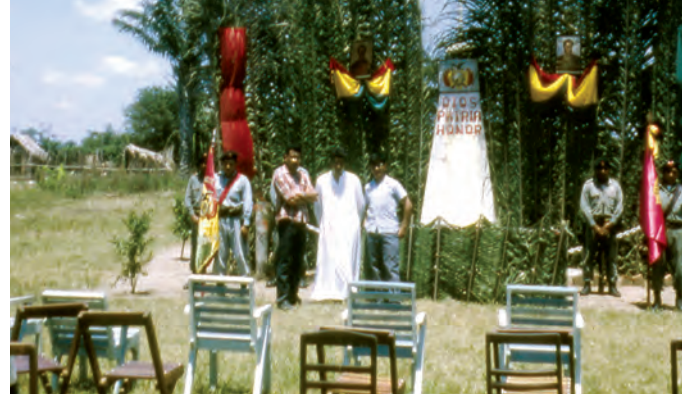
Traditionally, local priests in Bolivia sanctified community construction projects with a blessing. Working with local people proved to be lot easier than with the USAID at the embassy in La Paz.