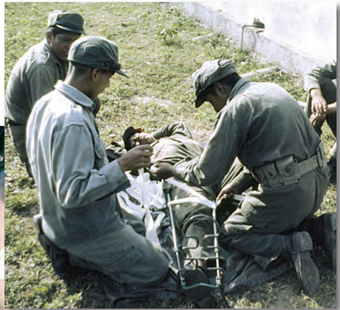
(Right) Bolivian Ranger medics practice splinting a broken leg.