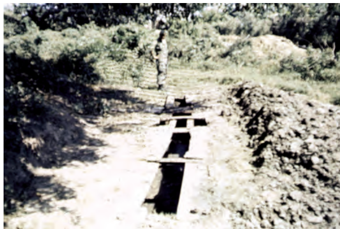
The slit trench latrine built by the SF medics was treated like a shrine by the Bolivians and never used.

"It was hard to impress upon the Bolivian troops that field sanitation was important. They simply did not know any better. The majority were indios from the hinterlands whose toilet since birth had been anywhere outdoors.