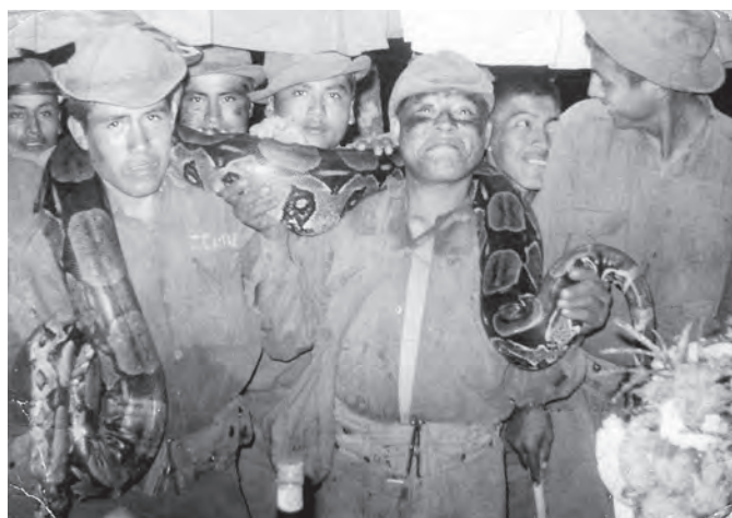
The large anaconda was added to the Bolivian "stew" pot.