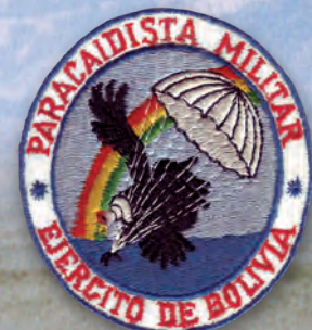
Bolivian Airborne School Patch