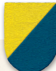
8th Special Forces Group Flash