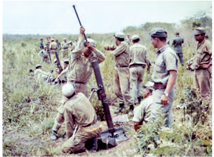
The Bolivian Army had long suffered from poor training and antiquated equipment. The influx of U.S. military equipment and personnel rapidly improved their capability in the 1960s. These U.S. WWII-era M-1 81 mm mortars with lightweight base plate were part of the Military Assistance Program given to the Bolivian Army.

The Special Forces MTT members conducted an airborne proficiency jump with the Bolivian Airborne School students at Cochabamba in October 1967. In the background is a Korean War-era F-51D Mustang, one of the mainstays of the Bolivian Air Force in 1967.