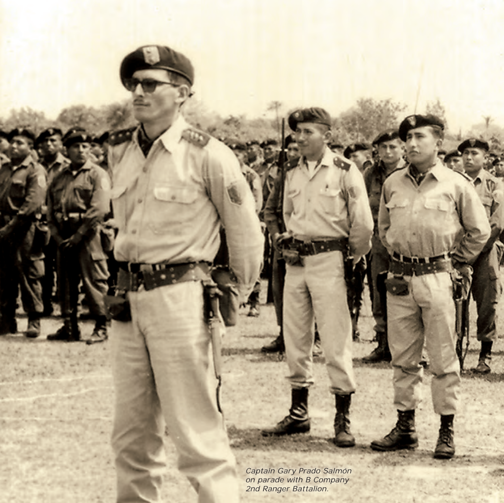
Captain Gary Prado Salmón on parade with B Company 2nd Ranger Battalion.