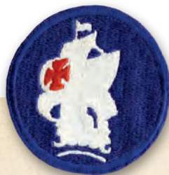
U.S. Army Forces Southern Command SSI