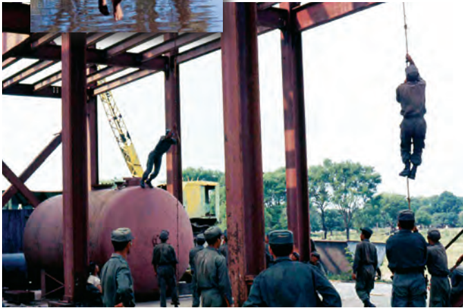
The SF team set up an obstacle course using storage tanks in the sugar mill. SSG Jerald L. Peterson noted, "The Indians didn't have much upper body strength. They struggled with the rope climbing."