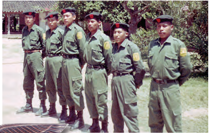
Ranger graduates proudly wear green berets, their distinctive unit headgear.