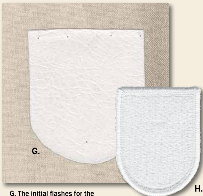
G. The initial flashes for the Special Forces Training Group were made of naugahyde. This example is in the collection of the USAJFKSWC Archives.