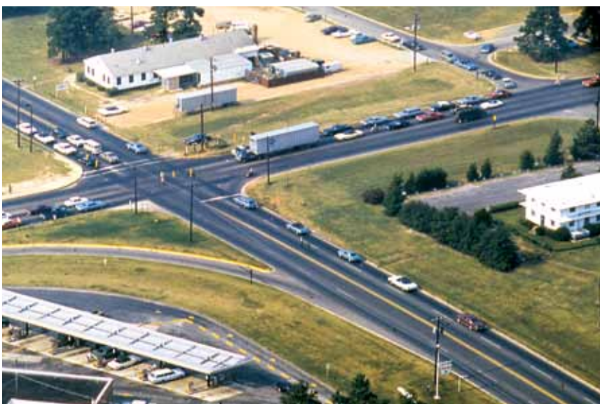
The original PSYWAR center was located at the intersection of Reilly and Gruber Roads on Fort Bragg, NC. The headquarters building is the WWII barracks in the lower right corner.

On 7 June 1965, the Secretary of the Army approved the DUI for wear, centered on the School’s beret flash. 9 This meant that only those assigned to the Special Warfare School could wear the DUI on their flash. Personnel assigned to Headquarters, U.S. Army John F.