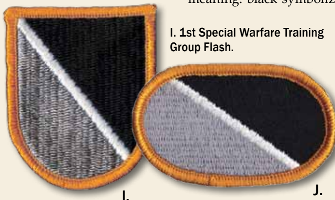
I. 1 st Special Warfare Training Group Flash.