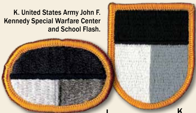
K. United States Army John F. Kennedy Special Warfare Center and School Flash.