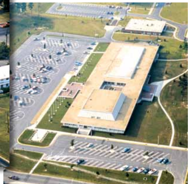
The USAJFKSWC moved to John F. Kennedy Hall Building #D-3004 in 1965.