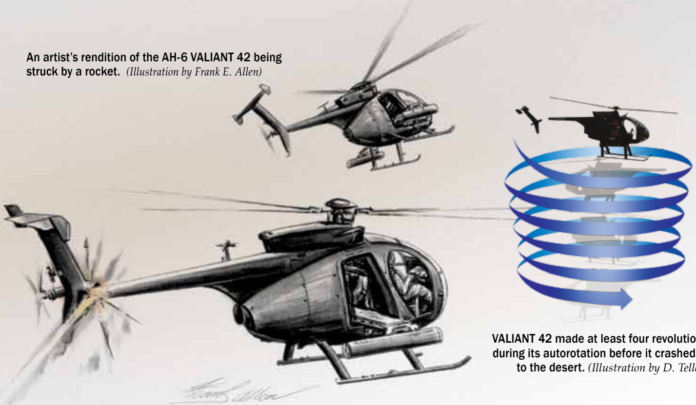
VALIANT 42 made at least four revolutions during its autorotation before it crashed in to the desert. (Illustration by D. Telles)

An artist's rendition of the AH-6 VALIANT 42 being struck by a rocket. (Illustration by Frank E. Allen)