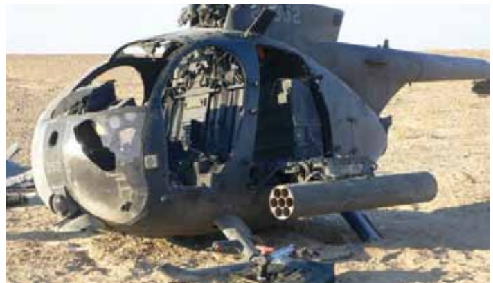
The crashed AH-6 in the desert. The pilots used fuel and ammunition from the aircraft to keep VALIANT 41 in the fight.