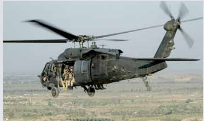
The MH-60K Black Hawks provide long-range night penetration for the 160th SOAR. The "Kilos" transported the ARSOF troops to Objective DOMINION PINE and later sling loaded the downed VALIANT 42.