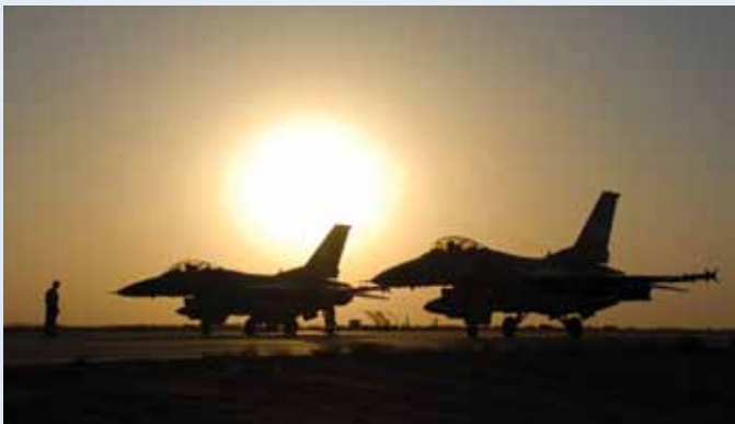
U.S. Air Force F-16 Fighting Falcons prepare for operations at Balad Airbase, Iraq. The F-16s were instrumental in disrupting the enemy attack.

At 12:50 pm, ARSOF personnel manning the eastern part of the perimeter reported vehicles mounting weapons approaching from the south. "We initially believed them to be Iraqi Police or Iraqi Army based on the overt nature of their driving up on our position," said MAJ Teriault. 9 This misconception soon vanished when RPG and small arms fire began to rain in on the ARSOF position as the trucks drove to within 800 meters of the perimeter. MSgt Alsup called in HELLCAT 56 (HELLCAT 55 had left for aerial refueling), to engage the advancing enemy and