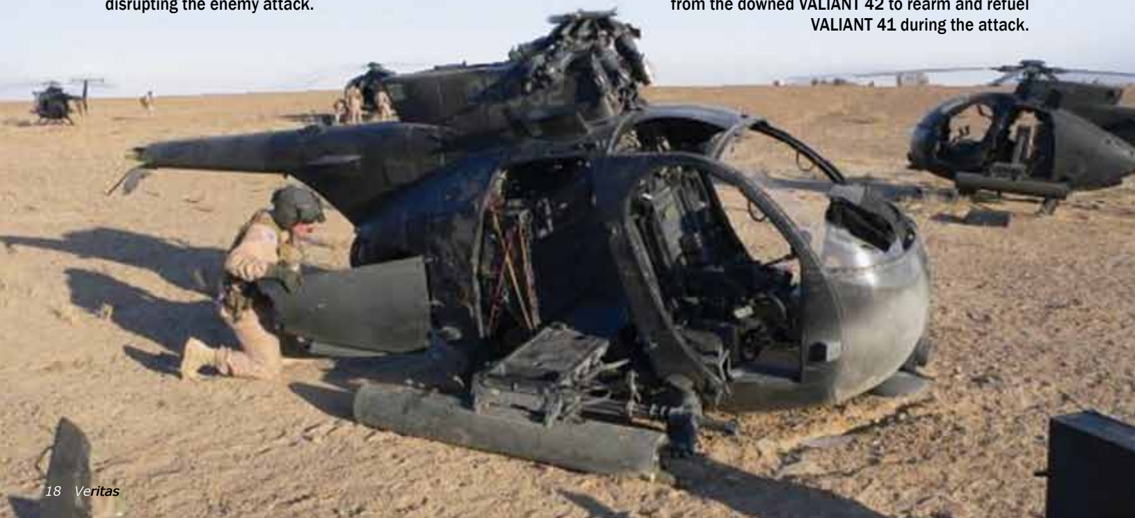
MH-6 pilots transferred ammunition and fuel from the downed VALIANT 42 to rearm and refuel VALIANT 41 during the attack.