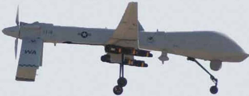
The Predator Unmanned Aerial Vehicle provided surveillance and firepower, destroying one enemy vehicle with a Hellfire missile.

on the vehicles with its 20mm cannon. Unfortunately, on the second run, the F-16 crashed into the desert about six miles from the landing zone. The pilot did not eject. His aggressive pursuit prevented any reorganization by the fleeing enemy and completely disrupted their attempts to continue the attack.