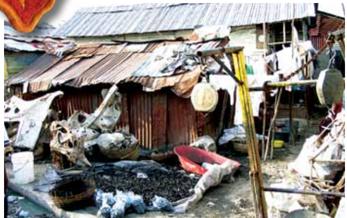
The slums of Citi Soleil were patrolled by the Nepalese and their Special Forces advisors. The squalor and poverty of Citi Soleil was a shock even for the economically poor Nepalese.

their loads at the Port-au-Prince city dump, they were mobbed by the frenzied poor attempting to get at the choicest bits of refuse. After a number of people were crushed by bales of garbage, the Nepalese battalion was tasked to secure the dump when the trucks arrived.