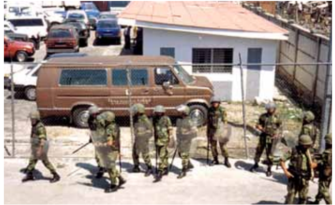
The Nepalese in full riot gear preparing to escort the garbage trucks into the city dump. Their training in crowd control was necessary to prevent riots and injuries at the dump.