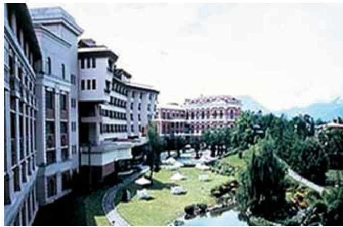
A view of the famous Yak and Yeti hotel. The Nepalese economy is heavily dependent on dollars generated by tourism, particularly mountaineering and trekking.

headquarters in Kathmandu. It was here that they got their first exposure to the famous Gurkha troops who have played a prominent role in Nepalese history.