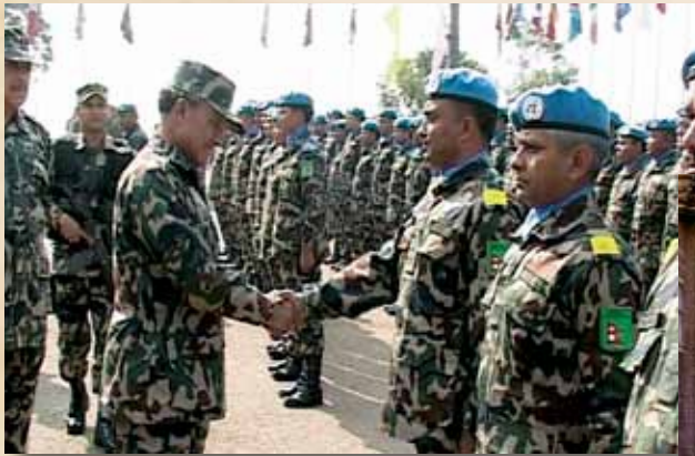
The Chief of Staff of the Nepalese Army inspects a contingent of troops prior to their deployment for UN service in Bosnia. The Nepalese Army has been supporting UN operations since 1958.