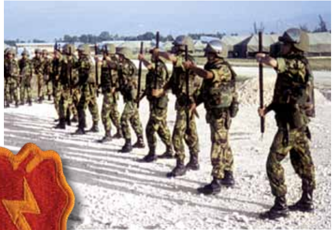
25th Infantry Division SSI

Daily garbage collection from the UN compound and the American bases resulted in several Haitian deaths during its disposal. When the trucks attempted to empty