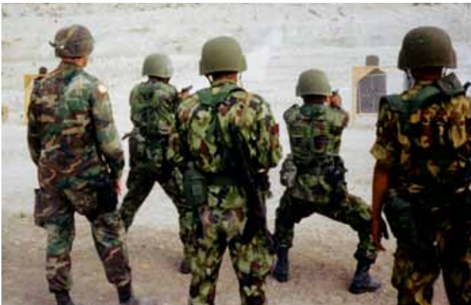
Pistol marksmanship with the U.S. M-1919 .45 caliber pistol. The slightly-built Nepalese soldiers braced themselves for the recoil of the pistol.

training on crowd control, detainee operations, and medical evacuations. 20 While the UN specified that participating nations provide operationally ready troops for peacekeeping missions, prudence dictated that the Nepalese receive further training before working in the politically sensitive arena of Haiti.