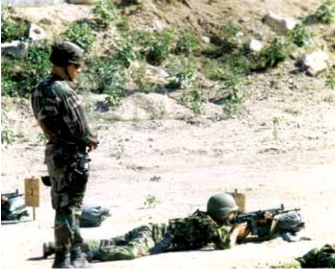
Marksmanship training with the Nepalese Army's Belgian FN rifles was a major portion of the Special Forces program of instruction in Haiti.