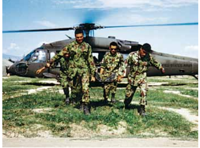
Training on loading and unloading MEDEVAC patients was part of the training in Haiti. It was particularly popular because the soldiers usually got a helicopter ride.

The Nepalese mission was two-fold; guard duty at the port facility of Port-au-Prince and security patrols throughout the city. The UN provided the Nepalese with