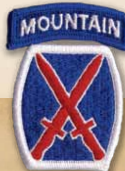
10th Mountain Division SSI