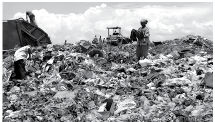
The garbage dump at Port-au-Prince was the scene of several riots and injuries as the poverty-stricken Haitians fought over the garbage from the UN compounds.

The Nepalese and their Special Forces advisor in full riot gear form a cordon around one of the garbage trucks at the Port-au-Prince dump. In poverty-stricken Haiti, the garbage from the UN and U.S. compounds was a treasure trove for the locals.