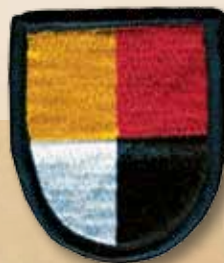
3rd Special Forces Group Flash

Forces Group (3rd SFG), whose mission was to establish a presence in the countryside and provide a secure environment for the return of the Aristide regime and the subsequent follow-on elections. On 19 September 1994, JTF-180 aboard the USS Eisenhower was poised off the coast of Haiti to conduct an airmobile assault into Port-au-Prince. Aircraft loaded with paratroopers of the 82nd were in the air bound for the island. A last-minute diplomatic effort by former President Jimmy Carter, Senator Sam Nunn, and General Colin Powell convinced LTG Cedras to honor the Governors Island Accords. JTF-180 entered the now permissive environment and established control of Port-au-Prince. President Aristide arrived on 15 October 1994. His return triggered the transition between JTF-180 and the UN forces. JTF-180 was replaced by JTF-190 and on 24 October 1994, the 10th Mountain Division and the UN-authorized Multi-National Force (MNF) took over