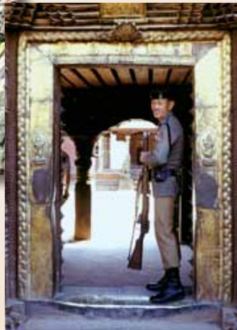
A member of the Royal Guard Brigade on duty at one of the entrances to the palace complex. In 1995, the Nepalese Army numbered 46,000, with a brigade dedicated to guarding the Royal Family.

In 1995 the Nepalese Army was a force of 46,000 active soldiers. The primary units in the Army were seven infantry brigades, a Special Forces brigade, an artillery brigade and an engineer brigade. The separate Royal Guard Brigade, which included a Military Police battalion provided security for the Nepalese Royal family. In addition to the combat brigades there was a cavalry squadron with British Ferret armored cars, and forty-three independent infantry companies dispersed throughout the country. The Special Forces Brigade consisted of one airborne battalion and two independent Special Forces companies. A minuscule air wing of 215 personnel flew and maintained one