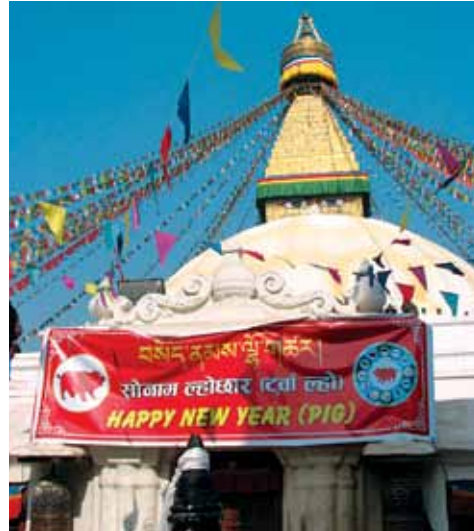
The bustling capital city provided a wealth of strange sights and sounds for the Special Forces soldiers.