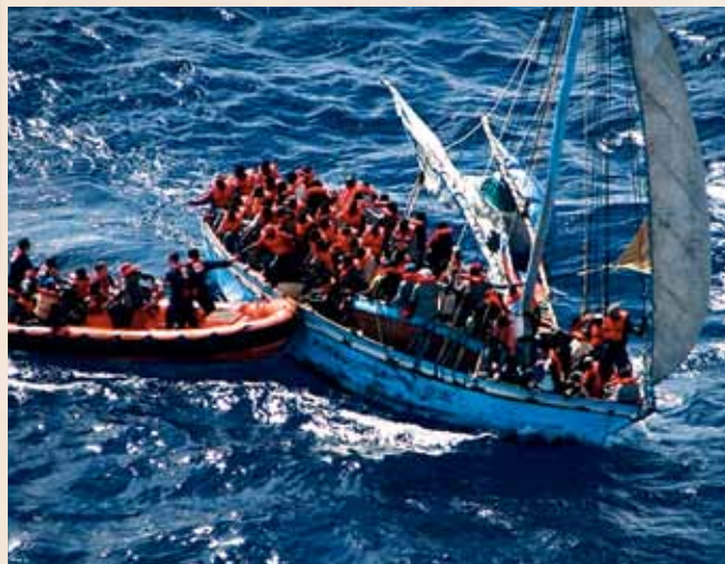
U.S. Coast Guard personnel interdicting a boat load of Haitians attempting to reach the United States. The flood of refugees was in large part responsible for the U.S. and UN reaction.

Forces Group (3rd SFG), whose mission was to establish a presence in the countryside and provide a secure environment for the return of the Aristide regime and the subsequent follow-on elections. On 19 September 1994, JTF-180 aboard the USS Eisenhower was poised off the coast of Haiti to conduct an airmobile assault into Port-au-Prince. Aircraft loaded with paratroopers of the 82nd were in the air bound for the island. A last-minute diplomatic effort by former President Jimmy Carter, Senator Sam Nunn, and General Colin Powell convinced LTG Cedras to honor the Governors Island Accords. JTF-180 entered the now permissive environment and established control of Port-au-Prince. President Aristide arrived on 15 October 1994. His return triggered the transition between JTF-180 and the UN forces. JTF-180 was replaced by JTF-190 and on 24 October 1994, the 10th Mountain Division and the UN-authorized Multi-National Force (MNF) took over