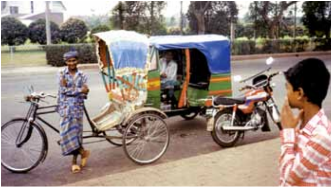
A taxi in Dhaka, the capital of Bangladesh. The first stop for the Special Forces team was Dhaka, to coordinate with the U.S. Military Assistance and Advisory Group that had responsibility for Nepal.