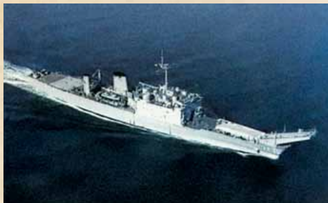
The USS Harlan County was prevented from docking at Port-au-Prince by armed mobs instigated by General Raoul Cedras. This action ultimately resulted in the deployment of U.S. and UN forces to Haiti to restore the Aristide government.

The overthrow of Haiti's elected President Jean Bertrand Aristide on 30 September 1991 by Lieutenant General Raoul Cedras' military coup set off a chain of events that culminated in Operation UPHOLD DEMOCRACY. The United Nation's response to the coup was to pass UN Resolution 970 placing a trade embargo on Haiti. The embargo devastated the economy and triggered an exodus of more than 21,000 citizens. Many tried to enter the United States. On 3 July 1993, the UN and the Organization of American States (OAS) brokered the Governors Island Accords, a ten-point program designed to restore democracy to Haiti. 1 Both Cedras and Aristide signed the Accords, prompting the UN to lift the embargo. However, the reconciliation was short-lived.