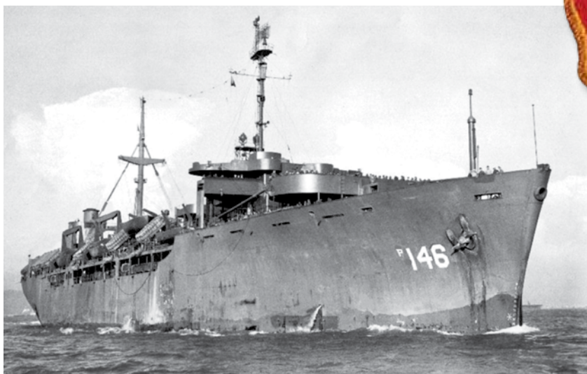
The 5th Ranger Company, along with the 3rd and 8th Ranger Companies sailed to Korea on the USS General W. F. Hase.