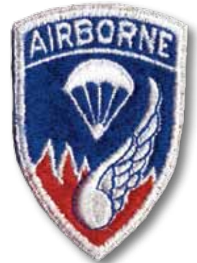
187th Airborne Regimental Combat Team SSI