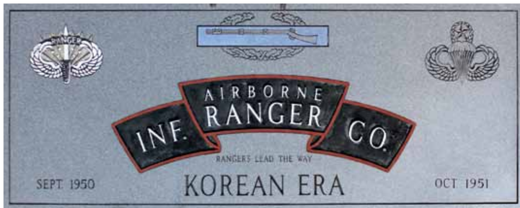
As ARSOF legacy units, the Ranger Companies of the Korean War have a memorial stone in place at the USASOC Memorial Plaza, Fort Bragg, NC.