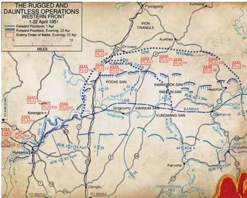
Area of 25th Division advance until 21 April 1951.

were informed that they were replacing the recently deactivated Eighth U.S. Army (EUSA) Ranger Company (8213th Army Unit). 10 Many assumed that the stateside-formed Ranger Infantry (Airborne) companies had caused the demise of the in-theater assets created early in the war. 11