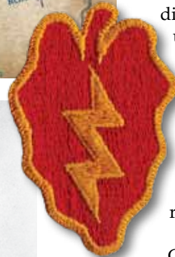
25th Infantry Division SSI