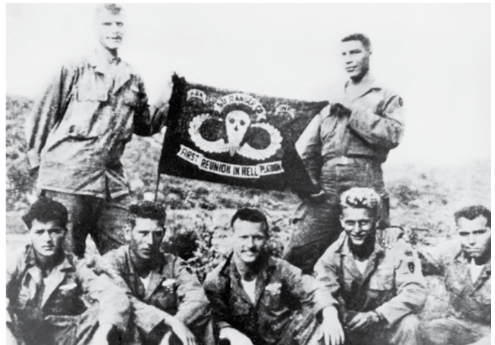
Rangers of the 1st Platoon hold a makeshift guidon in Korea, 1951. Many of the Rangers wear the Shoulder Sleeve Insignia of the 25th Infantry Division, surmounted by a Ranger scroll.

The 5th Rangers might have gotten a larger role in the offensive. With the UN forces pushing north, according to the Ranger veterans, rumors arose that they would conduct an airborne insertion. According to them, the I Corps staff wanted to use the unique capabilities of the Airborne Ranger Infantry companies. Since I Corps had the second cadre of Ranger Companies, the 3rd, 5th, and 8th, it looked to secure drop aircraft and hastily drew up plans to organize and insert this provisional Ranger Battalion by parachute at a road junction near Ch'orwon. In that way, the combined Ranger force would occupy positions that would block