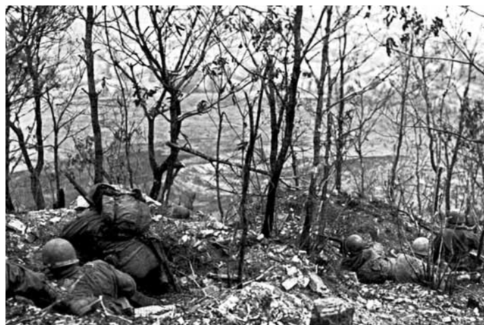
Soldiers of the 25th Division just south of Ch'orwon during the Chinese Spring Offensive, 23 April 1951.