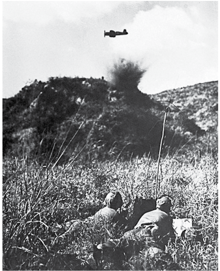
Example of a Marine air-observer team guiding a USMC F46 Corsair in for a strike on an enemy-held hill. The Corsair pilots were highly praised by Army & Marines for precision strikes on targets and their extremely close support of forward units.

The anticipated Chinese ground attack was preceded by a twenty-minute mortar barrage that began at 2000 hours. In between concentrations, the 5th Rangers listened to Chinese commanders issuing orders. Two red flares signaled the lifting of indirect fire and bugles sounded to start a massive ground attack from three sides. In the resulting close quarter bayonet fighting, a Ranger remembered that that he "could smell the garlic" on the Chinese soldiers' breath because they were that close. 19 After fighting off successive waves of CCF attacks for three hours, it became obvious that the Ranger company (half the size of a conventional infantry company) could