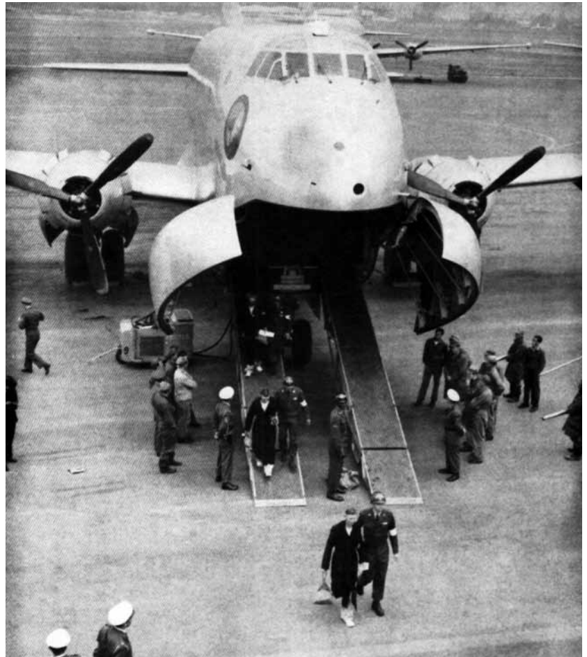
Former U.S. POWs are escorted down the ramp of the Air Force C-124 that brought them to Tokyo, Japan. Those POWs in need of significant medical treatment were flown to Japan before travelling on to the United States.