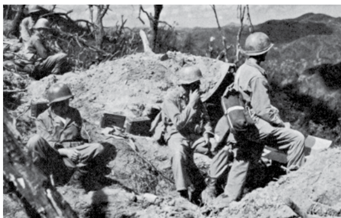
Soldiers of the 9th Infantry Regiment, 2nd Infantry Division on the crest of Bloody Ridge. The "Manchus" fought a ferocious battle to seize the ridge in August 1951.