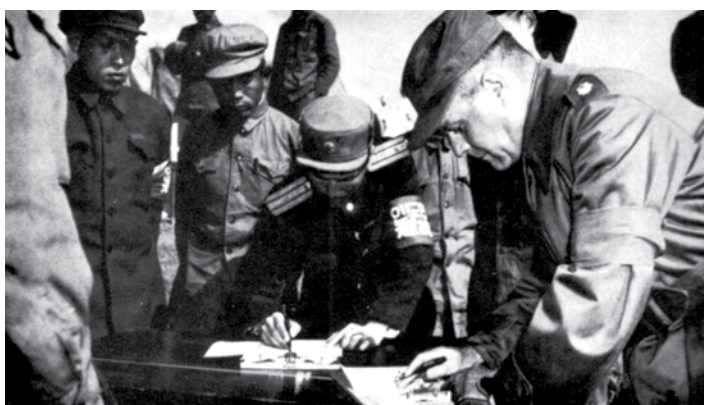
UN and North Korean officers acknowledge receipt of transferred POWs at Freedom Village, Panmunjom. In Operation LITTLE SWITCH on 11 April 1953, 605 UN POWs were exchanged for 6,030 Communist prisoners.