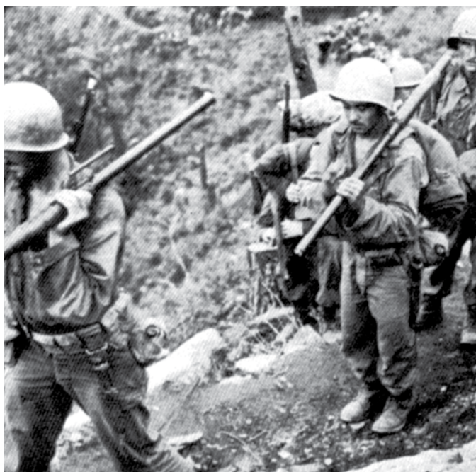
Troops of the 2nd Infantry Division move to occupy new positions near Yanggu. The hard-fighting 2nd Division was a mainstay of the U.S. X Corps.

The 1st Ranger Company conducted a successful raid on the headquarters of the North Korean 12th Corps . The Rangers moved nine miles into the enemy rear, raided the headquarters and returned to friendly lines.