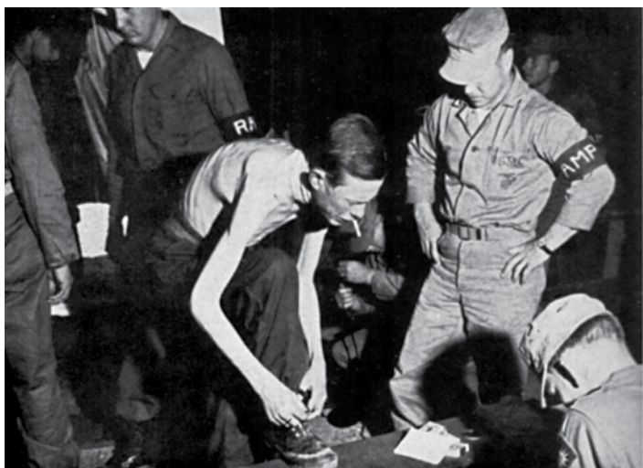
An emaciated American POW receives new clothing at the transfer station, Freedom Village, Panmunjom.