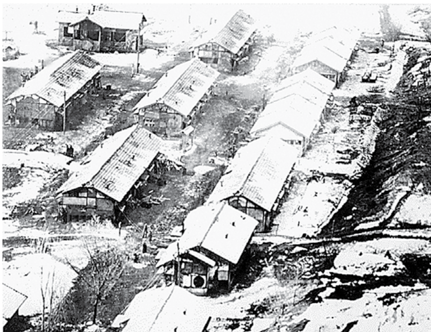
An aerial view of a camp believed to be used to house UN POWs near Chiktong, North Korea. The barracks have no markings although Communist officials had agreed to mark POW camps.