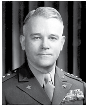
General J. Lawton Collins, the Army Chief of Staff, directed the formation of "Marauder Companies" to counteract the North Korean guerrilla threat. His directive led to the formation of the Ranger Training Center at Fort Benning, Georgia.

Airborne Class: The Korean War Ranger Companies were airborne units. Those volunteers not already jump qualified attended the Army Parachute School at Fort Benning, Georgia.