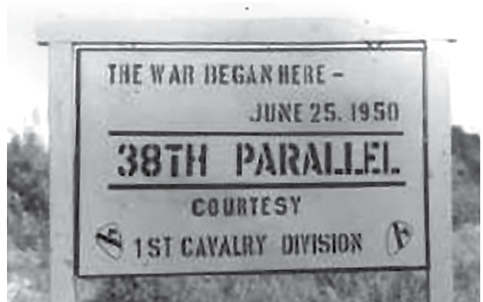
The Korean War began with the North Korean invasion of the south on 25 June 1950. The United States Army was ill-prepared for the war and had to rapidly build up all of its capabilities.