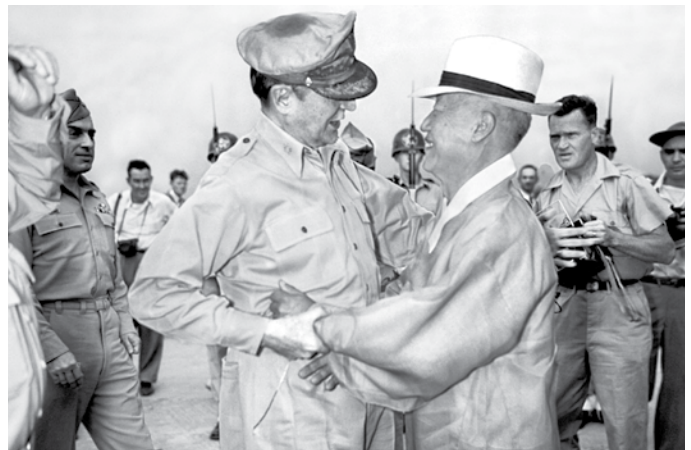
General Douglas A. MacArthur meets South Korean President Syngman Rhee. MacArthur requested Army Psywar elements to bolster Rhee's fragile government in the early days of the war.

capability, concentrating on the two primary methods for disseminating information, printed leaflets and radio broadcasting. Psywar courses were swiftly established at the Army General School at Fort Riley to train soldiers