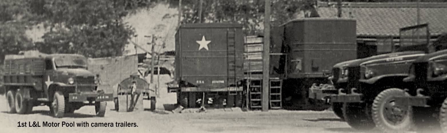
1st L&L Motor Pool with camera trailers.