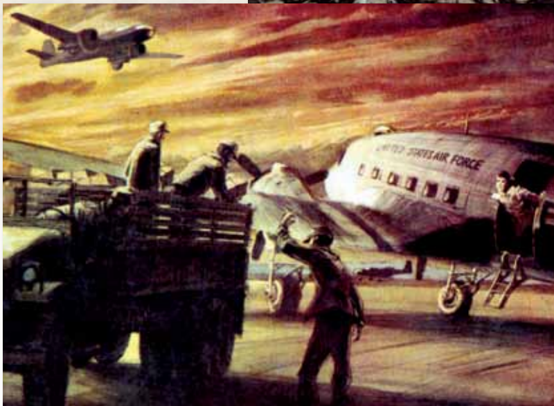
Delivering 1st L&L Company Psywar leaflets to K-16 Airfield in Korea.

There were so many Psywar leaflets dropped over Communist lines, much of it simply hand-tossed out the open windows or doors of low-flying aircraft, the enemy soldiers always had a choice of colors for toilet paper.