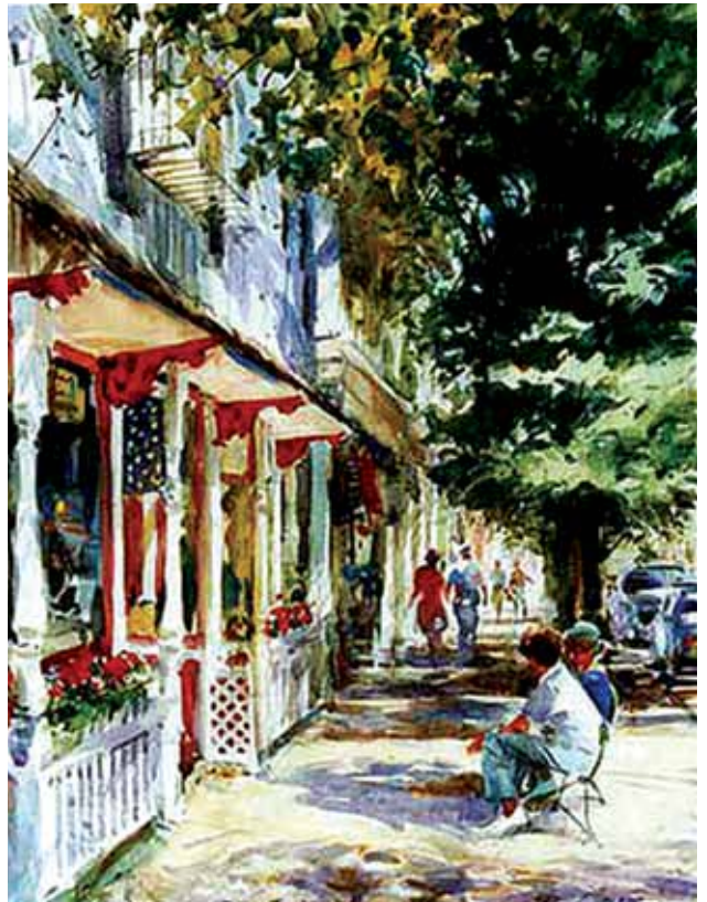
In contrast to the dark, harsh sketches of his war years, Zayac's current work consists of peaceful, light-filled watercolor street scenes.