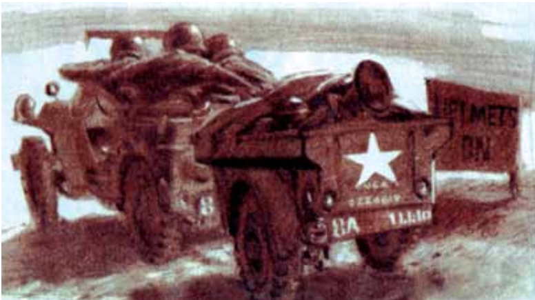
A Loudspeaker Team races back to the relative safety of the Main Line of Resistance (MLR) after a night broadcast mission.