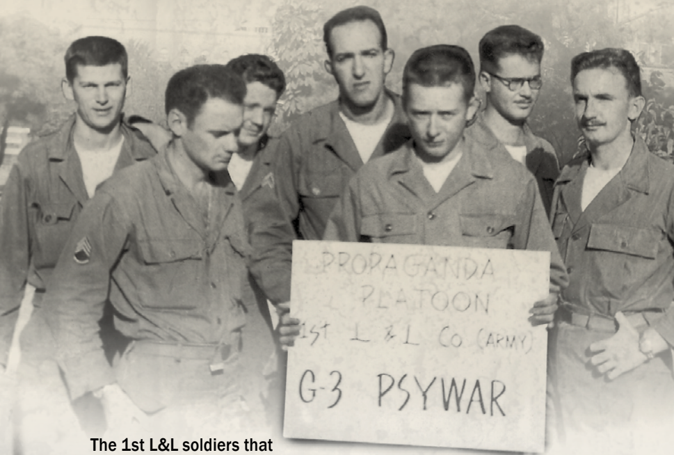
The 1st L&L soldiers that worked at EUSA G3 Psywar Division.