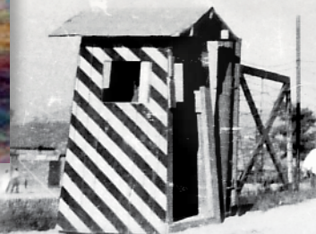
Entrance to the L&L Compound.