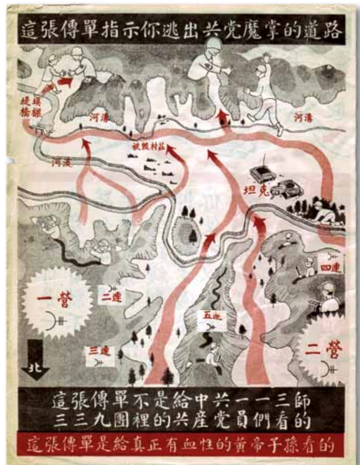
This pictograph Psywar surrender leaflet was a simple roadmap to freedom for many soldiers.

The 1st L&L consisted of artists, photographers, scriptwriters, loudspeaker teams, and linguists. They worked together to conduct psychological warfare designed to shorten the conflict, assure the civilian