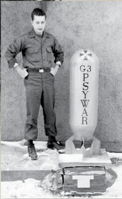
1st L&L soldier with a leaflet bomb used as an office symbol.