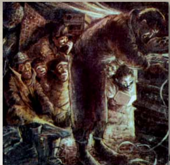
Broadcasting in comfort from a front line bunker was not typical for Loudspeaker Teams.