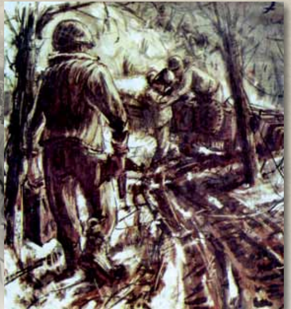
Loading and unloading equipment was a constant for the Loudspeaker Teams.