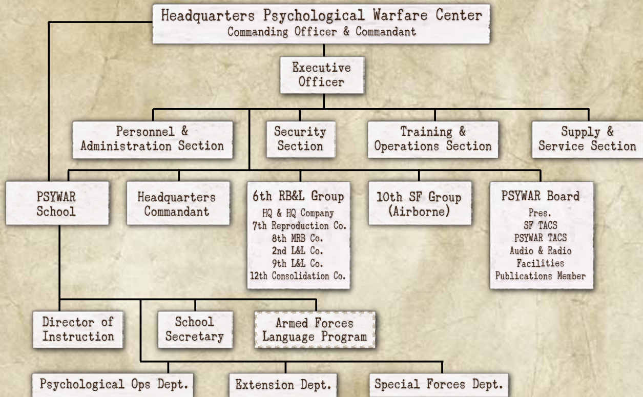
The Army Psychological Warfare Center (PWC) organizational breakdown, September, 1953.