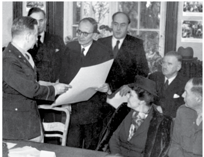
On behalf of the U.S. Military Government, BG McClure grants media operating licenses to Germans with conditions that broadcasts must not contain pro-Nazi or pro-Communist content.