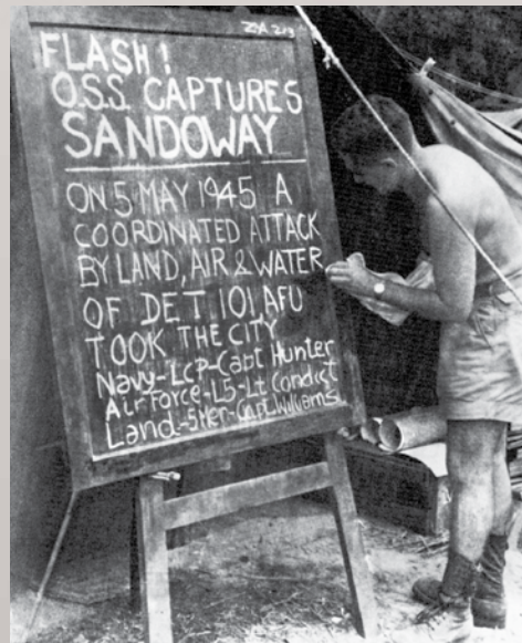
The Detachment 101 Arakan Field Unit utilized numerous OSS capabilities and branches to support the British drive on Rangoon, Burma. Here a member of the AFU publicizes the 'joint' and combined operations nature of the unit.

a tremendous coup. The AFU assisted the British in the invasion and liberation of Rangoon by exploiting what intelligence the Japanese had left behind. After Rangoon was occupied, the AFU no longer had a valid function and the OSS disbanded the unit.