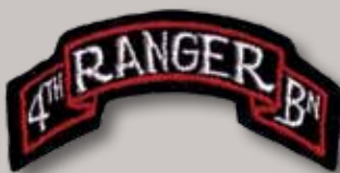
4th Ranger Battalion Scroll