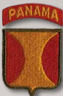
Panama Canal Department SSI