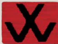
XV Indian Corps (UK) SSI