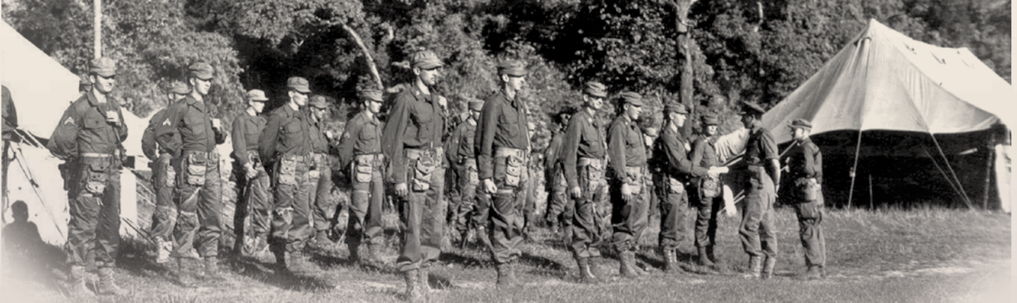
One of the two main elements of the AFU was the Operational Group (OG) component. Here the AFU OG is being inspected at Teknaf, India in late 1944 by Admiral Lord Louis Mountbatten, the commander of the British-led South East Asia Command.

A distinctive element in the OSS, the Arakan Field Unit (AFU) was a 175-man organization made up of all services representing several OSS branches. As a result, the AFU had numerous capabilities. Employed in southern Burma, the unit conducted reconnaissance missions along the Arakan coast and up its numerous inlets and rivers to assist the XV Indian Corps of the British XIV Army in its drive to take the capital city of Rangoon. Originally created in December 1944, the OSS first placed the AFU under the control of OSS Detachment 404, based out of Ceylon (now Sri Lanka). However, on 16 February 1945, in order to deconflict OSS operations in Burma, Detachment 101 took charge. Detachment 101, which had been conducting operations in Burma since early 1943, had a more robust command and control capability in country.