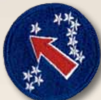
U.S. Army Pacific Command SSI