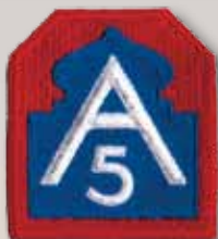
Fifth Army SSI