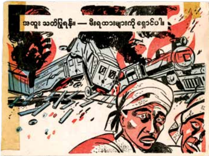
An OSS MO-produced leaflet for the Far East.