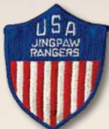
Detachment 101 Patch

The Ranger attack on Cisterna, Italy in late January 1944 turned into a debacle. The 1st and 3rd Ranger Battalions were destroyed, while the 4th sustained heavy casualties. When the Allies finally took the town on 25 May 1944, it was little more than rubble.