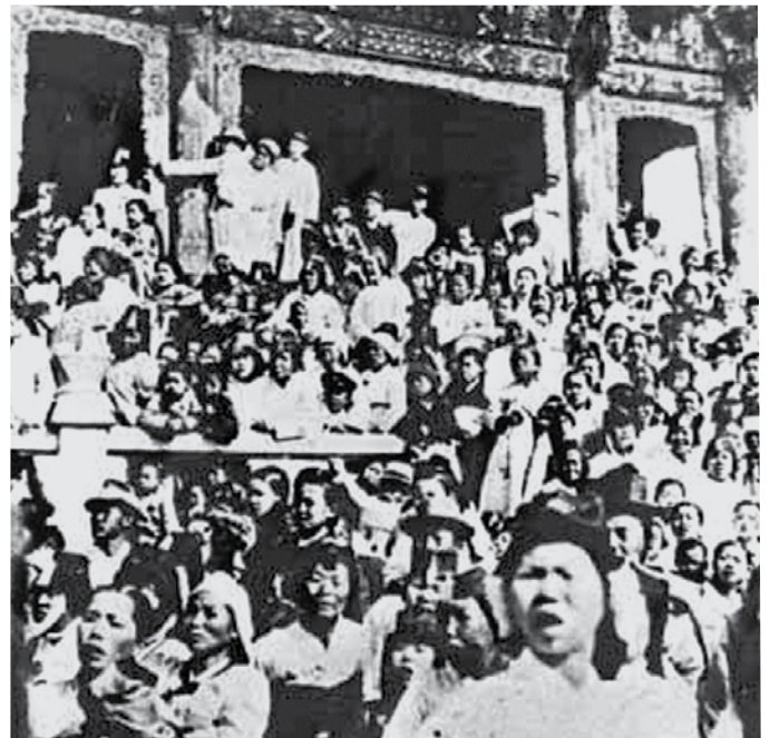
Koreans gathered in Pagoda Park in Seoul on 1 March 1919 to listen to the Proclamation of Independence from Japan.