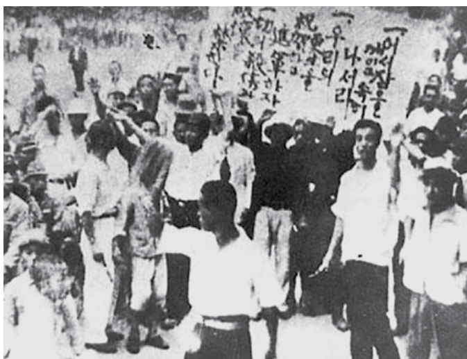
Non-violent Mansei marches supporting independence from Japan took place throughout Korea in the spring of 1919.