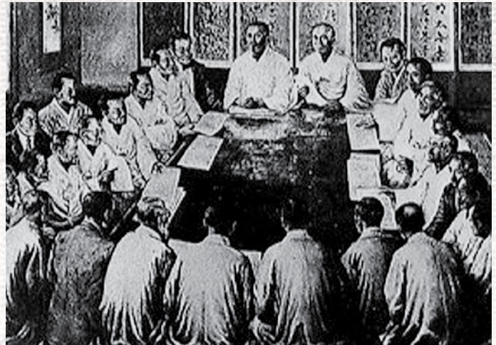
Independence Proclamation signatories gathered in a Seoul teahouse on 1 March 1919 to sign the document.

On 22 August 1910, Japan formally annexed Korea, ending the Chosŏn dynasty. General Terauchi Masatake became the first governor-general of Korea and Japanese minister of armed forces. Religion was the only organized activity permitted by the Japanese military government. During the Paris Peace Conference in January 1919, President Woodrow Wilson promulgated self-determination for oppressed peoples everywhere. Though Korean nationalists applied, attendance was denied to Dr. Syngman Rhee, head of the North American Korean delegation and to the exiled New Korea Youth Party representative who carried a petition for independence. However, Korean university intellectuals and students at home were not deterred by the rebuffs and appealed to religious leaders for support. 1