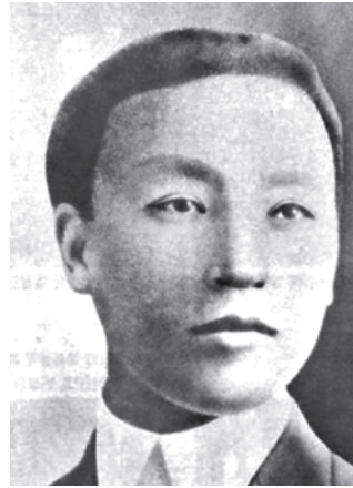
Dr. Syngman Rhee

The "March 1 Movement" spawned no less than five provisional governments in Seoul, Vladivostok, and Shanghai. They were finally united in Shanghai on 9 November 1919 as the Provisional Government of the Republic of Korea. American-educated Dr. Syngman Rhee was named president and General Li Tung Hui, the prime minister. 3 Today, both North and South Korea celebrate Samil Undong Il —"March First Movement Day"—that symbolizes the struggle for independence. 4