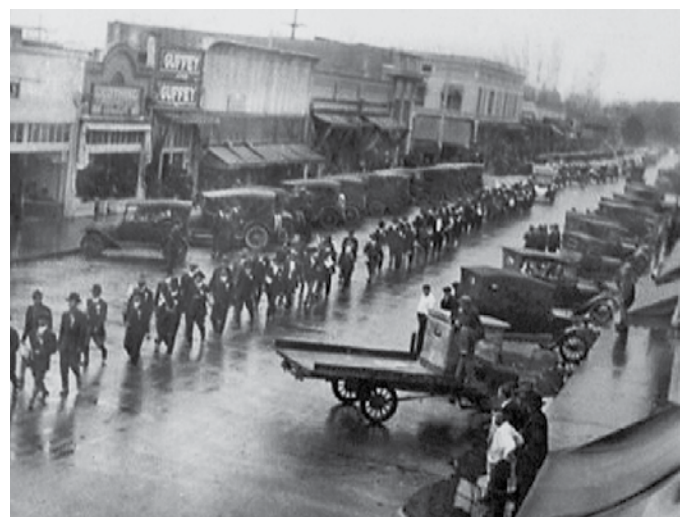
In 1920, Korean communities in California marched in support of the independence movement at home.