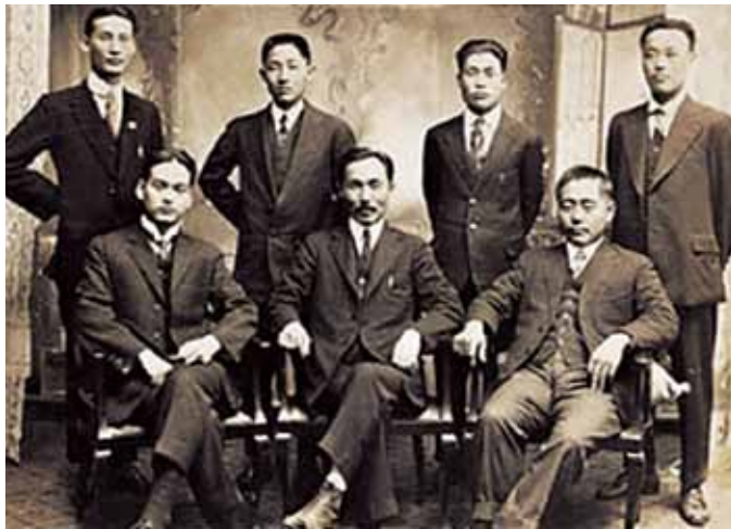
Early Provisional Government of Korea, circa 1919.