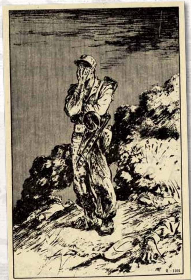
Leaflet #1101 is a two-sided anti-morale flyer targeted towards NKA and North Korean civilians. The back side is printed with the message: "I believed that the war would end soon, that I would be able to return home safely."