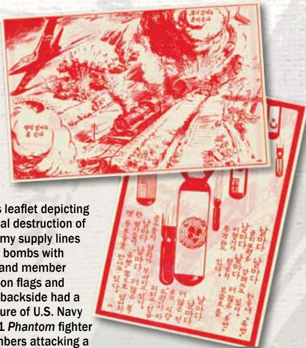
This leaflet depicting aerial destruction of enemy supply lines had bombs with UN and member nation flags and the backside had a picture of U.S. Navy FH-1 Phantom fighter bombers attacking a train, railroad bridge, and a North Korean truck convoy.