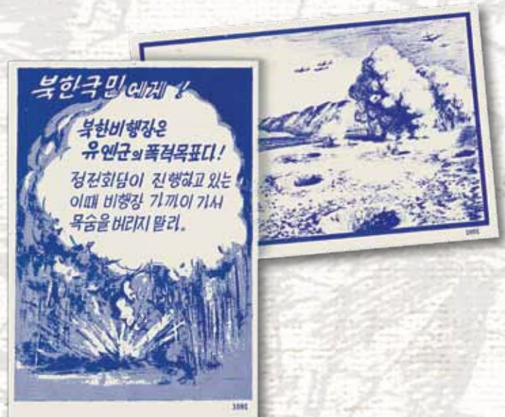
This “Bombing of North Korean Airfields” leaflet showed a bomb-pocked North Korean airfield after B-29 Superfortress raids.