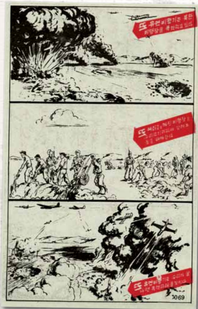
Leaflet #1069 was designed to dissuade North Korean civilians from repairing military airfields. The three panels show the bombing, repair, and return attacks by United Nations bombers.