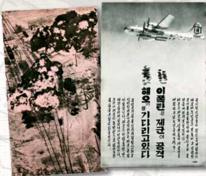
A B-29 Superfortress bombing North Korean industrial targets was used on one side and the back was an aerial photograph of a rail yard being hit with high explosive bombs.