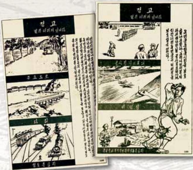
This leaflet contained detailed pictographs for illiterate North Korean civilians.