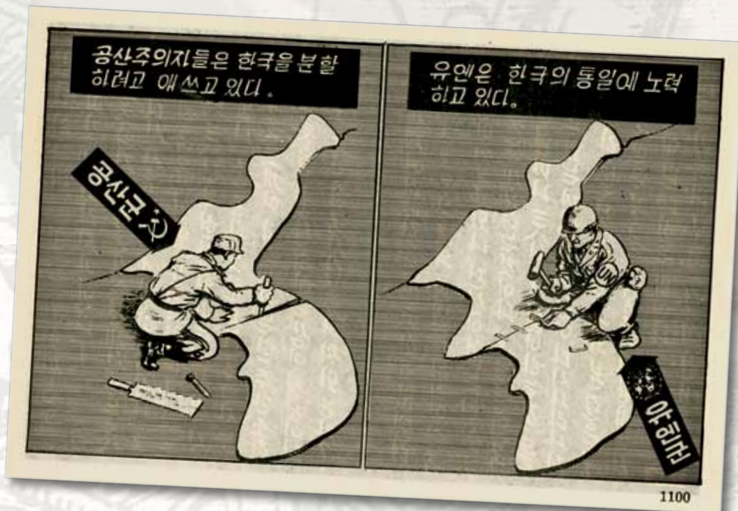
Leaflet #1100 emphasizes the Communist intent to divide the country on the 38th Parallel.