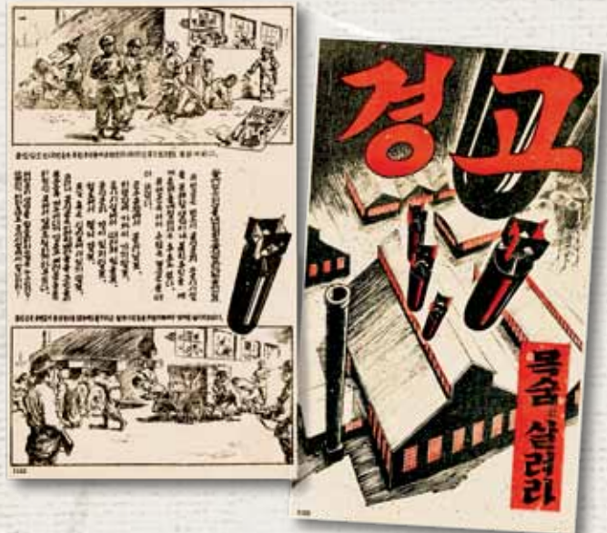
A graphic depiction of bombs falling on a munitions factory was back-sided with a three-part pictograph showing North Korean police confiscating warning leaflets and civilians being forced to work despite the bomb threat.