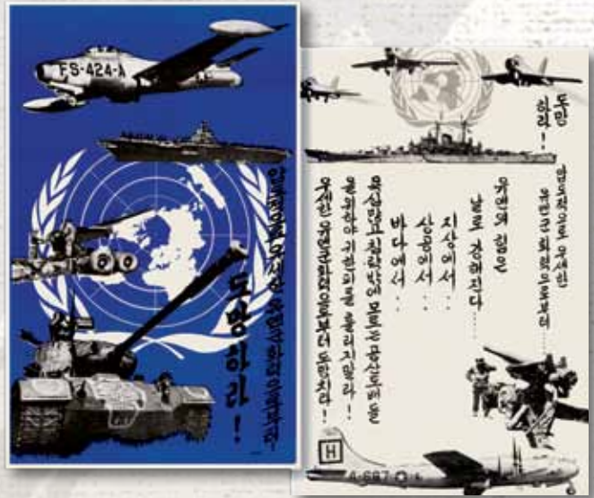
Designed to emphasize UN materiel superiority the sides of this leaflet had pictures of a B-29 Superfortress, F-84 Thunderjet fighter bomber and F-86 Sabre fighter jets. A 155 mm "Long Tom" and 8" heavy artillery, an M-46 Patton medium tank, a battleship, and an aircraft carrier were overlaid on a blue & white UN flag.