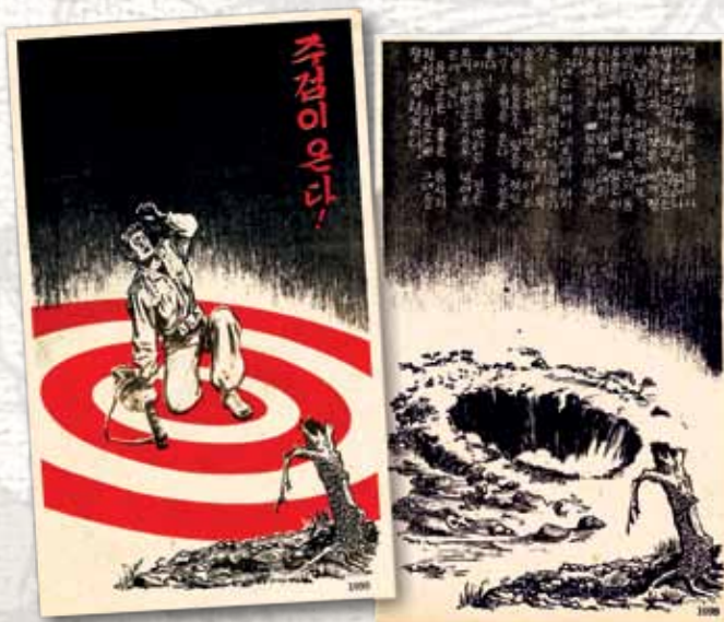
“UN Artillery Power” depicted a North Korean soldier kneeling in the center of a large bulls eye and on the opposite side, the results: a large shell crater where the soldier used to be.