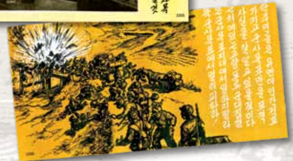
“Naval Power” contained a photo of a UN warship firing a broadside against North Korean coastal military targets. The backside had a graphic depiction of the destruction. It was designed to warn civilians away from military targets and discourage North Korean troops.