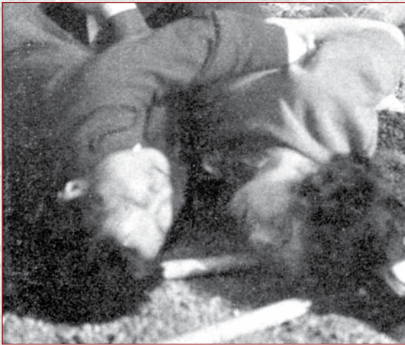
Holding one another and loudly moaning, "Let us die! Let us die!" an injured Communist couple dramatically posed for the cameraman. Police gave them first aid.*