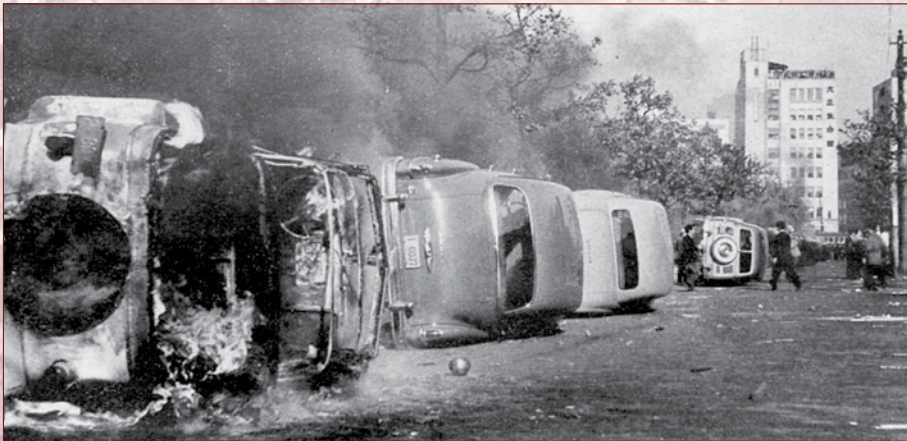
A score of American vehicles, overturned and set afire, were a haunting reminder that the Occupation era was over.*