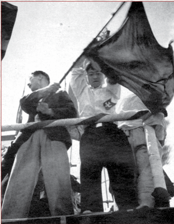
Communist leaders yelling "Banzai!" exhorted the confused crowd to fall in line for a march to the Imperial Palace, three miles away in central Tokyo.*