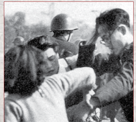
An injured, bespectacled student is helped to safety by girls stationed nearby.*