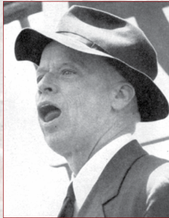
Norman M. Thomas, American Socialist Party, was among the sponsored speakers forced off the platform.*