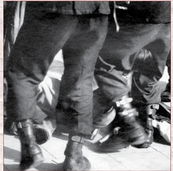
A policeman holds a Communist leader in a headlock while his comrades surround the prisoner.*