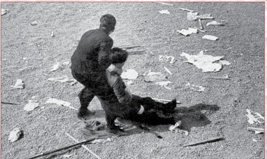
An injured, unconscious policeman is dragged away from the Imperial Plaza cluttered with abandoned bamboo poles, pipes, and placards.*