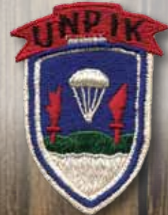
United Nations Partisan Infantry Korea (UNPIK) Unofficial Shoulder Patch