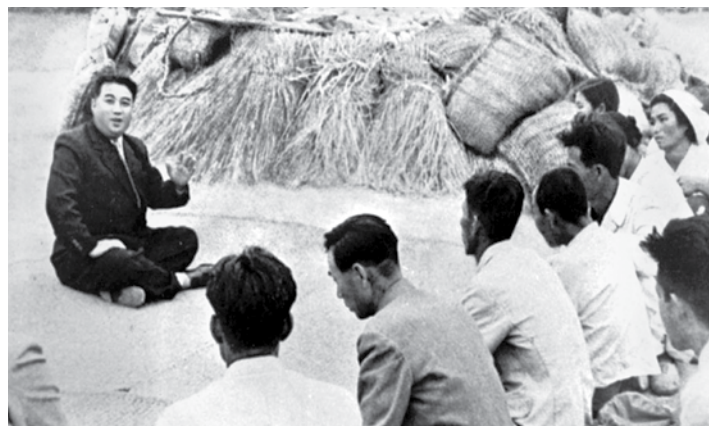
Communist leader Kim Il Sung lectures farmers from Kangso Gun (County), South Pyongan Province in North Korea, October 1945.

That legislation constituted the first step of a social restructuring within the north and the initial phase in the later forming of collective farms. Increased agricultural 'taxes' and inflated assessments then tied the rural farmers to support of government policies by forcing them to pay up to 70 percent of their crops to the government. Furthermore, in 1947, nationalization placed "over 90 percent of industry's 1,034 important factories and businesses" under direct control of the government. A succession of national conscription acts then inducted most young men into either the highly regimented NKPA or in forced labor projects. Religious organizations and oppositional political parties were persecuted through widespread extra-judicial jailing or executing of anti-Communist or pro-democracy leaders and supporters. All of these policies elevated trusted Korean peasants to positions of authority while demeaning the educated and/or skilled middle and upper-classes. As power began to concentrate around charismatic Koreans like Kim Il Sung, they employed their popularity to further purge rivals, punish protesters, and hold tightly the reins of power. 11