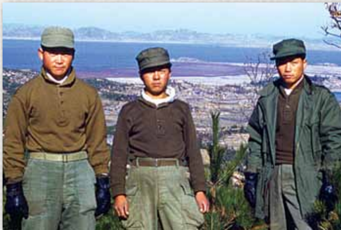
Three North Korean guerrillas on one of the western islands. The coast of North Korea’s Hwanghae Peninsula is visible in the background.

Although individual motivations for opposing Communism varied, by the end of 1950 those feelings brought most resisters together so that they were united in their fight against Kim Il Sung’s forces. Always on their mind was the forlorn hope that a renewal of the UN offensive would provide them with the opportunity to again free their homeland.