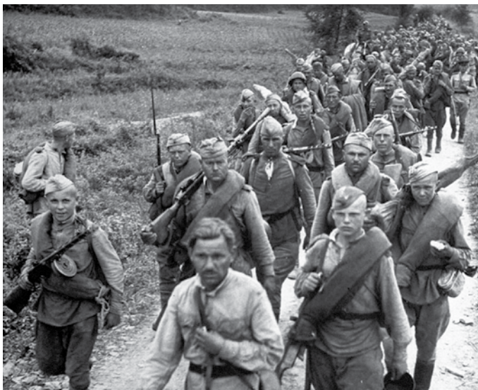
Soviet soldiers march through North Korea as occupying force, October, 1945.

In an effort to resolve the problems of restoring sovereignty to the Korean people, the United States and the Soviet Union