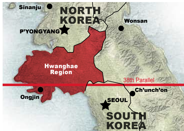
Map depicting the location of the Hwanghae region in North Korea.

In the winter of 1950/51, UN forces blunted the combined Communist Chinese and North Korean offensive. Allied planners began considering options to reunify the peninsula and factored the potential combat power of the partisan North Koreans behind the enemy lines into their plans. As one contemporary study noted, "a number of remote little islands in the Yellow Sea, unnoticed before . . . suddenly had become last-stand strongholds of North Korean antagonists to the Communist regime." 25 One EUSA officer concluded: "These volunteers have organized themselves, appointed leaders and, by virtue of their own initiative, have overcome numerous hardships while effectively combating [the enemy] and securing intelligence." He also asserted that "These groups possess