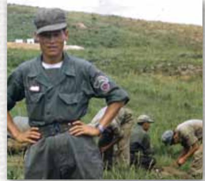
Guerrilla leader oversees weapons training on one of the western islands.

convinced village doctors and town officials to exempt fellow anti-Communists from the draft by certifying them unfit for service. He also became a guerrilla leader. 4