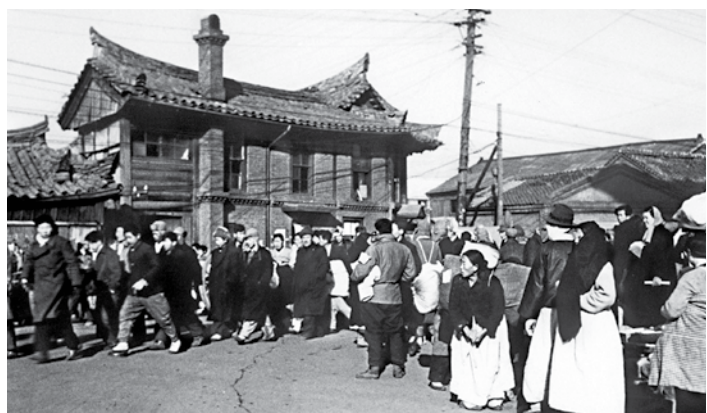
North Korean refugees in P'yongyang await evacuation to South Korea.

the will to resist, and if supplied, organized, and properly employed, would form the nucleus of an ever-growing liability to the Communist Forces." 26 How to get them committed to the UN effort remained to be seen.