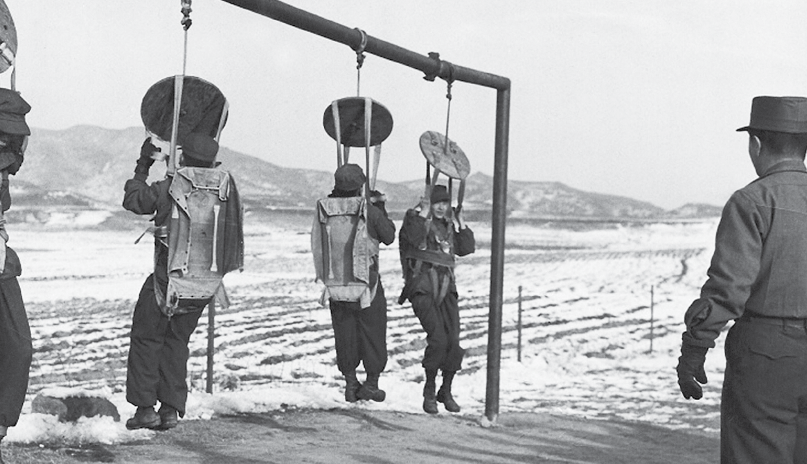
North Korean guerrillas conducting suspended harness parachute training.

The situation brings up a disturbing point: if Americans had participated in those later operations it seems doubtful that FEC would have continued to parachute units to their deaths like it did with the all-Korean groups. Some corrective actions would have been taken to increase the chances of recovering their personnel. Evidently, the FEC considered indigenous troops expendable and believed that by removing Americans/British from participation in missions such as these, there would no longer be a need to plan for extracts in event of emergencies. 6 As a result, more than 400 Korean guerrillas were parachuted into North Korea between 22 January 1952 and 19 May 1953 and none were ever seen again. 7 †