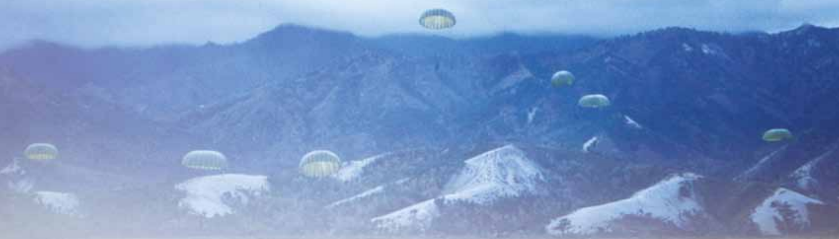
North Korean guerrilla parachute training.