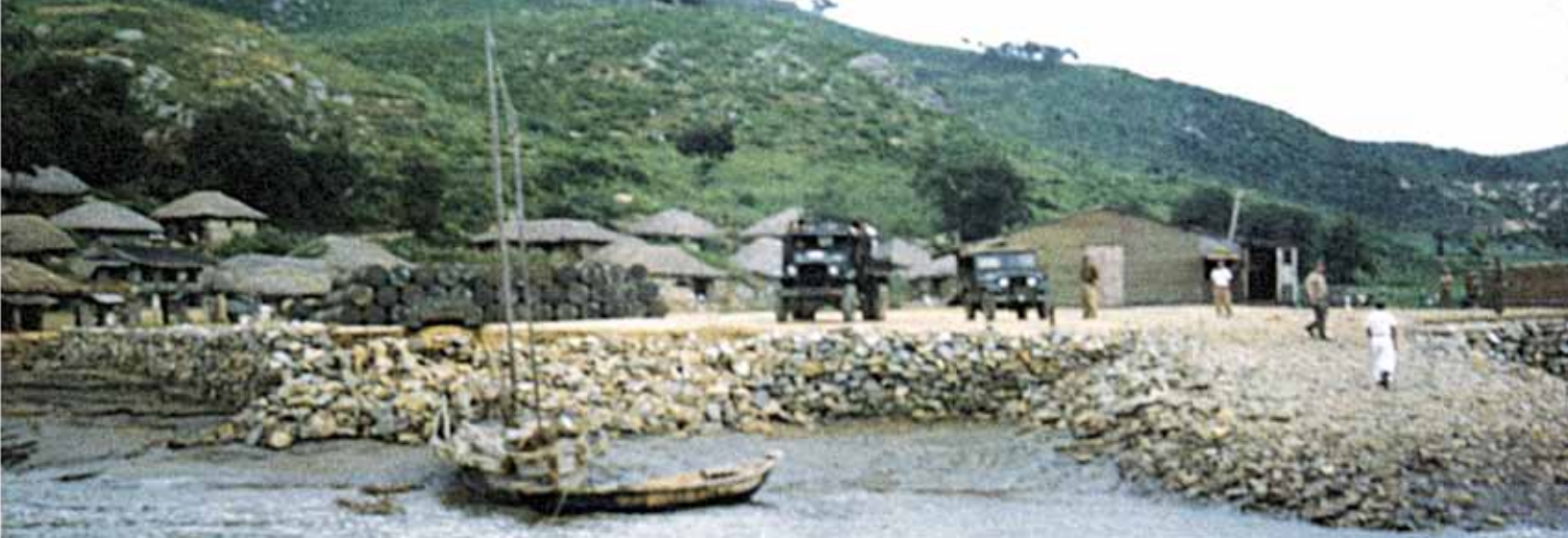
Supplies reached the guerrilla units by sea. The stone causeways were the landing areas where the supplies were off-loaded into U.S. Army trucks.