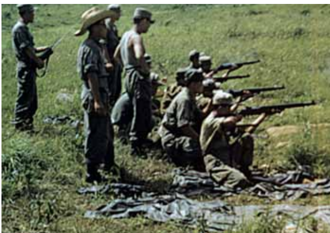
The anti-Communist guerrillas occupying the islands off the coast of Korea provided a valuable source of manpower to the UN forces. American Special Forces advisors helped to train the guerrillas in the late stages of the war.

Ultimately, three sub-commands controlled guerrilla operations; initially LEOPARD BASE and later WOLFPACK on the West Coast, and Task Force (TF) KIRKLAND on the East Coast. The support element, BAKER Section, was initially located at the EUSA Ranger Training School at Kijang near Pusan, and used C-46s and C-47s to support airborne training and to conduct aerial resupply and agent insertions. BAKER Section later moved to K-16 Airfield outside Seoul, after the capital was retaken a second time. 7