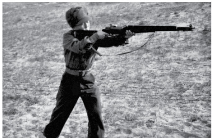
A young guerrilla with an M-1 Garand rifle. Boots were not the only equipment that was often too big for the user.