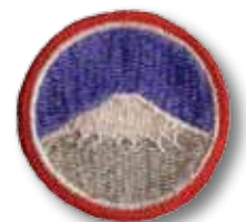
Far East Command SSI