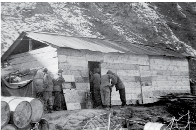
Supply room on Kangwha-do. A solid, windowless building was a prerequisite for the storage of supplies to prevent the entrance of rats and the exit of supplies.