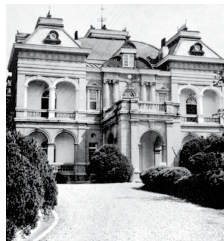
The Headquarters of the 8240th AU in Seoul. The administration and logistical support to the American advisors emanated from this unit of the guerrilla command.