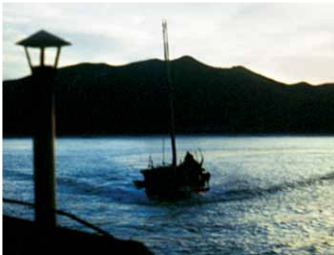
Towing a sailing junk. Often one motorized junk would tow three sailing junks on an operation.