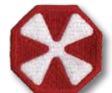
Eighth United States Army SSI