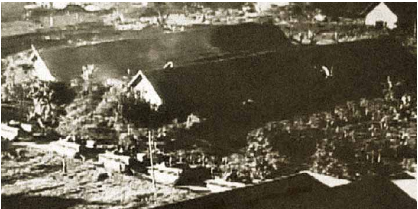
Aerial photograph of some of the Los Baños prison camp barracks taken during the rescue operation. Note that the amphibious tractors used to transport the rescued prisoners of war (POWs) are visible in the lower left corner.