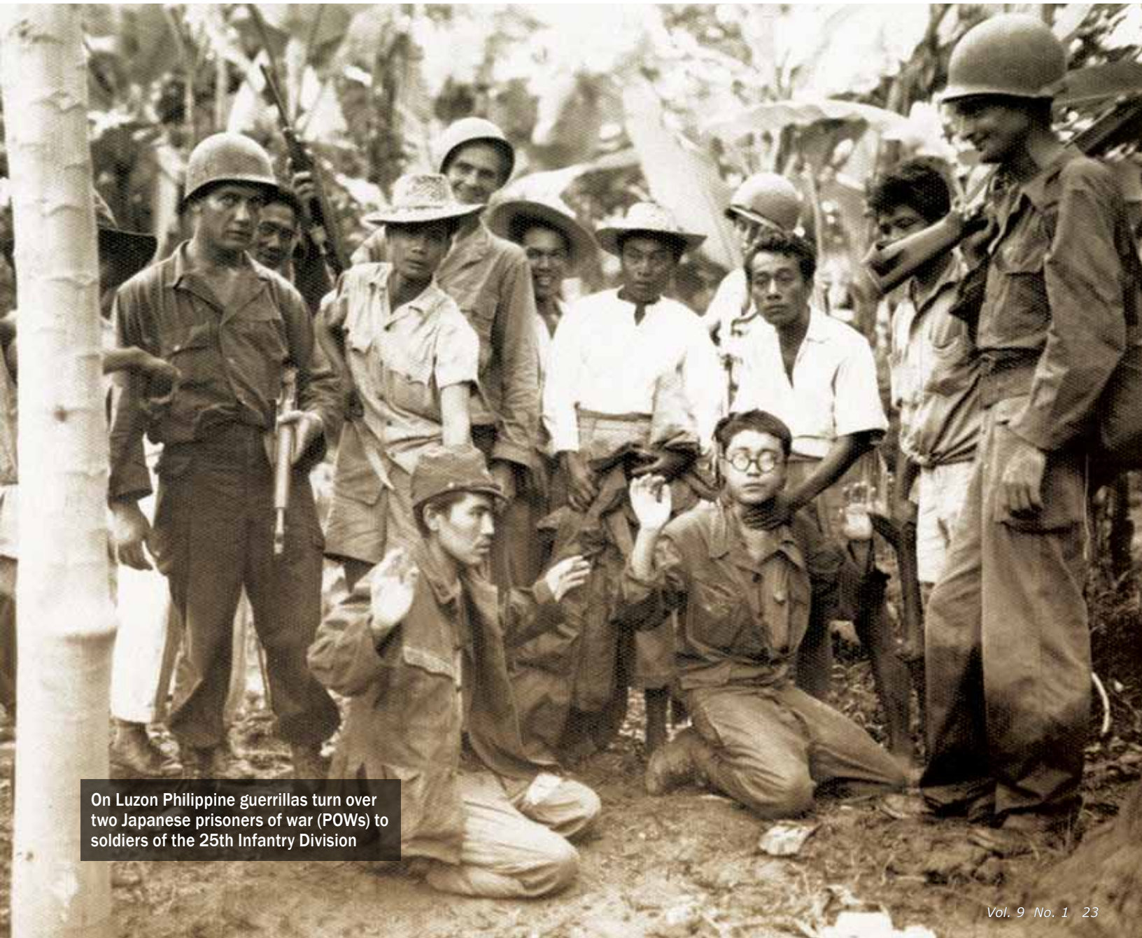
On Luzon Philippine guerrillas turn over two Japanese prisoners of war (POWs) to soldiers of the 25th Infantry Division